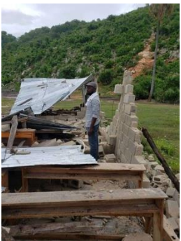
The remains of one of the Moravian Buildings in Haiti

The worst effects of the August 14 earthquake and the tropical storm that followed it are over. However, in Haiti, transportation is difficult, political tensions are high, and rival gangs control large areas of the country. Having spoken to leaders in Haiti, they are thankful that the $17,500 already sent from the Board of World Mission is on its way, but they also tell us that this will be a long-term process and will take lots of prayer, patience, and persistence. People who lost their homes are still living in the streets, water and food are scarce, and medical care is hard to come by. Please pray for the Moravian Church leaders and their