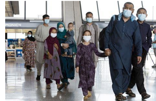
Afghan families seeking safe shelter

The US and Canada continue to see rising numbers of Afghan refugees fleeing this war-torn country. We encourage congregations to follow the Biblical call to welcome to the foreigner by helping these families as they begin their new lives in North America. The BWM is