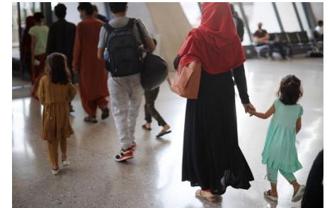
Afghan families seeking safe shelter

With the withdrawal of military personnel and foreign citizens from Afghanistan now complete, many Afghans are seeking to find refuge in the US and Canada. As Christians, we share in a calling to welcome those who are seeking safe shelter. In this effort, the BWM is partnering with Church World Service to support this urgent need. We encourage congregations to work with the local agencies that might be sponsoring resettlement efforts in their area. This would include providing help with housing and utilities, providing English language and job training, and providing money to purchase clothing and items needed for setting up their new home. We invite everyone to join in prayer, love, and action to protect those fleeing violence and persecution.