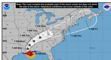
Hurricane Ida makes landfall in Louisiana

As this report is being prepared, reports of damage from Hurricane Ida are just beginning to come in. This was a major Category 4 hurricane when it made landfall in Louisiana, and damage assessments are expected to be high and likely loss of life. We have initiated discussions with our ecumenical