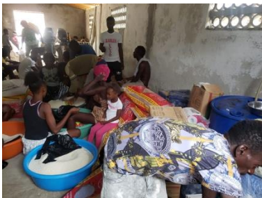
Food and materials being distributed in Anse de Nau, Haiti

On August 14, a devastating 7.2 magnitude earthquake hit southwestern Haiti. At present, the death toll is over 2,200 persons, with over 12,000 injured. Haiti is a Mission Area of the Moravian Church with a dozen congregations and is jointly supervised by the Eastern West Indies and Jamaica Provinces. Moravians in the capital city of Port-au-Prince have already sent teams into Jacmel and