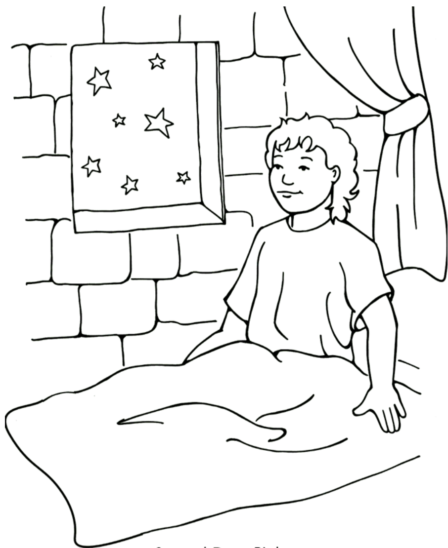
Samuel Does Right 1 Samuel 2-4, 7