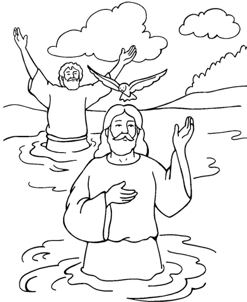
John Baptizes Jesus Matthew 3, Mark 1, Luke 3

From Thru-the-Bible Coloring Pages for Ages 4-8. © Standard Publishing. Used by permission. Reproducible Coloring Books may be purchased from Standard Publishing, www.standardpub.com , 1-800-543-1301.