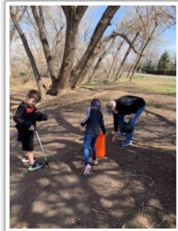
Cleaning up dirt hills in Shadow Mountain Park

Plan to spend the morning with us and stay for lunch and the dedication! If you will join us for lunch, please RSVP the number of adults/kids in your party by May 2 nd to ralstonvalleycoalition@gmail.com