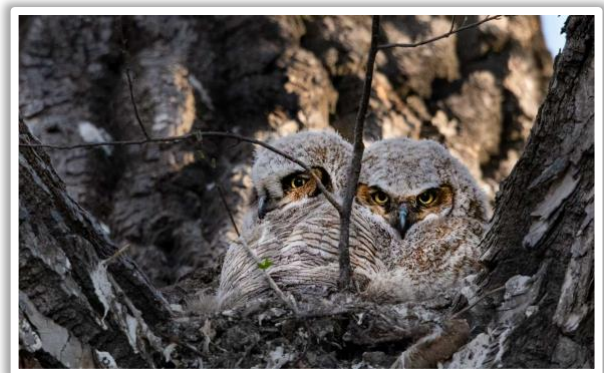
Great Horn Owlets, Shadow Mountain Park

"Never doubt that a small group of thoughtful citizens can change the world; indeed, it's the only thing that ever has." Margaret Mead