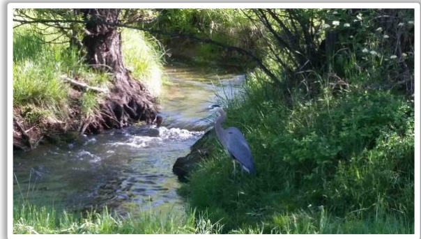
Blue Heron hunting on Ralston Creek, Maple Valley Park

For now, the wildlife in Maple Valley Park are breathing a sigh of relief. Did you know that Maple Valley Park is a birding hotspot with 99 species documented? Check it out at http://ebird.org/hotspot/L1365529