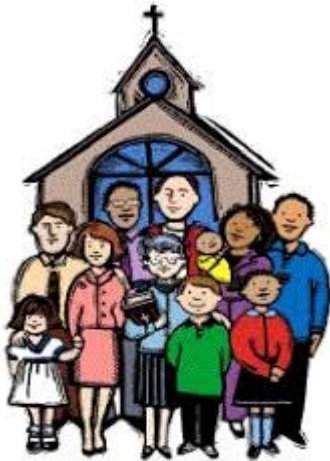
Our Church Family