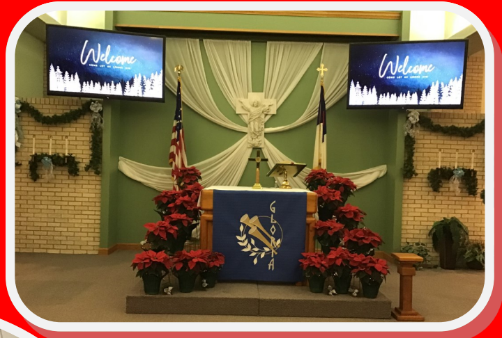
A beautiful altar with all the poinsettias.