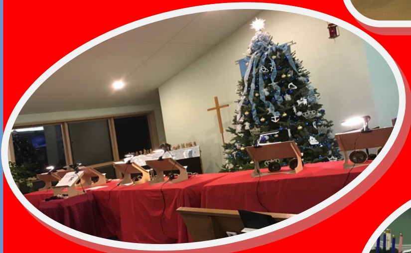
We are all set up for the handbell ringers to play during the service.