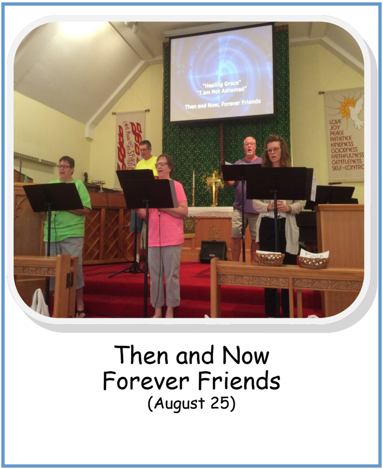
Then and Now Forever Friends (August 25)

Then and Now, Forever Friends from Pecatonica. (A free will offering of $96.00 was collected for this group.)