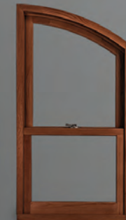
HALF EYEBROW OPERATING SINGLE HUNG

Complements design as a transom or picture. Available in over 75 call number sizes.