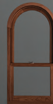
HALF CIRCLE RADIUS OPERATING DOUBLE HUNG

Versatile, standing alone or above a double hung. Available in 12 call number sizes.