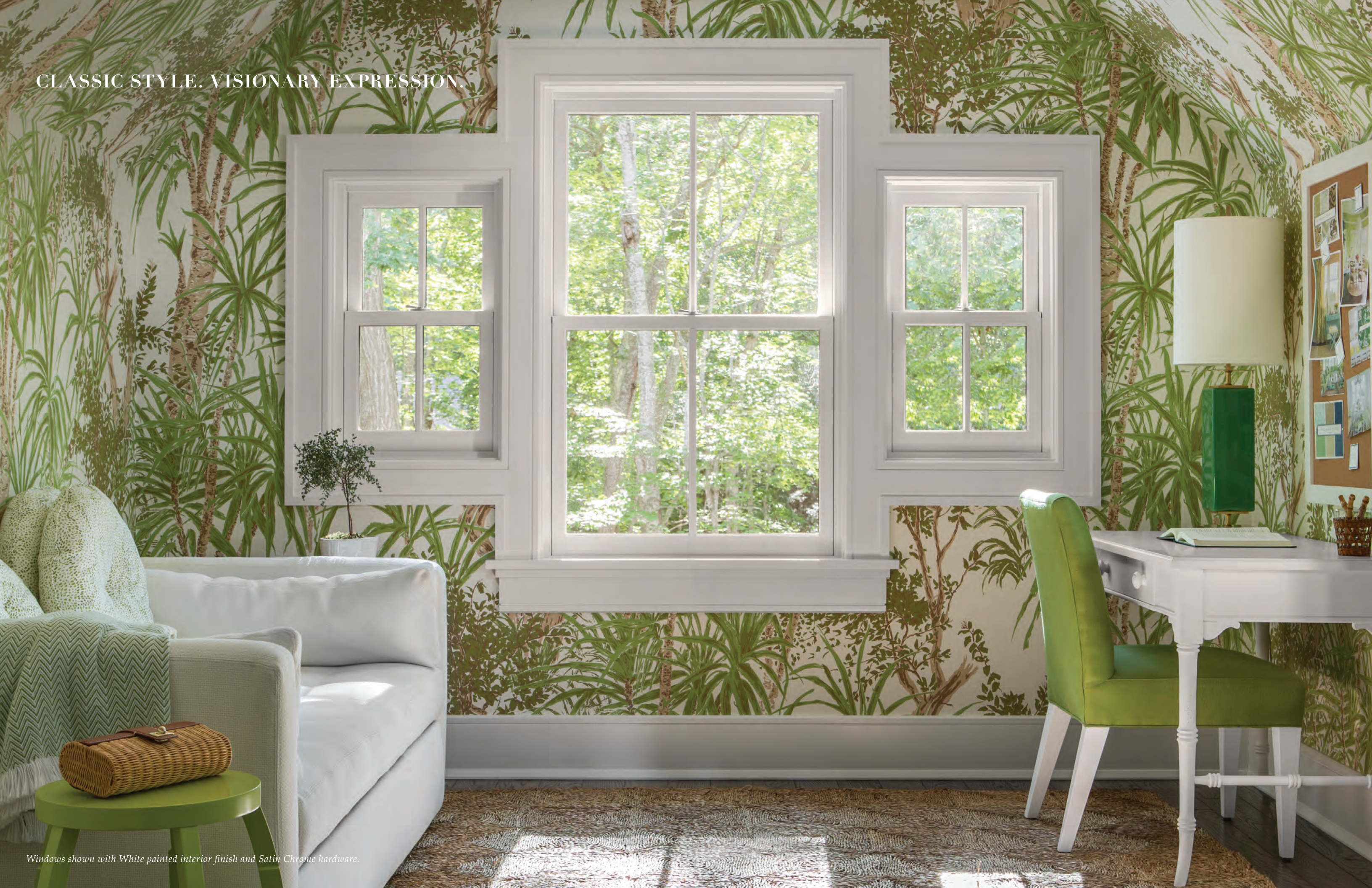
Windows shown with White painted interior finish and Satin Chrome hardware.