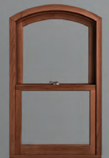
EYEBROW RADIUS OPERATING DOUBLE HUNG

An elegant curve creates striking beauty. Available in 189 call number sizes.