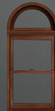
HALF CIRCLE TRANSOM

The Ultimate Double Hung Next Generation Window empowers design versatility with round top options for modern homes and historic renovations.