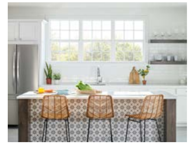
White Encompass by Pella single-hung windows with traditional grilles-between-the-glass and cam-action locks.