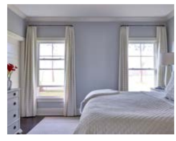
White Encompass by Pella doublehung windows with traditional grilles-between-the-glass and cam-action locks.