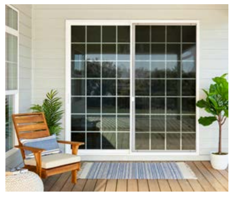
White Encompass by Pella sliding patio door with traditional grilles-between-the-glass.