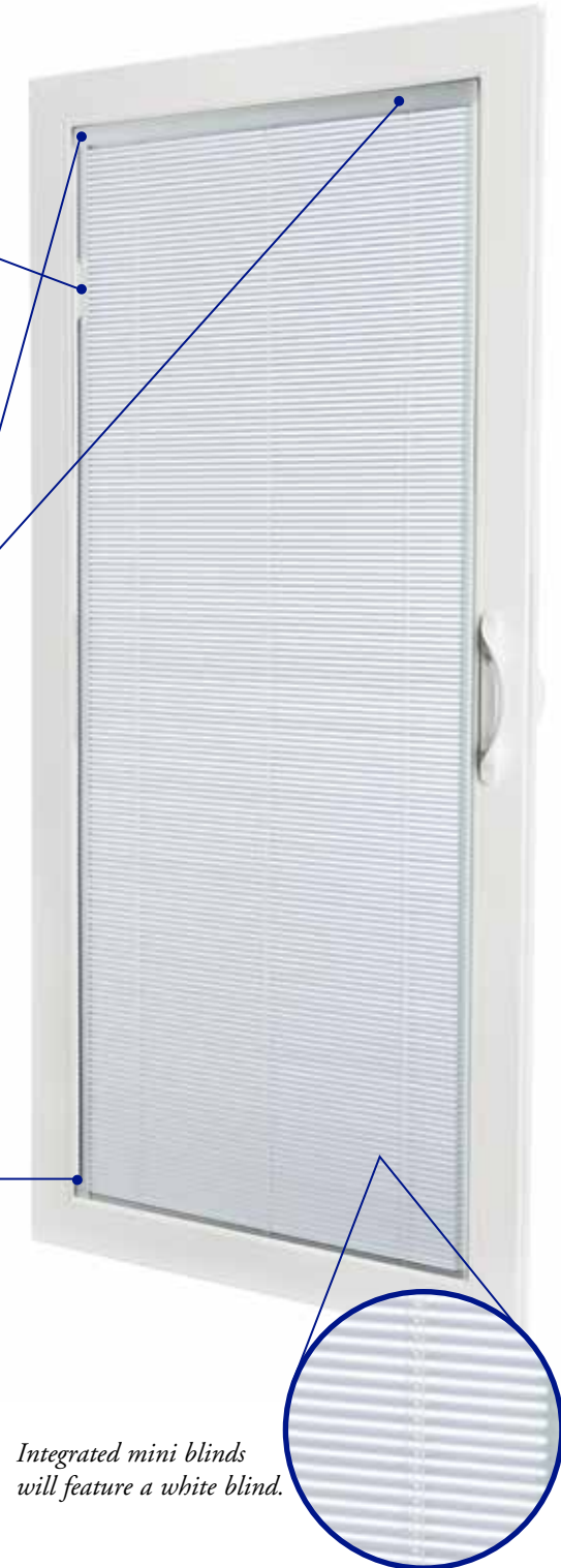
Integrated mini blinds will feature a white blind.

Dedicated to continuous quality improvement, this prestigious certification recognizes Alside's window plant operations for superior quality management in production of consistently high-quality, energy-efficient windows and patio doors. Alside is one of only a few U.S. window manufacturers to earn this world-class quality distinction.