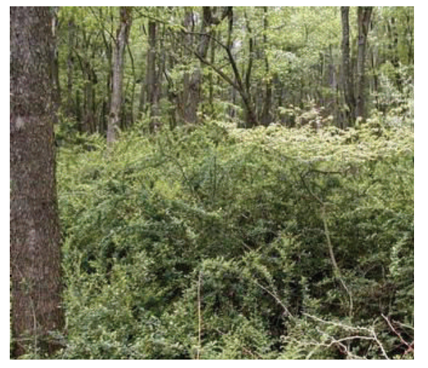
An infestation of Japanese Barberry in a forest