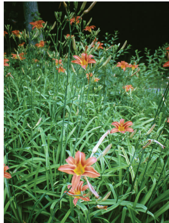
Orange Daylilies invading a woodland edge.