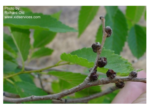
Twigs and shoots of a Siberian Elm