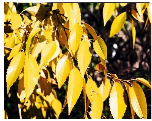
Yellow fall leaves of a Siberian Elm