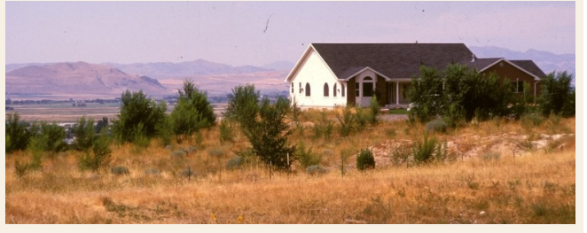
An infestation of Siberian Elm trees