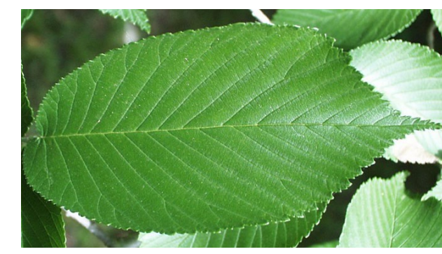
Slippery Elm leaf

The leaves are typically more than 3 inches long, which is larger than Siberian Elm leaves. The leaves are also very asymmetrical at the base and twice-serrate, unlike Siberian Elm's symmetrical and once-serrate leaves. The leaf tips of Slippery Elm abruptly come to a point. Leaves are sandpapery on both sides. In the fall, leaves turn a green-yellow, unlike the vibrant yellow that Siberian Elm leaves change to. The inner bark is sticky and fragrant. Trees can typically grow up to 60 feet tall.