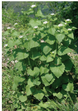
2nd year plant