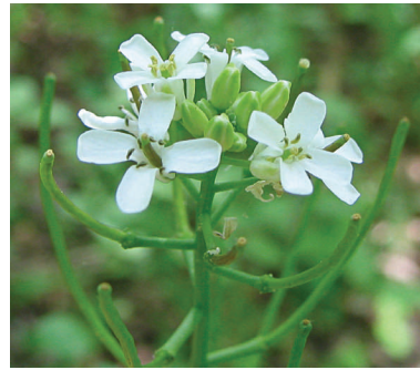
2nd year flowers and seed pods