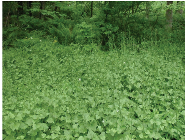
Garlic mustard invading a forest