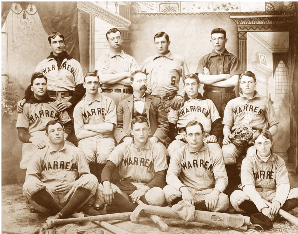
Warren, PA team of the 1895 Iron & Oil League. Honus Wagner pictured standing with the 'S' on his jersey for Steubenville.