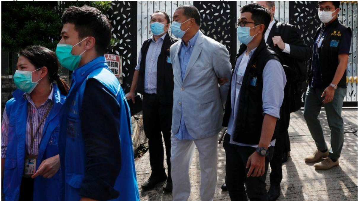
Jimmy Lai being arrested in Hong Kong

Jimmy Lai was born in Guangzhou, a city in southern China, to a wealthy family that lost everything when the communists took power in 1949. From working odd jobs and knitting in a small clothing shop he taught himself English, eventually founding the international clothing brand Giordano.