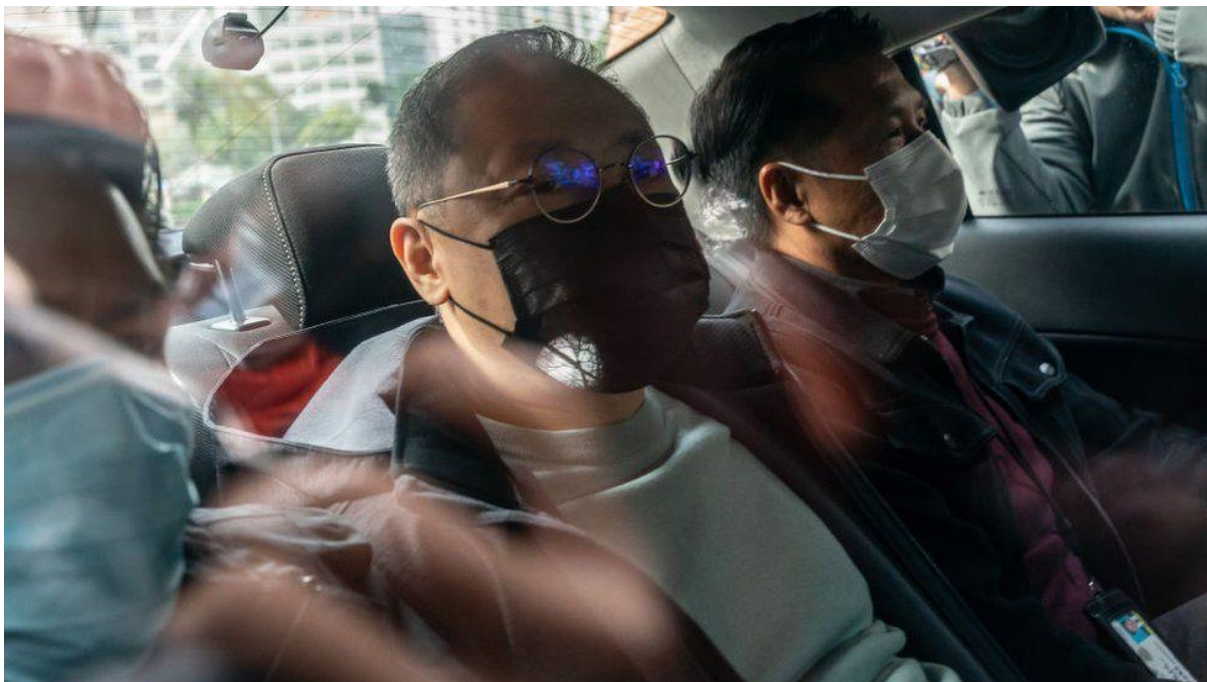
Benny Tai arrestado. Uno de los creadores de las primarias. In July last year, an alliance of opposition parties ran independently organised primaries to see which of their candidates had the best chances in September's election for the Legislative Council (LegCo), Hong Kong's parliament. More than 600,000 people voted in the primaries. The election was later postponed, with officials citing concerns over the coronavirus pandemic as the reason for the delay.