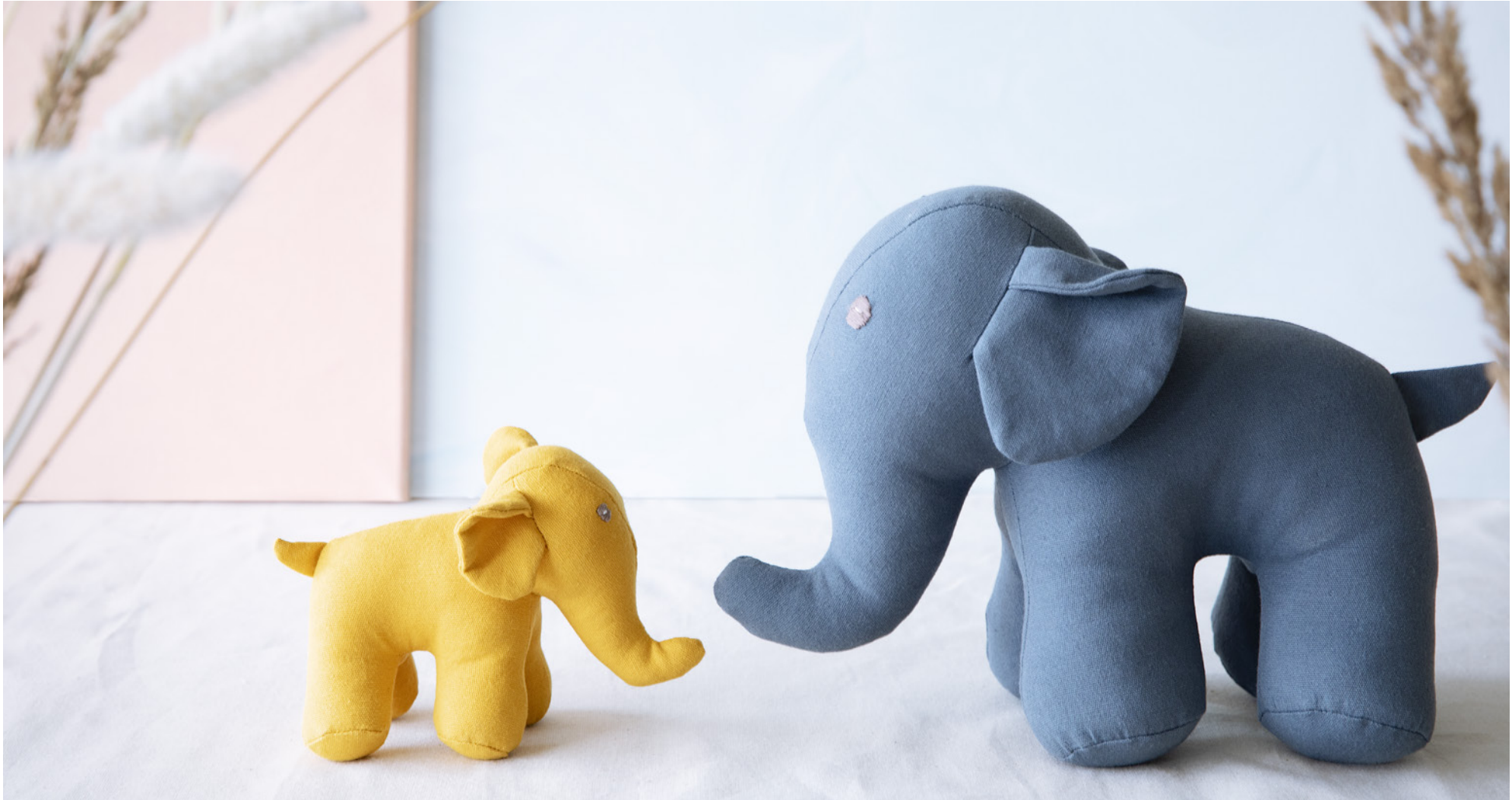
C0123 Hippo Canvas Yellow | C0124 Elephant Canvas Large Pink C0125 Elephant Canvas Large Grey