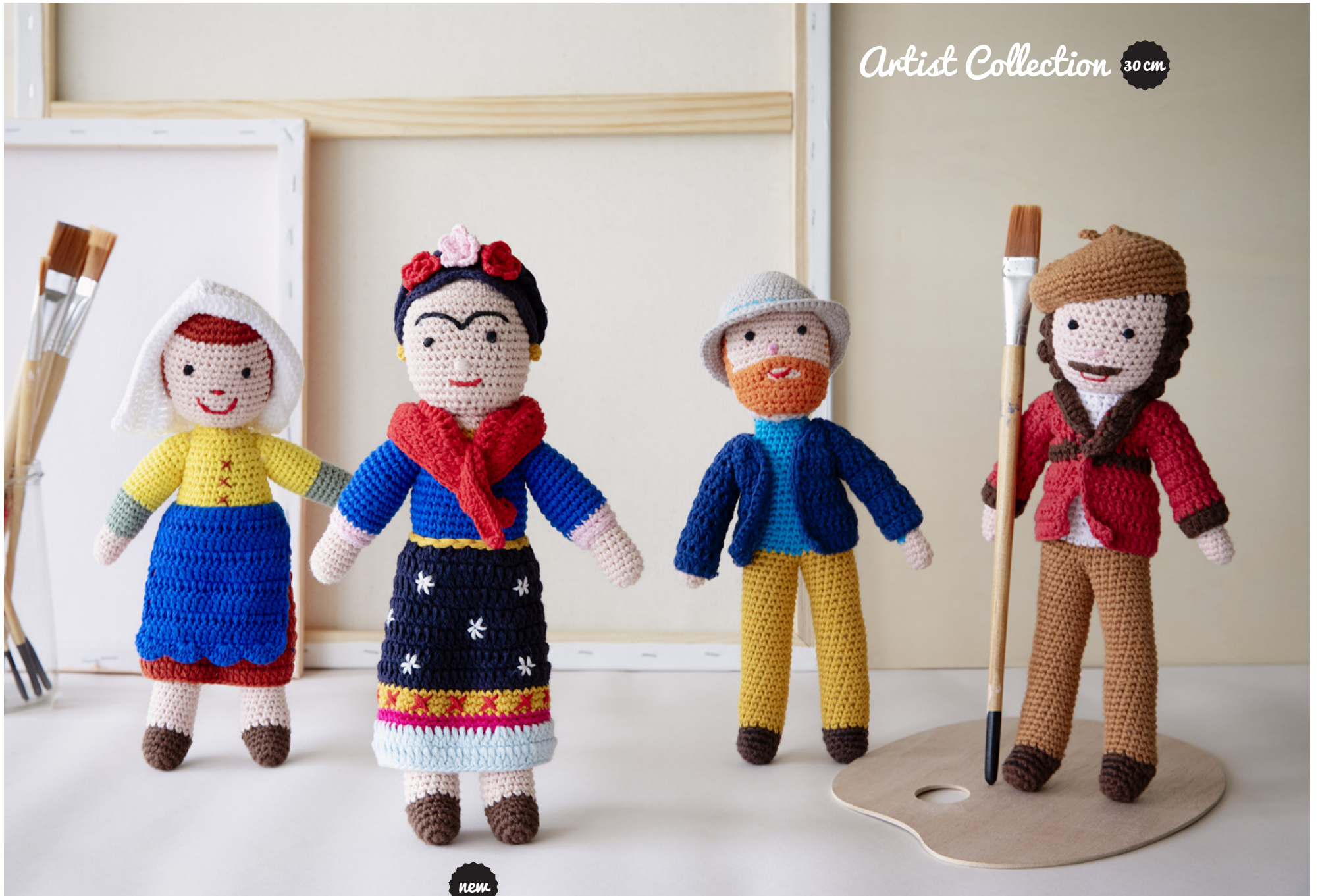
CM003 Crochet Vermeer - Milkmaid