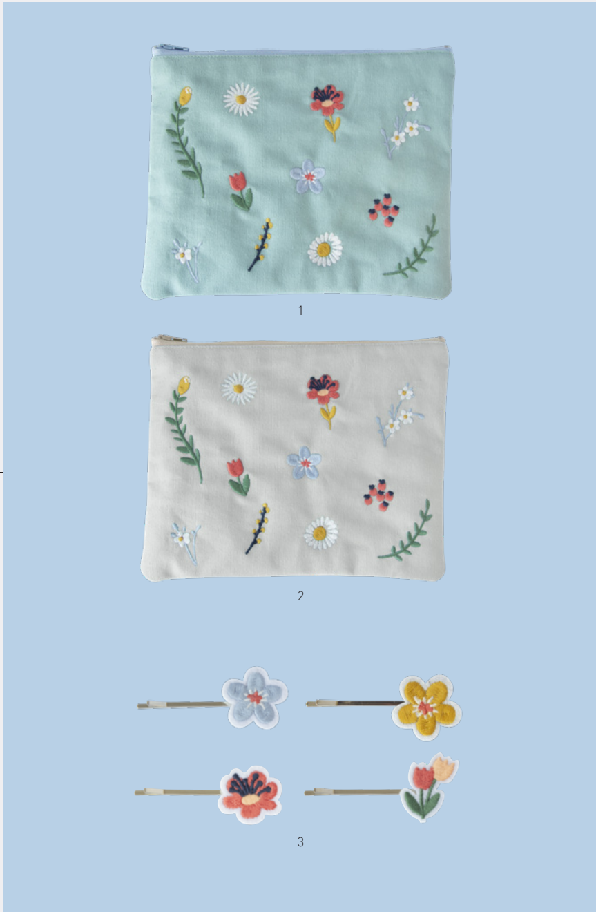
A0810 Pouch Embroidered Flowers Green | 2. A0811 Pouch Embroidered Flowers Oyster grey | 3. A0567 Hairpin Embroidered Flowers Assorted