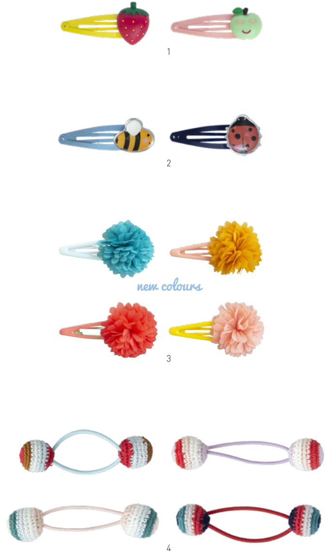
1. A0565 Hairclips Strawberry & Apple | 2. A0566 Hairclips Bee & Ladybird 3. A0568 Hairclips Dahlia Assorted | 4. A0520 Hair Elastic Crochet Balls Assorted