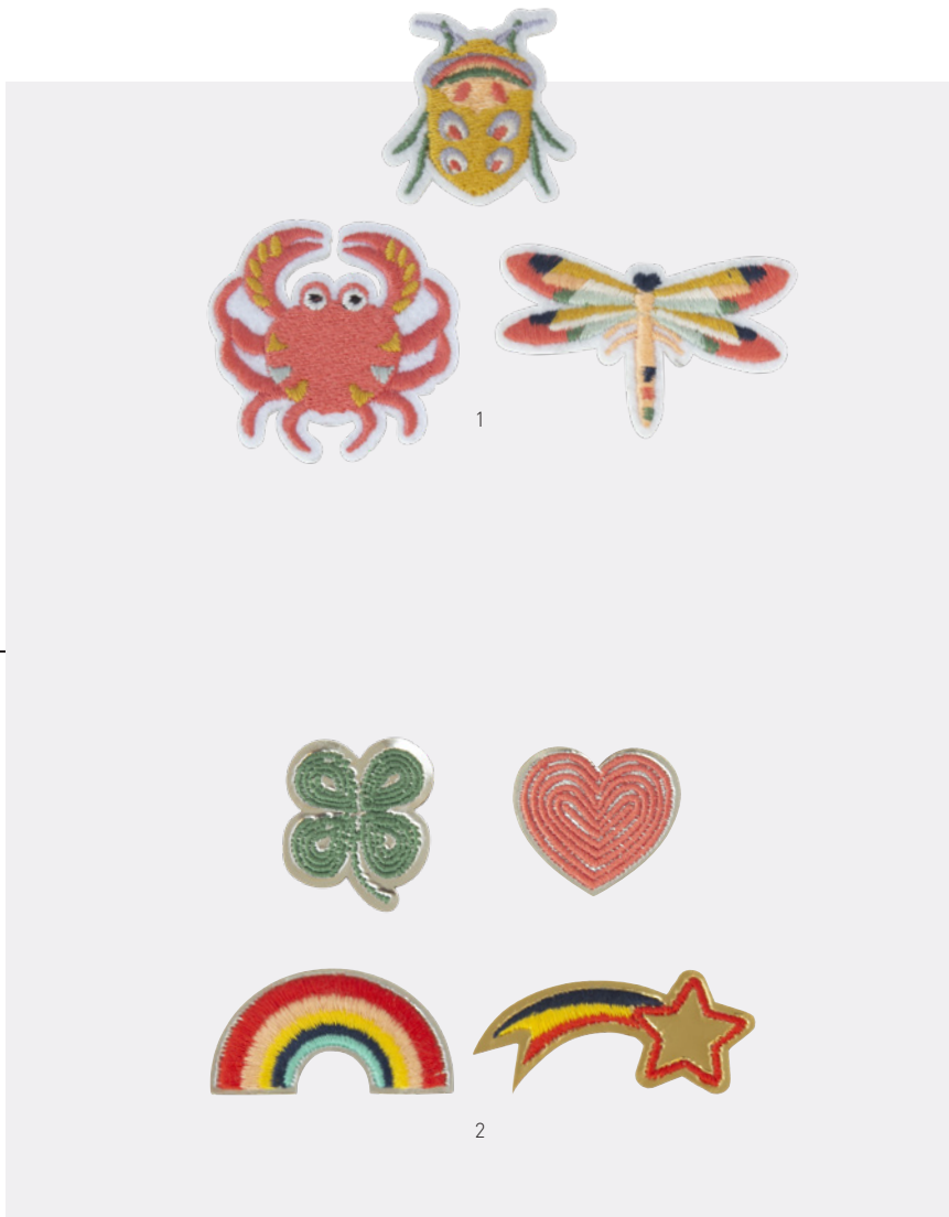
1. A1057 Brooches Cute Creepies 2. A1058 Brooches Lucky Charms