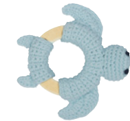
1. M0120 Crochet Musical Fish Yellow | 2. M0121 Crochet Musical Crab Coral 3. M0122 Crochet Musical Turtle Misty Blue | 4. C0235 Crochet Pacifier Cord Sea Animal Assorted | 5. C0236 Crochet Rattle Sea Animals Assorted 6. C0231 Crochet Playing Sea Animals Assorted