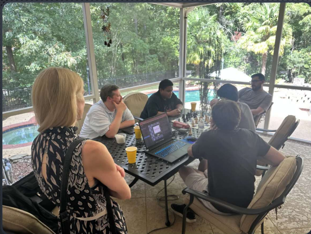
2024 Safe Play Training House Party