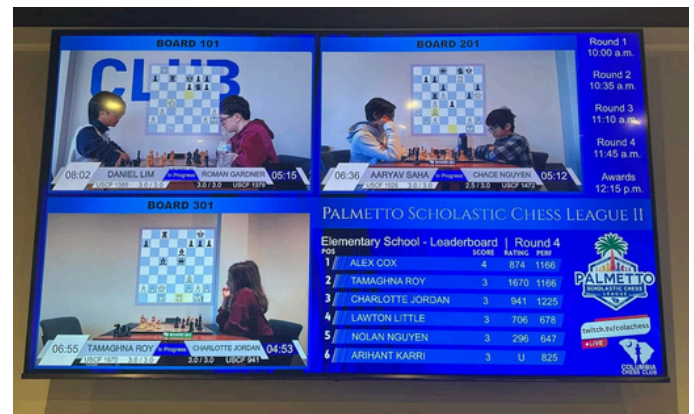
2025 Palmetto Scholastic Chess League