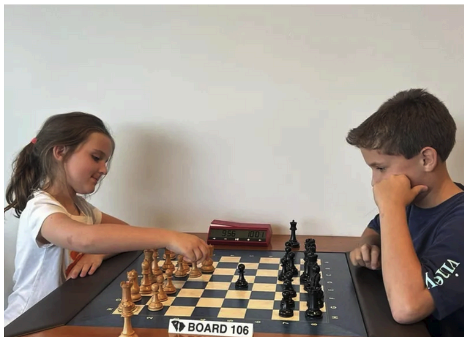
2025 Columbia Chess Club Kid's Night