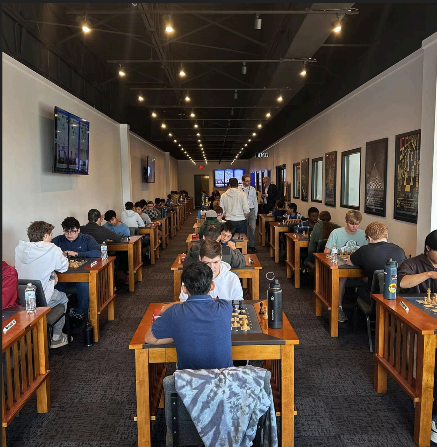
Palmetto Scholastic Chess League III, March 1, 2025