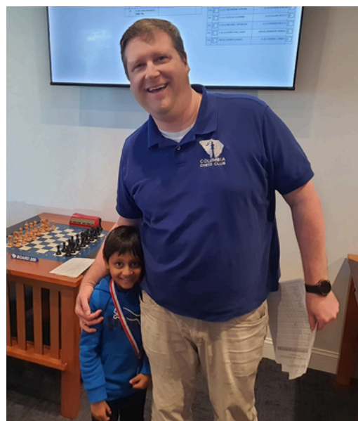
2025 Palmetto Scholastic Chess League