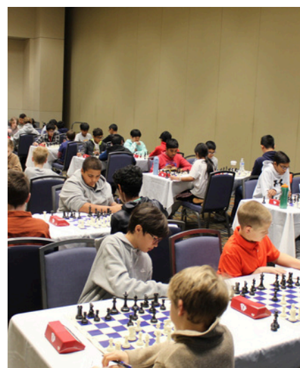
2025 Middle School Championship