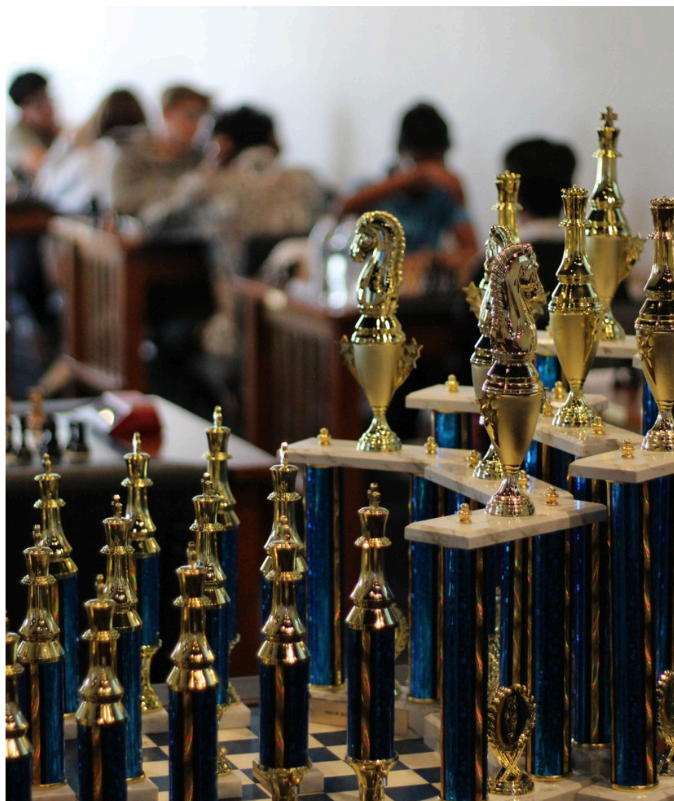
2025 State Chess Finals