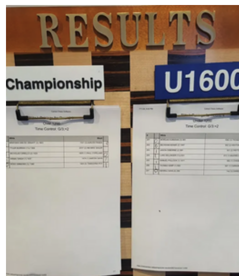
Results sheets posted in the Columbia Chess Club tournament hall.

When you are done with your game, you and your opponent should record the result on the paper pairings that are up in the pairing hall. You write a "1" next to the player who won, a "0" next to the player who lost, and in the event of a draw, you write a "1/2" or "0.5" next to both players, as shown in the photo example. You are done with your first round and are free until the next scheduled round. If you lost, you are not eliminated, and you should play all the rounds! In fact, it is typical that the winner of a tournament will not have a perfect score, so hang in there and enjoy the ride.