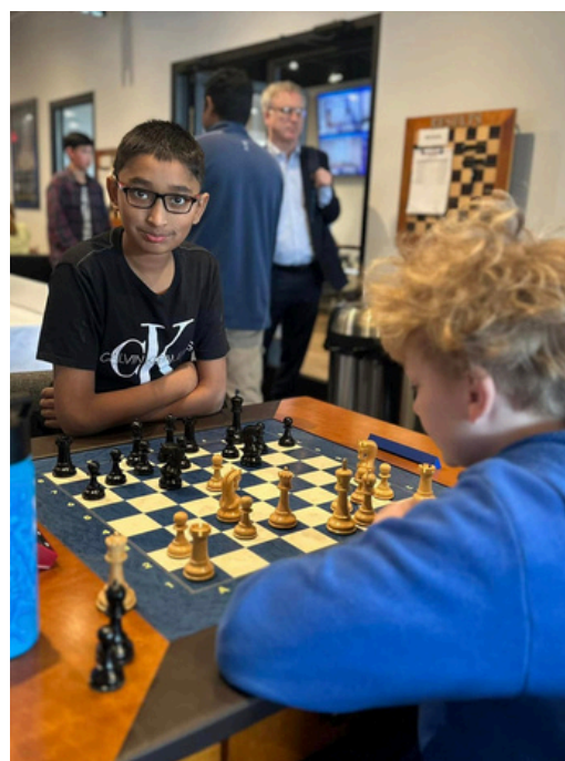
2025 Palmetto Scholastic Chess League