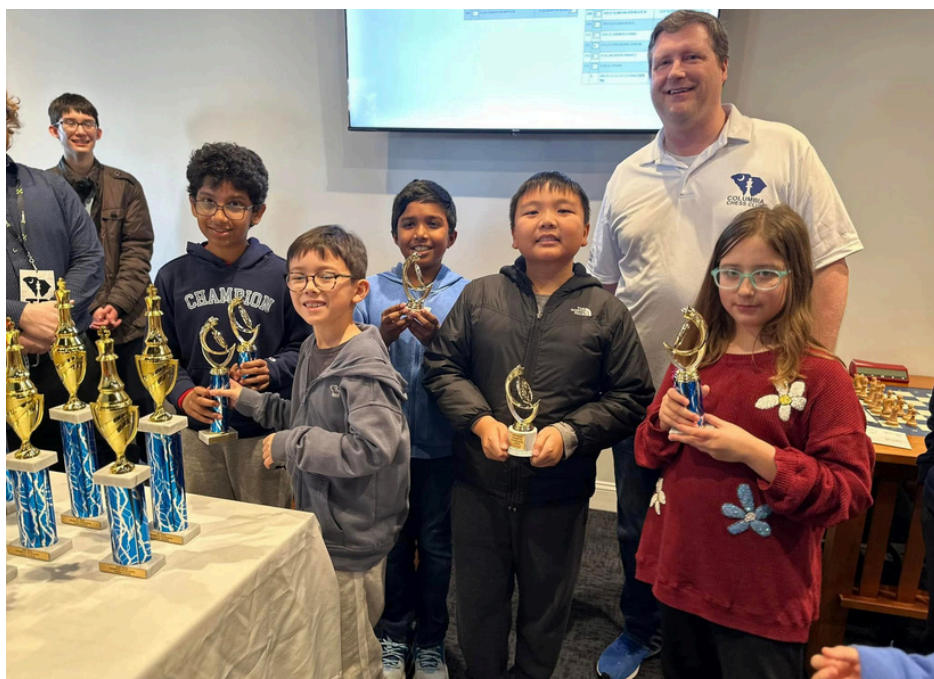
2025 Palmetto Scholastic Chess League

The top five players from each of the High School, Middle School, and Elementary School sections receive individual trophies. In the event of a tie for first, a blitz playoff is played between the players tied to determine first place. US Chess tiebreaks are used otherwise.