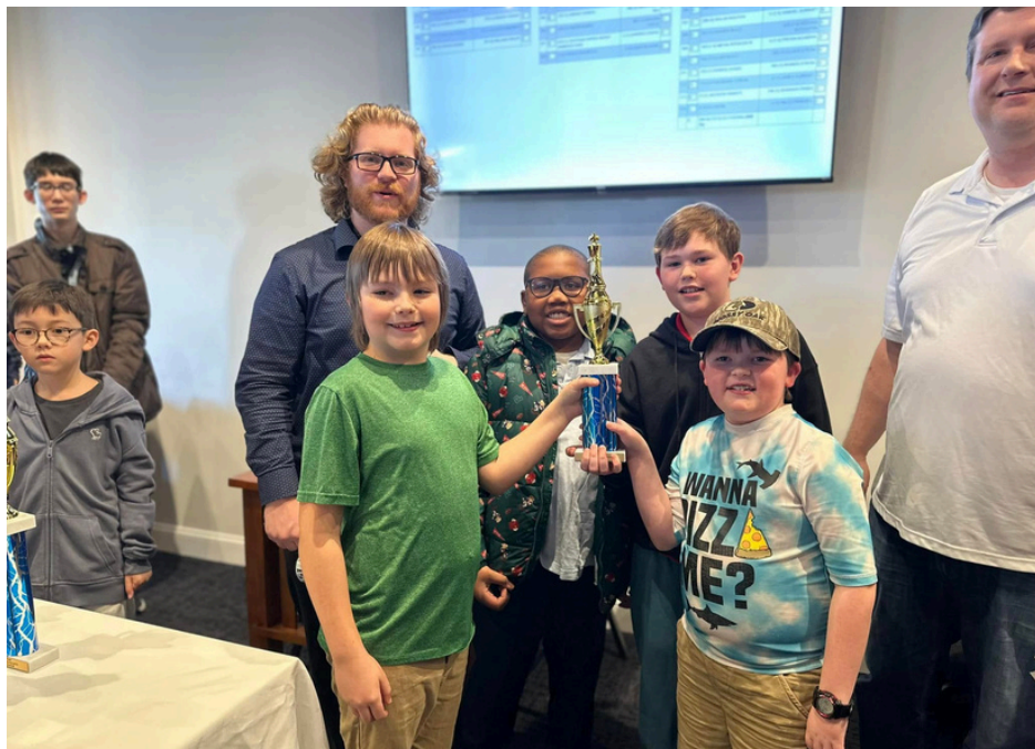
2025 Palmetto Scholastic Chess League

Trophies are awarded to first and second place teams in each of High School, Middle School, and Elementary School sections. The top three players from each school have their points combined to form a team score, and the school with the highest team score wins. Results will be reported to school administration. Homeschooling students may register with the school for which they are zoned.