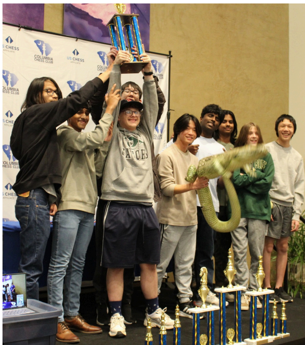
2025 High School Champion, River Bluff High School