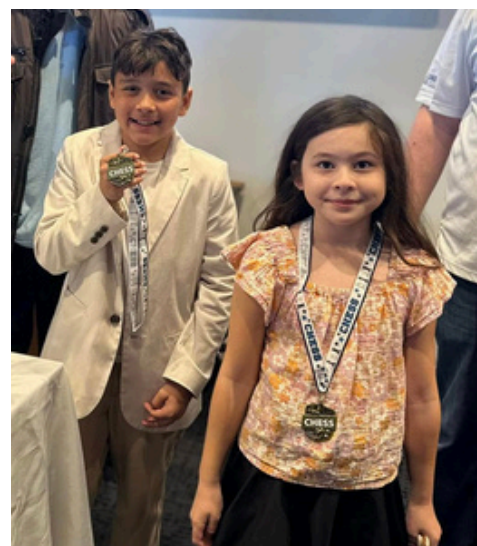
2025 Palmetto Scholastic Chess League