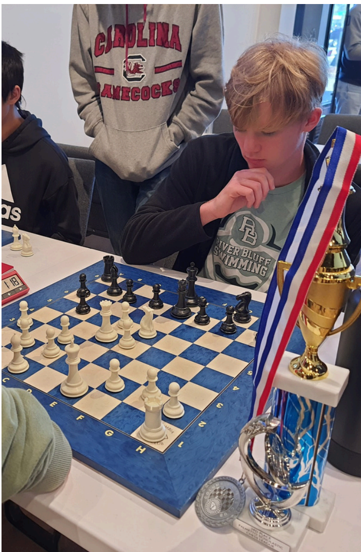
2025 Palmetto Scholastic Chess League

If you feel like your opponent is refusing to follow the rules, you should pause the clock and raise your hand for a tournament director. We'll get things back on track.