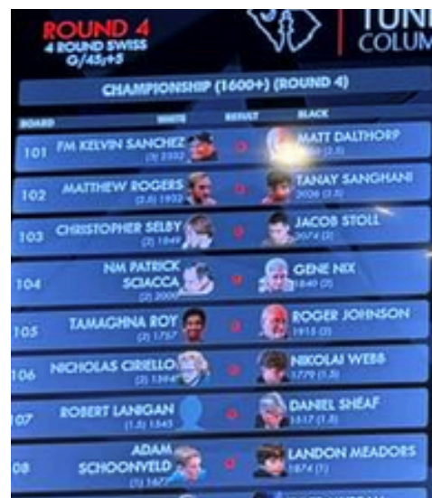
A typical pairing screen at the Columbia Chess Club.