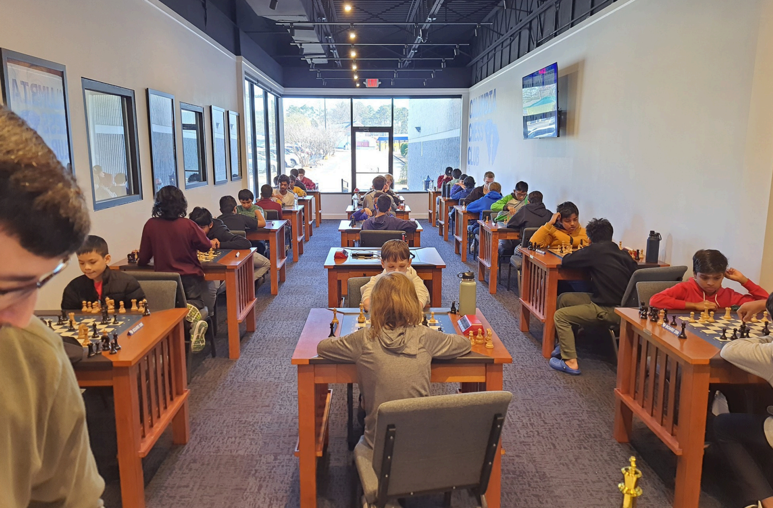
2025 Palmetto Scholastic Chess League