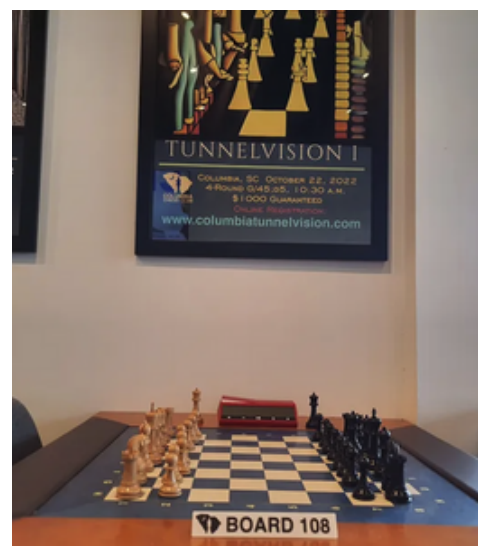
A board in the Columbia Chess Club tournament hall, with board marker.