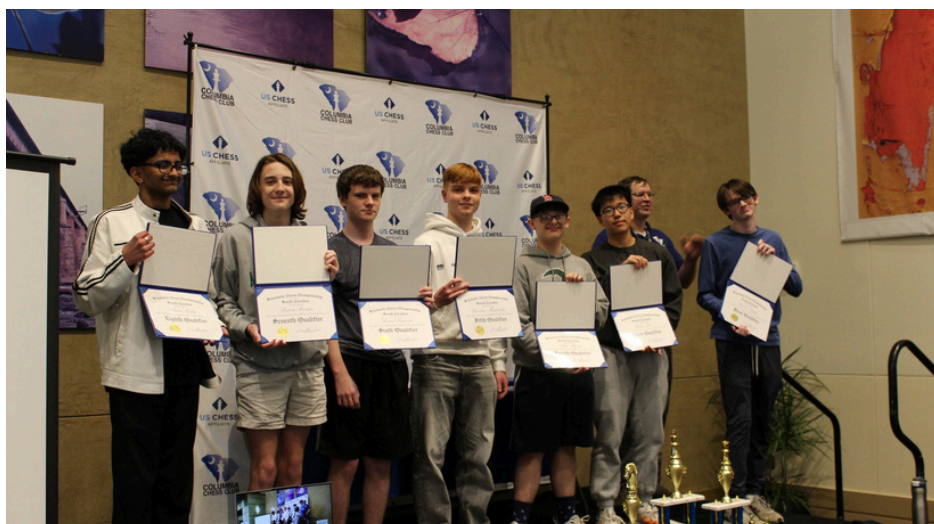
2025 High School Individual Finalists

The South Carolina Scholastic Championship is open to residents of the state or students attending school in the state. Registration is online only, and costs $45 if registered by March 14, 2026, $55 thereafter. Registration closes 8:30 a.m. on March 21, 2026.