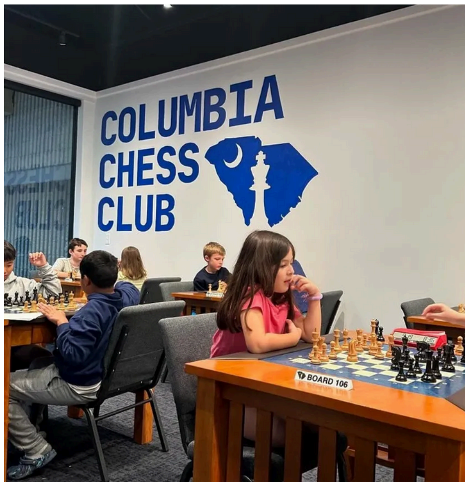
2025 Columbia Chess Club Kid's Night

A youth US Chess membership is required for players in K-12 to participate in rated events. A 1-year youth membership from US Chess costs $24. However, the Columbia Chess Club provides easy ways for youth players to obtain memberships for the first time.