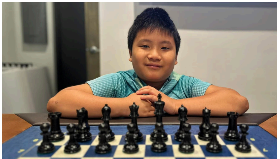
2025 Palmetto Scholastic Chess League

All the details on the official scholastic chess championship for South Carolina.