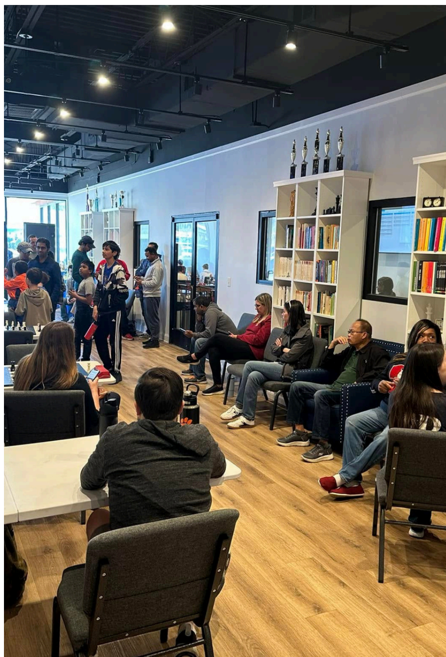
2025 Palmetto Scholastic Chess League

PSCL is a 4-Round Swiss tournament, meaning that players play all four rounds and are not eliminated, and players with the same record are generally paired each round. Each player will play with a 10 minute starting time and will get an additional 5 seconds with each move. (G/10;+5). This will affect the player's US Chess "Quick" rating. PSCL has three sections: High School (9-12), Middle School (6-8), Elementary School (K-5), with prizes awarded separately for each section. The Columbia Chess Club provides all equipment.