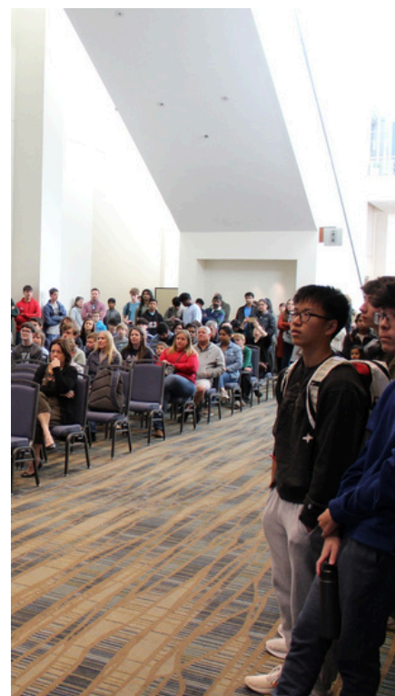
2025 Scholastic Championship, parents and family watch games between rounds