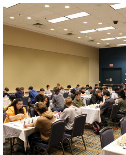
2025 High School Championship