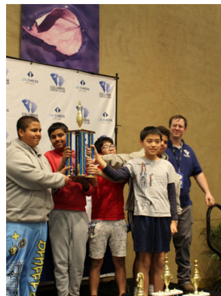
Dutch Fork Middle School, 2025 Middle School Champions

The the first place finisher in each section at the State Finals is awarded an invitation and a stipend to compete as the South Carolina representative to the following national tournaments hosted at the US Open Championship during August 3-9, 2026 in Grand Rapids, Michigan. ($5000 Scholarship Top Prizes): Denker National Tournament of High School State Champions; Barber National Tournament of Middle School State Champions; Rockefeller National Tournament of Elementary School State Champions.