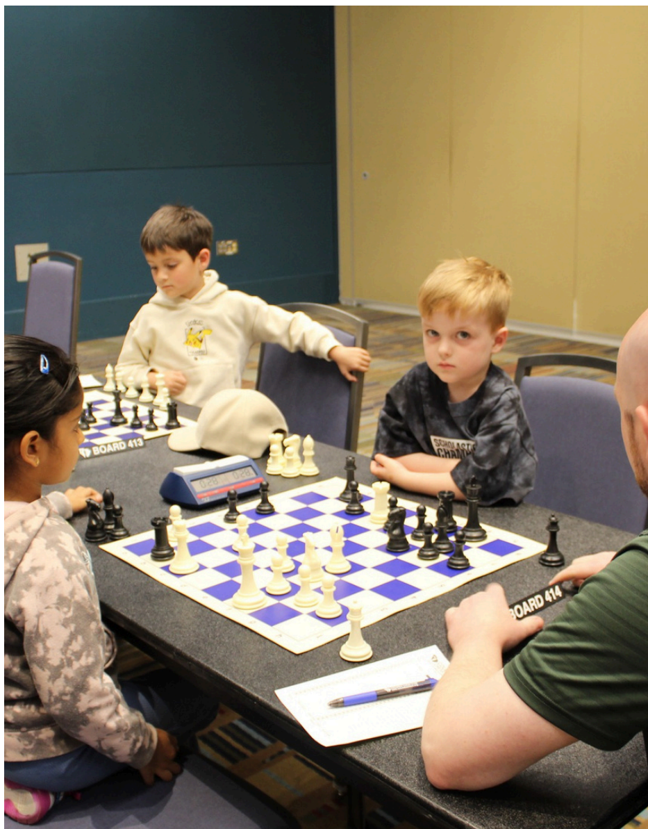
2025 K-3 Championship