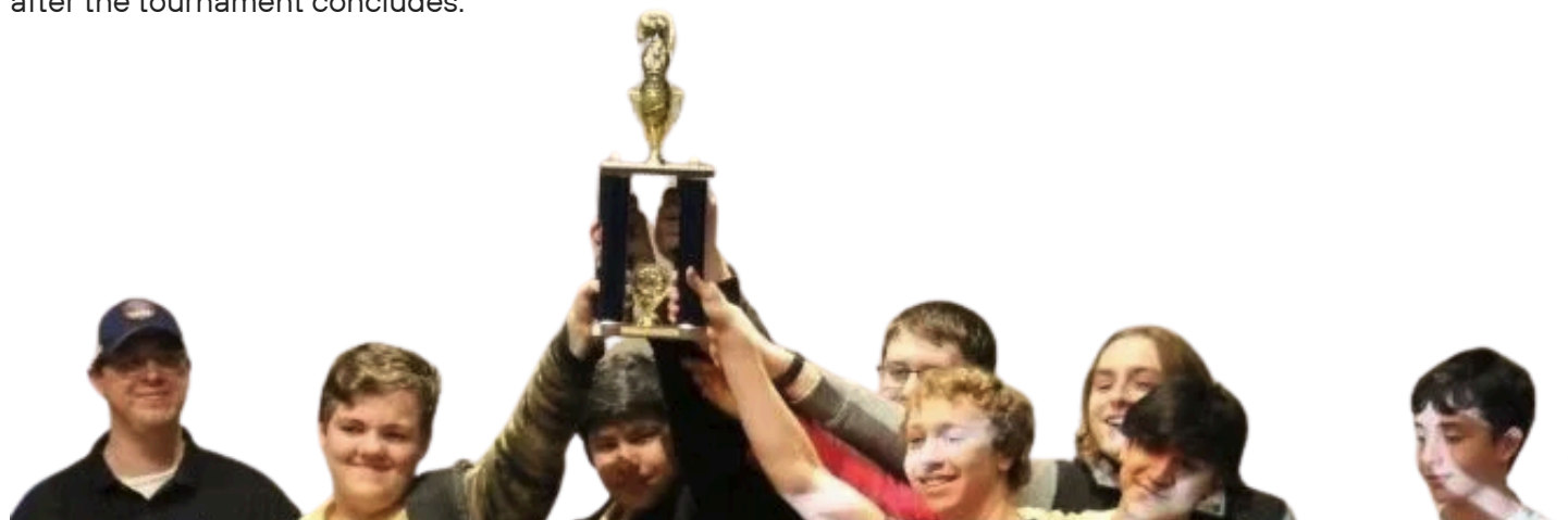
2024 SC Scholastic Chess Championship, Russell House, University of South Carolina

The Columbia Chess Club prides itself on submitting its tournaments to the USCF quickly, and ordinarily ratings will be updated the night of the tournament. Simply search your name in the US Chess database the evening after the tournament concludes.