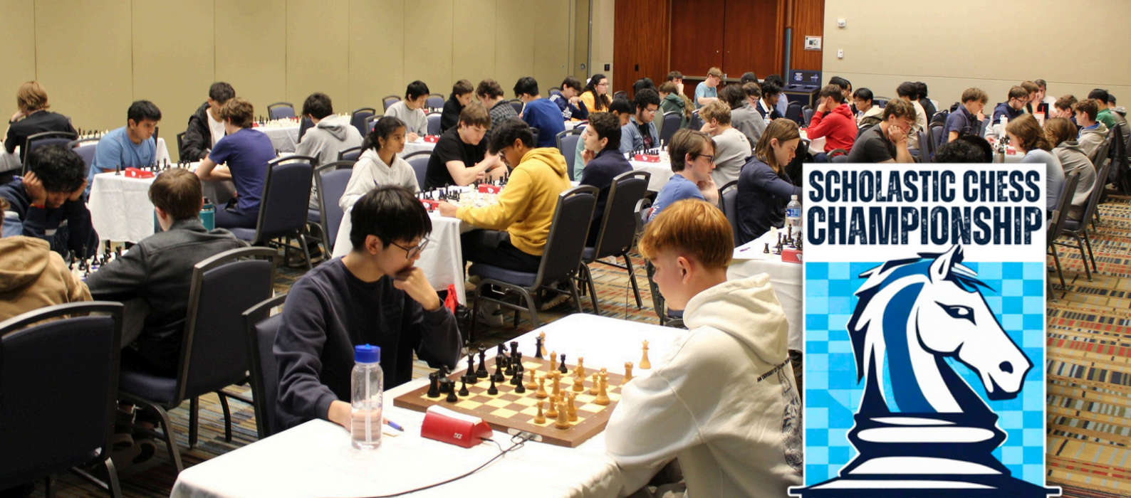
2025 Scholastic Championship, High School Section