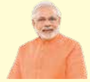
Shri Narendra Modi Hon. Prime Minister

Department of Financial Services Ministry of Finance Government of India www.financialservices.gov.in