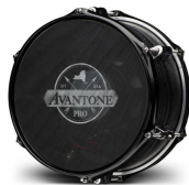
AVATONE PRO AV-Kick Pro Sub-Frequency