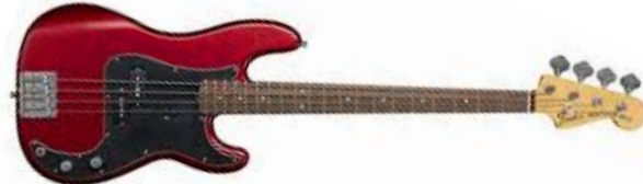
Fender MIK Deluxe Jazz Bass Active