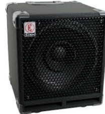
Eden TN210-4 Bass Cabinet