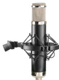
Vanguard Audio Labs V13 Pair