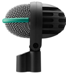
ASTON Stealth Active Dynamic