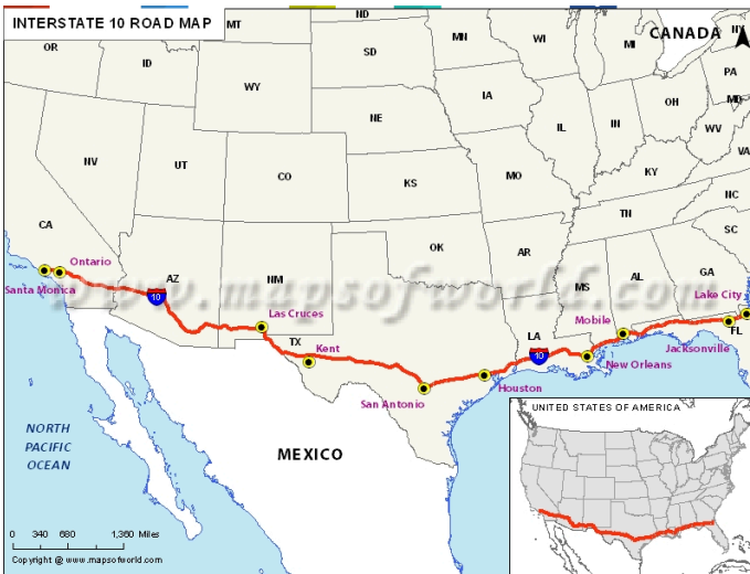
Description : Map depicts US Interstate 10 (I-10) route from Santa Monica, California to Jacksonville, Florida. Disclaimer