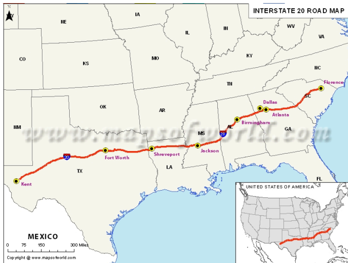
Description : The Map depicts US Interstate 20 (I-20) route from Kent, Texas to Florence, South Carolina. Disclaimer