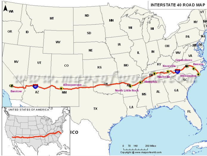
Description : The Map depicts US Interstate 40 (I-40) route from Barstow, California to Wilmington, North Carolina. Disclaimer