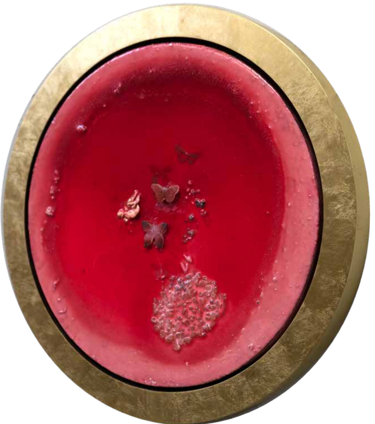
Rosewater 27 in framed Giusto Manetti 24k Gold Leaf