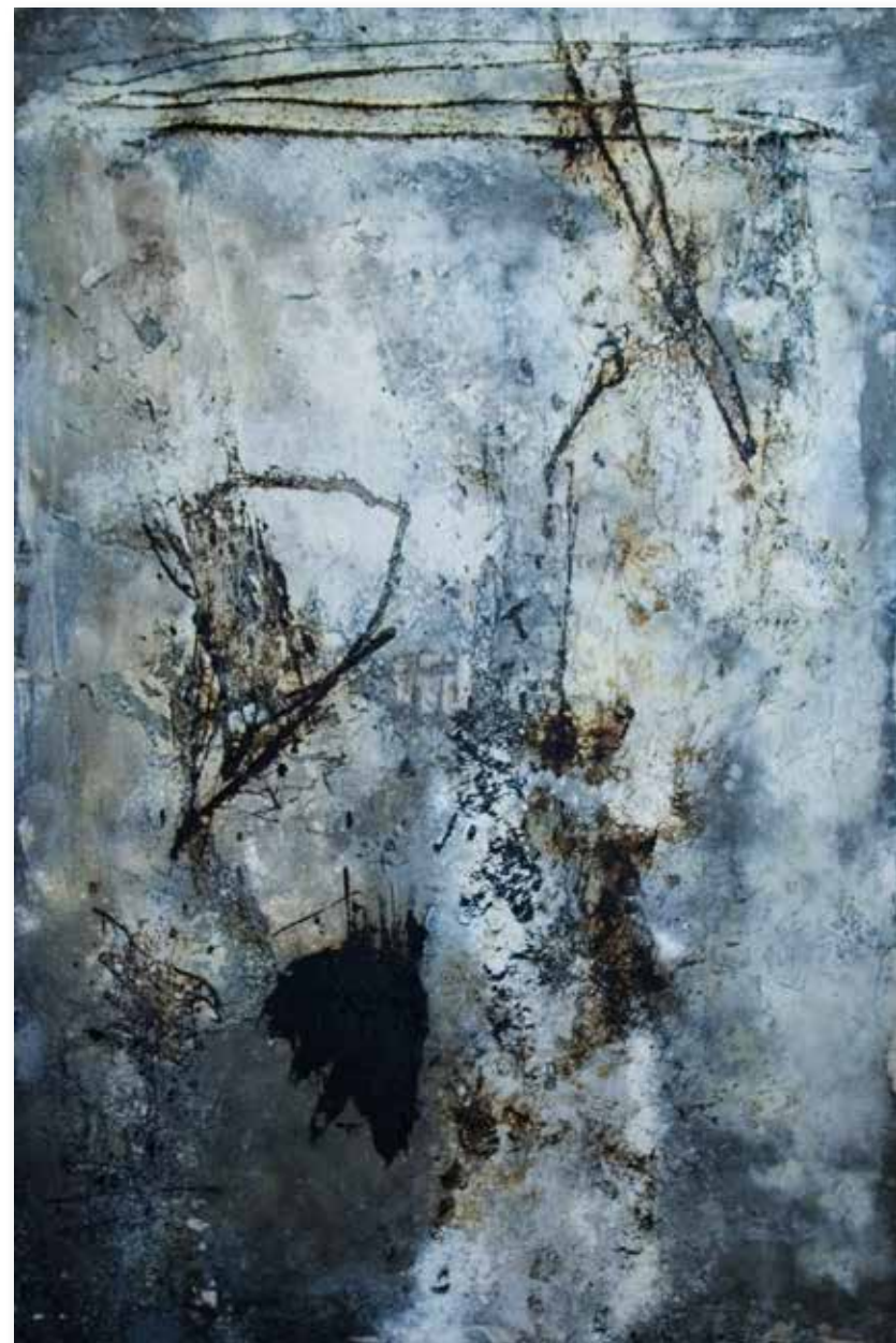
SAWYER EFFECT 120X80 INCHES | 304X203 CM