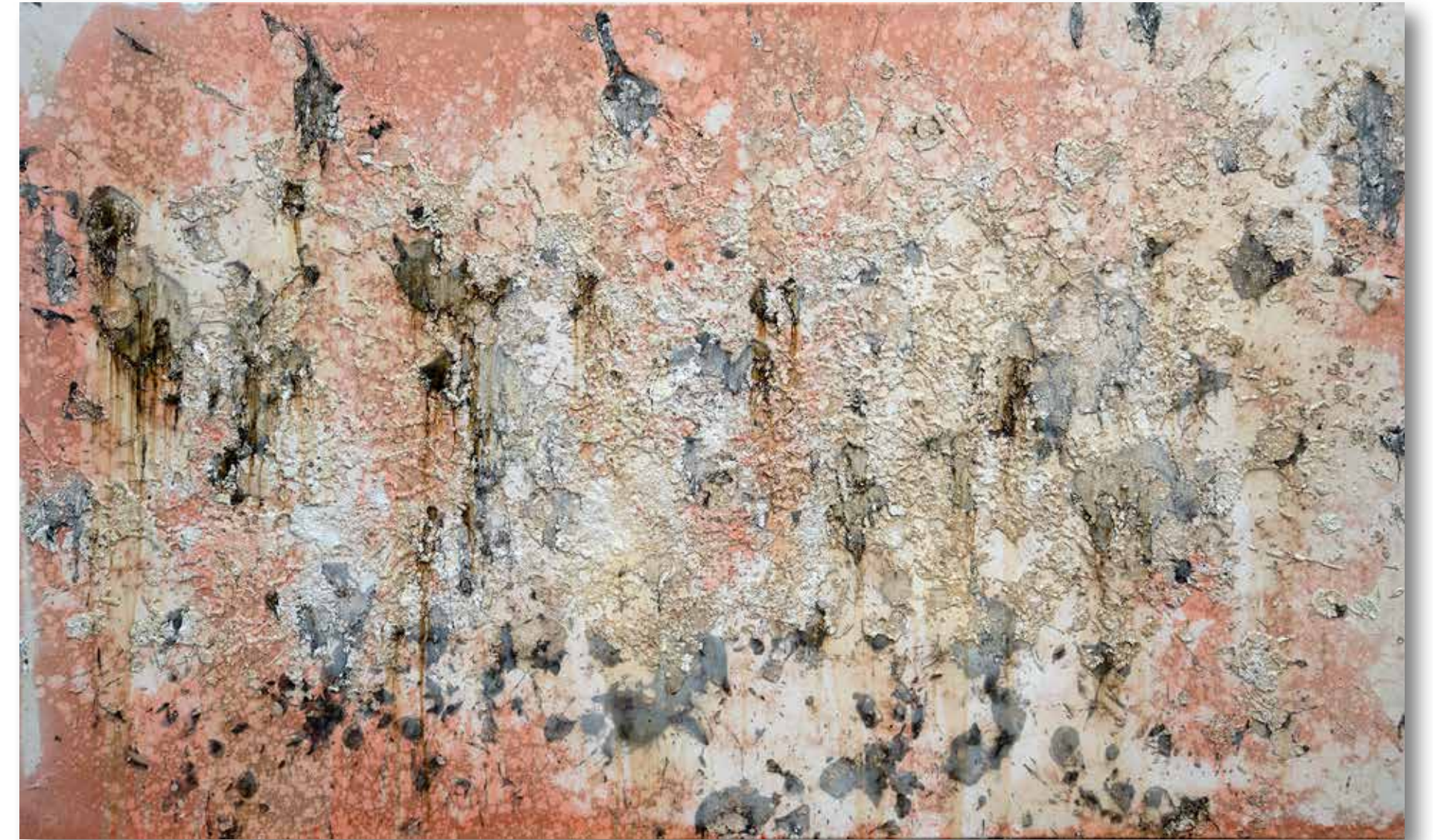
THE TAGLINE OF COURAGE 46X76 IN | 116X193 CM