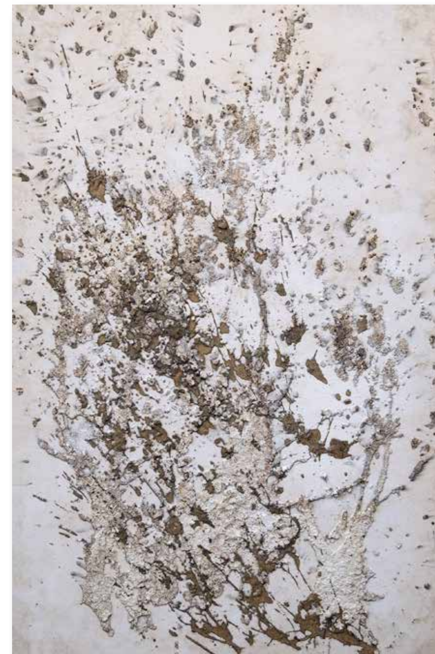
Le Graine de la Liberte 58x38 inches each