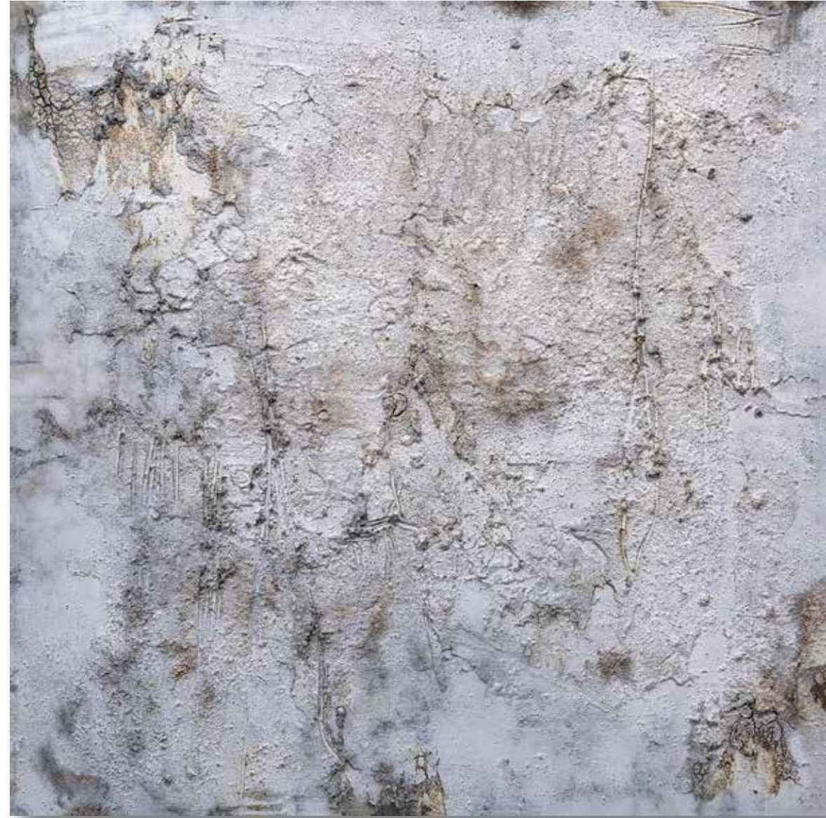
Code of Hammurabi 50x50 in