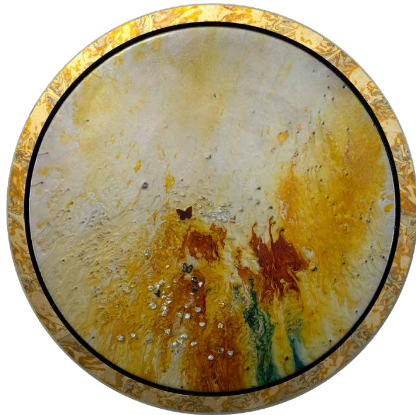
Golden Butterfly 32 in | 81 cm