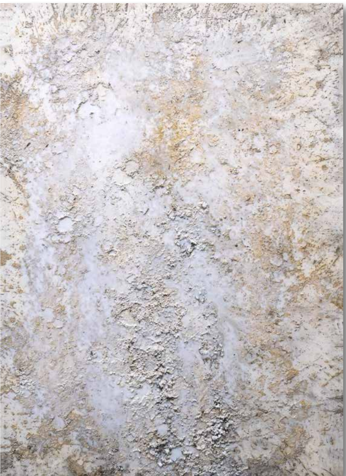
Plato's Light Part I 76x54 in