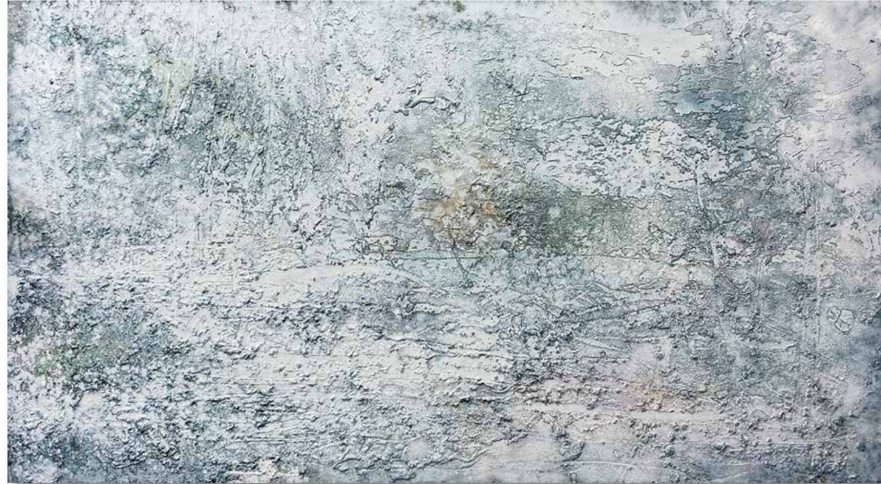
PALMYRA 90X50 IN