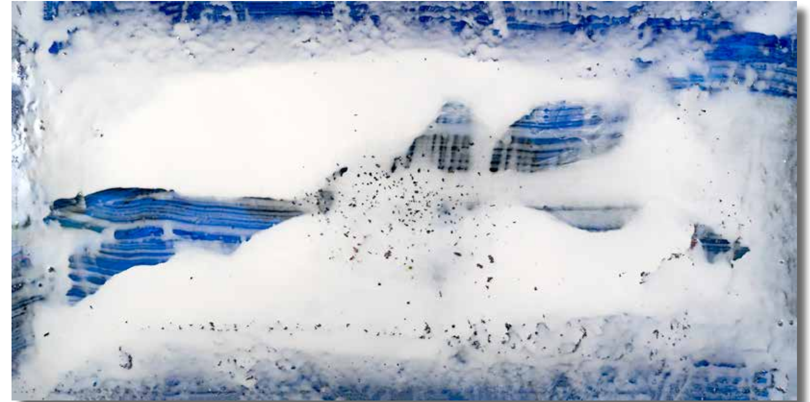
OUR CACoon OF LIFE 48X72 INCHES