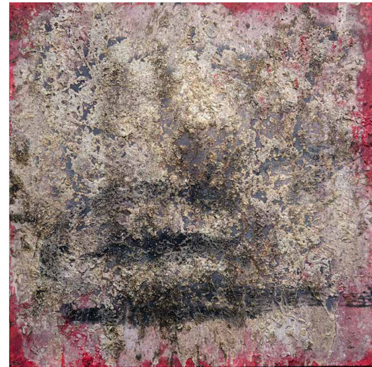
THE YEAR OF THE TIGER 60X60 IN