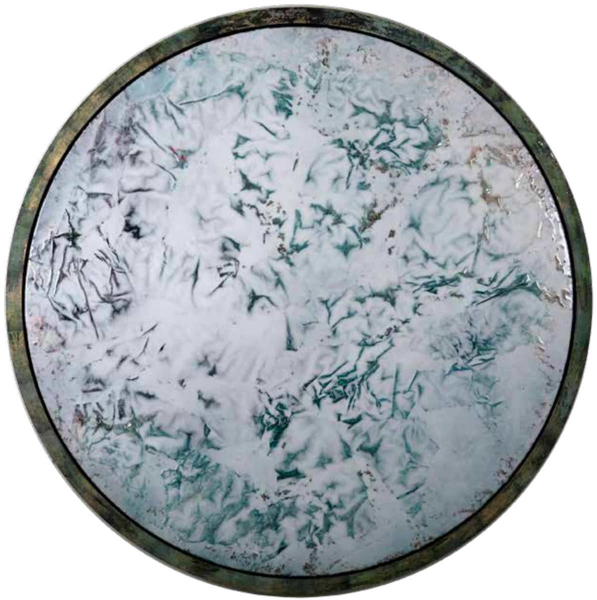
Juniper 55 in | 139 cm