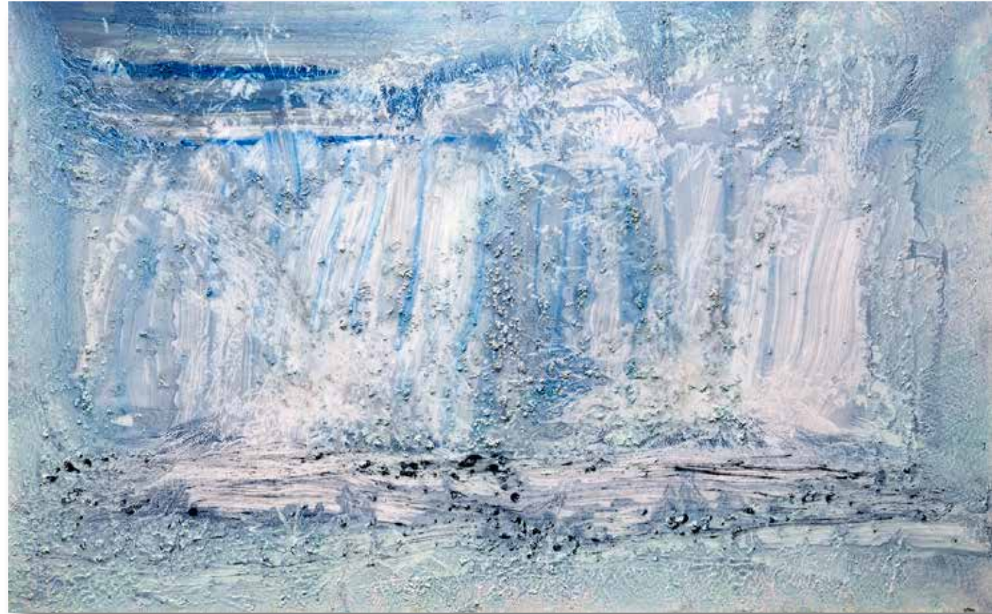
THE ANCIENT MARINER 50X80 INCHES EACH