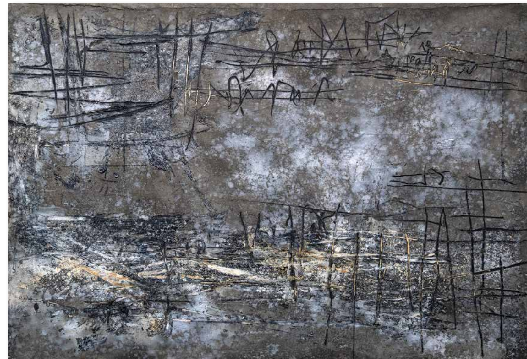
The Unsolvable Equation 70x100 in | 177x254 cm