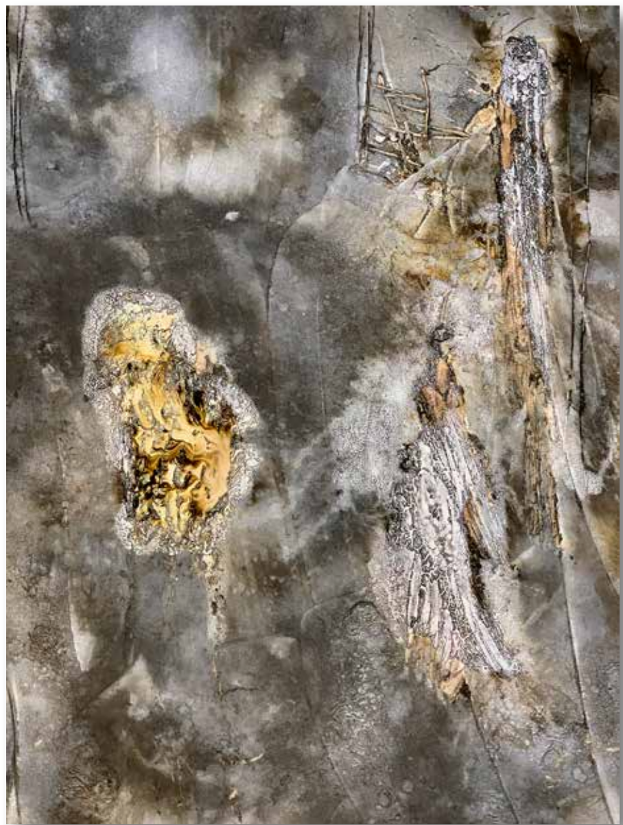
Semper ad Melior-8 88x66 in | 223x167 cm