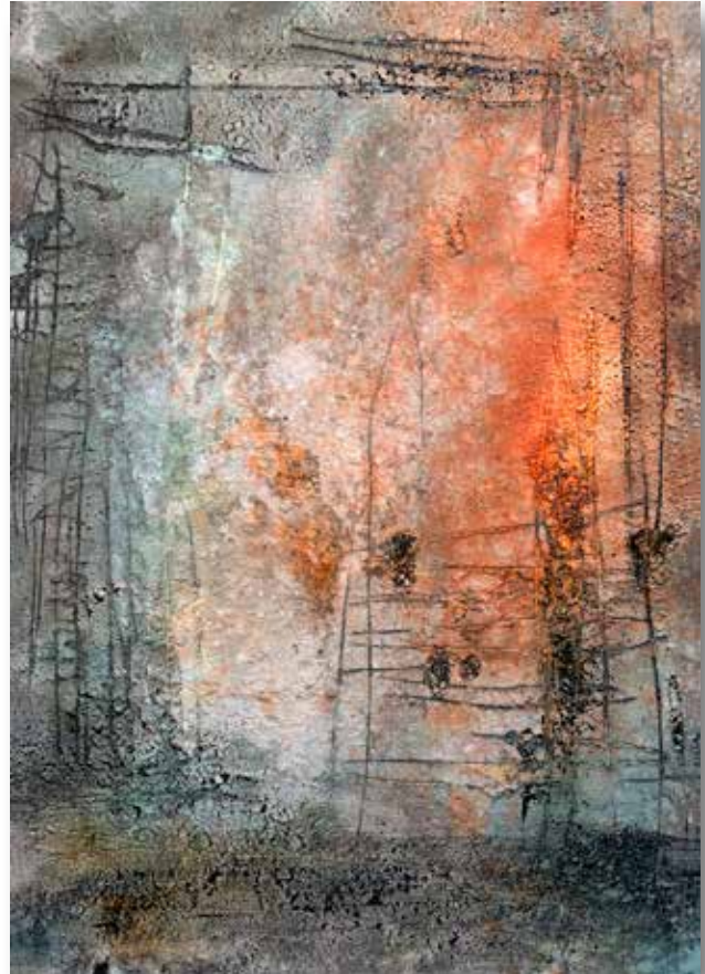
ACT A NON VERBA PART I & II 60X42 INCHES | 152x106 CM