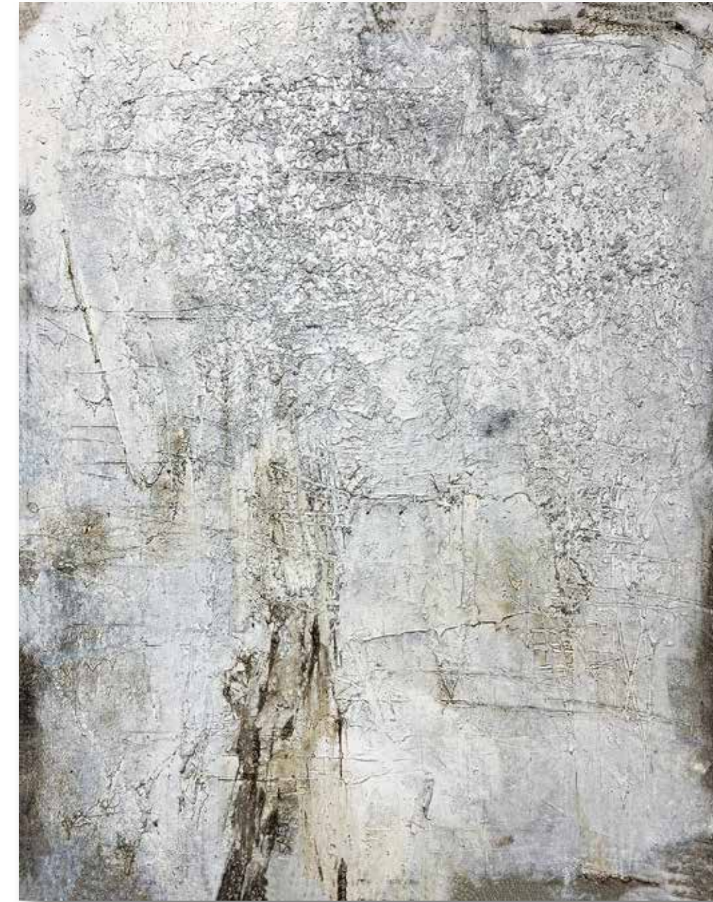
COMPASSIONS OF SIMPLICIUS 100X80 INCHES