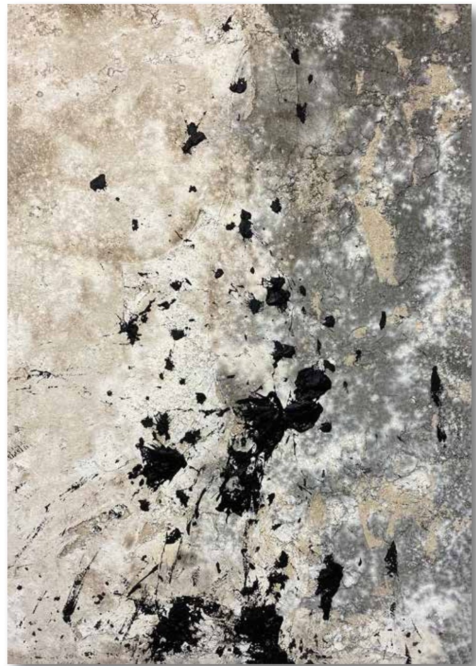
Serapeum of Alexandria 100x70 inches