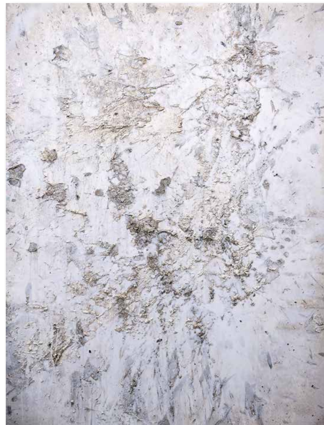
ALL I SEE IS LIGHT 88X66 IN