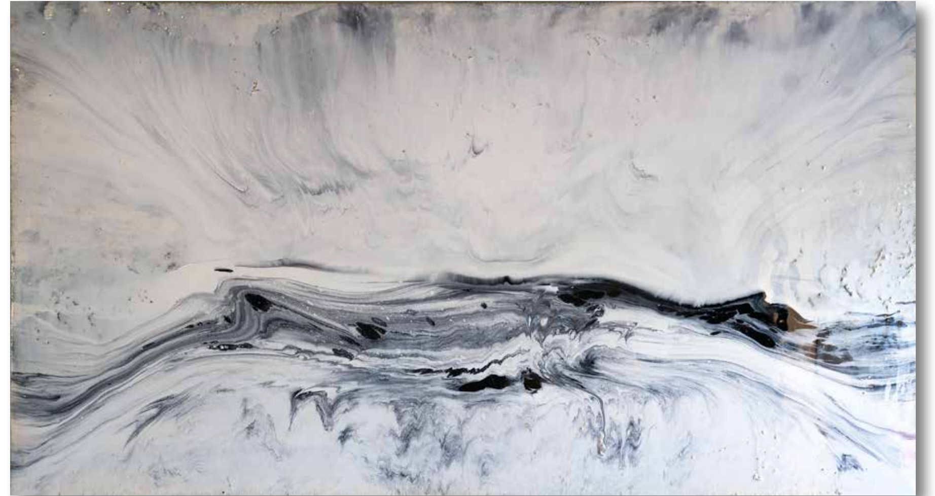
Magical Enchantment 46x76 inches