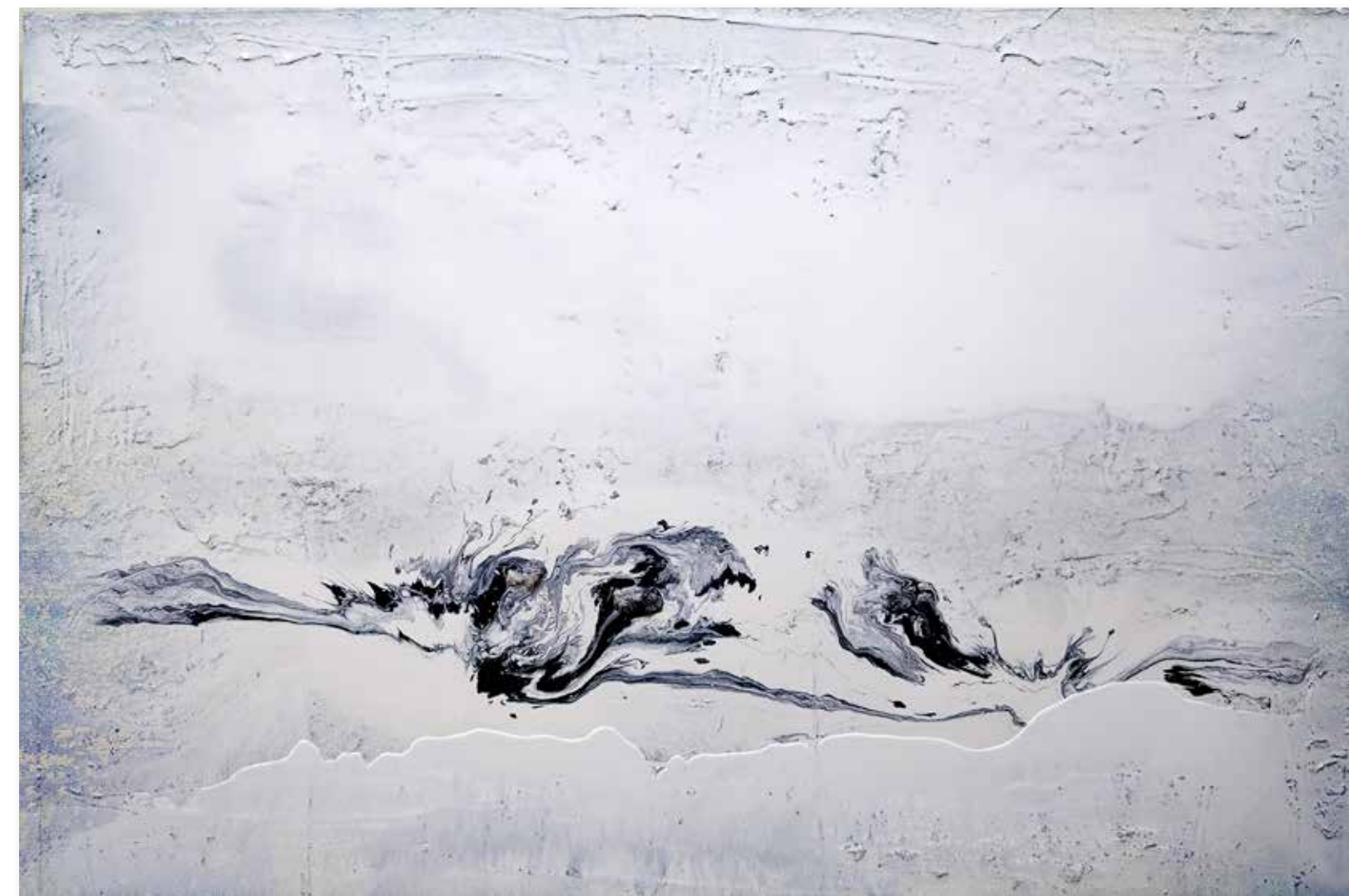
NOTION OF AN IDEAL STATE 60X90 IN | 152X228 CM