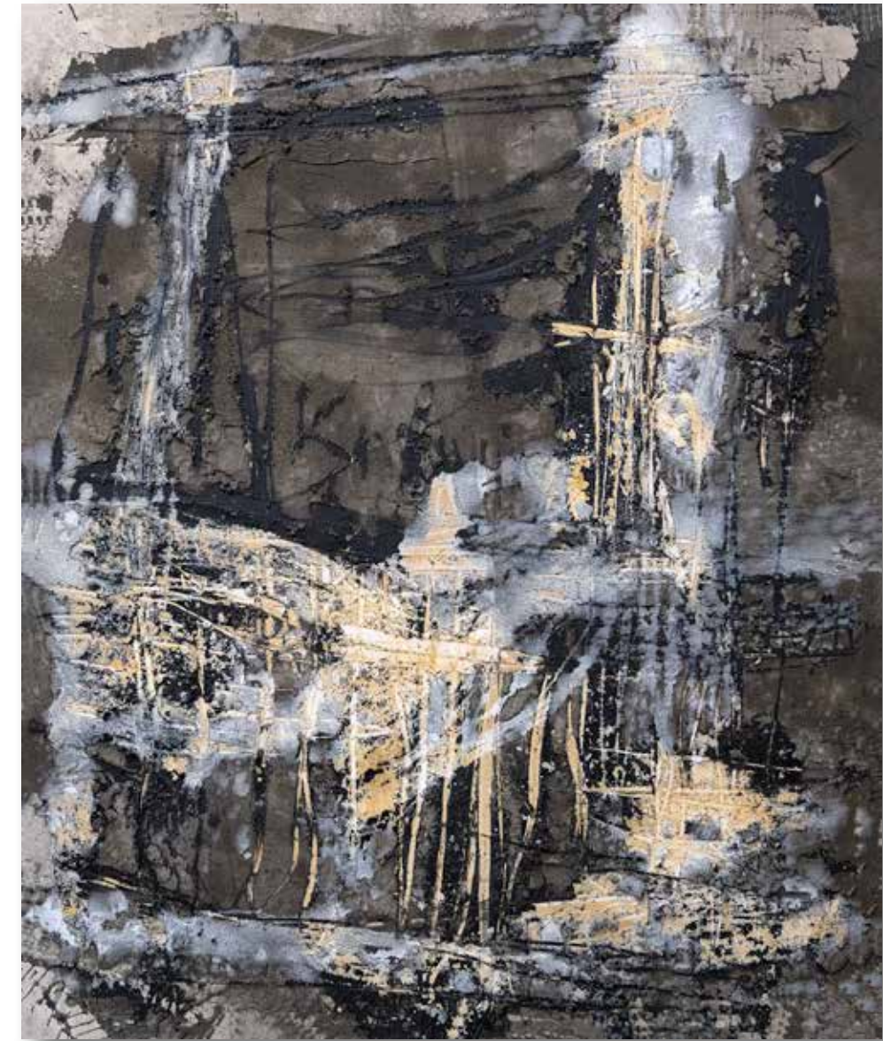
Urizen 66x55 in | 106x90 cm