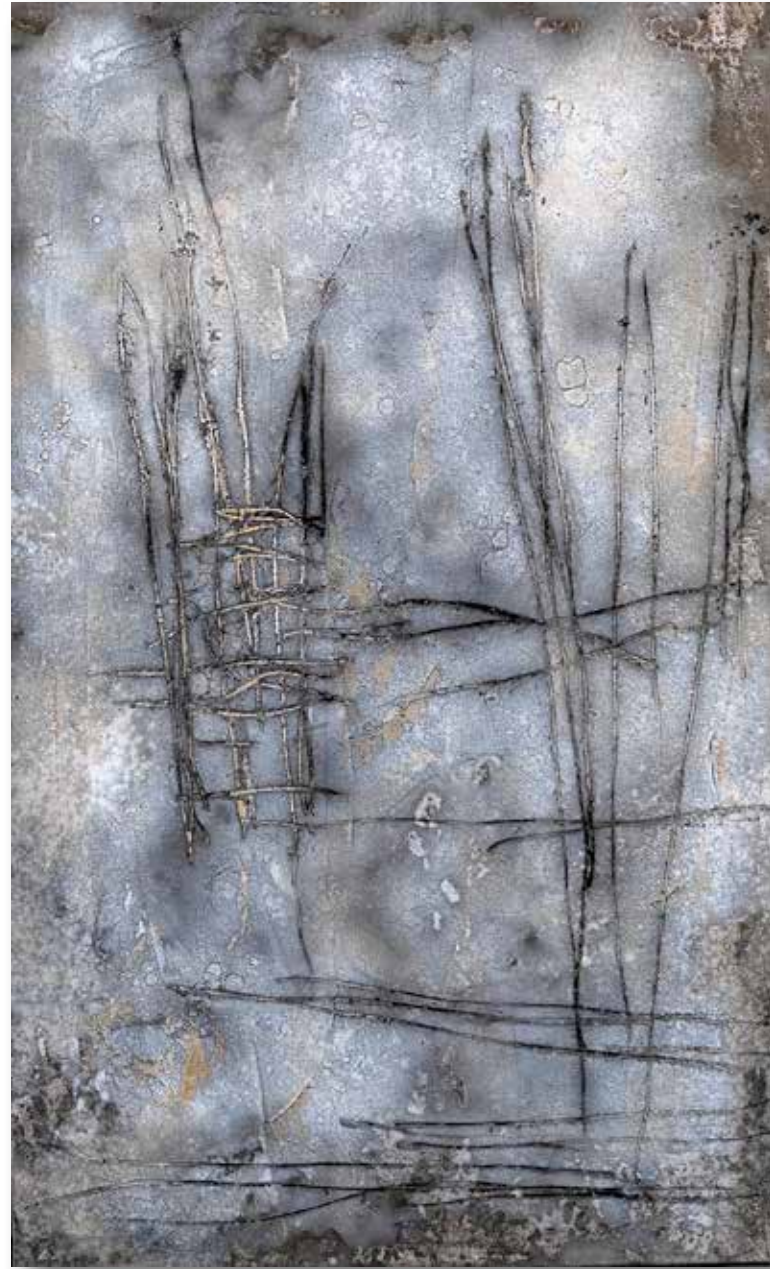
LINEAR FUNCTIONS 76X46 IN | 193X116 CM