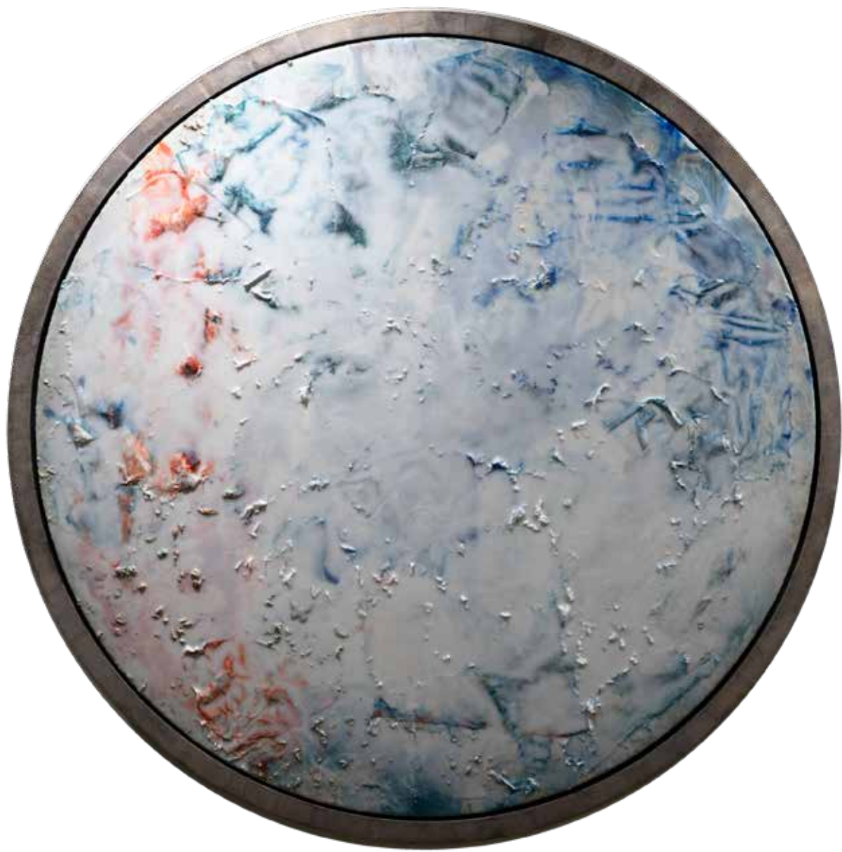
Primrose and Periwinkle 55 in | 139 cm