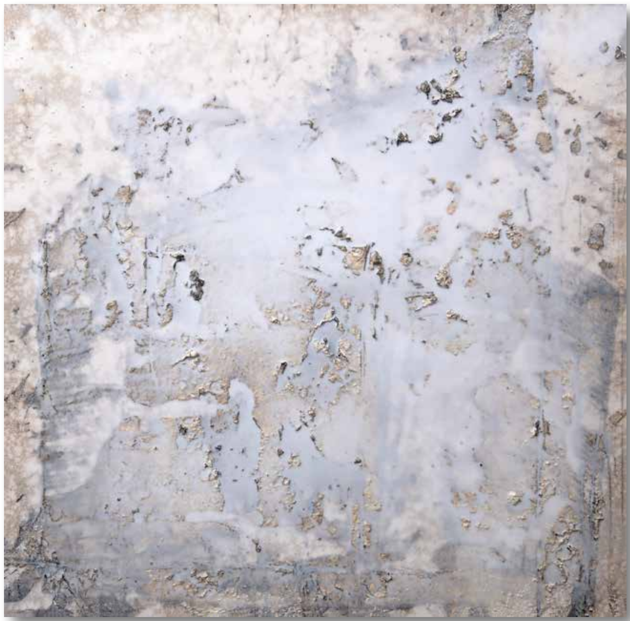
Preserved in Stone 46x46 in