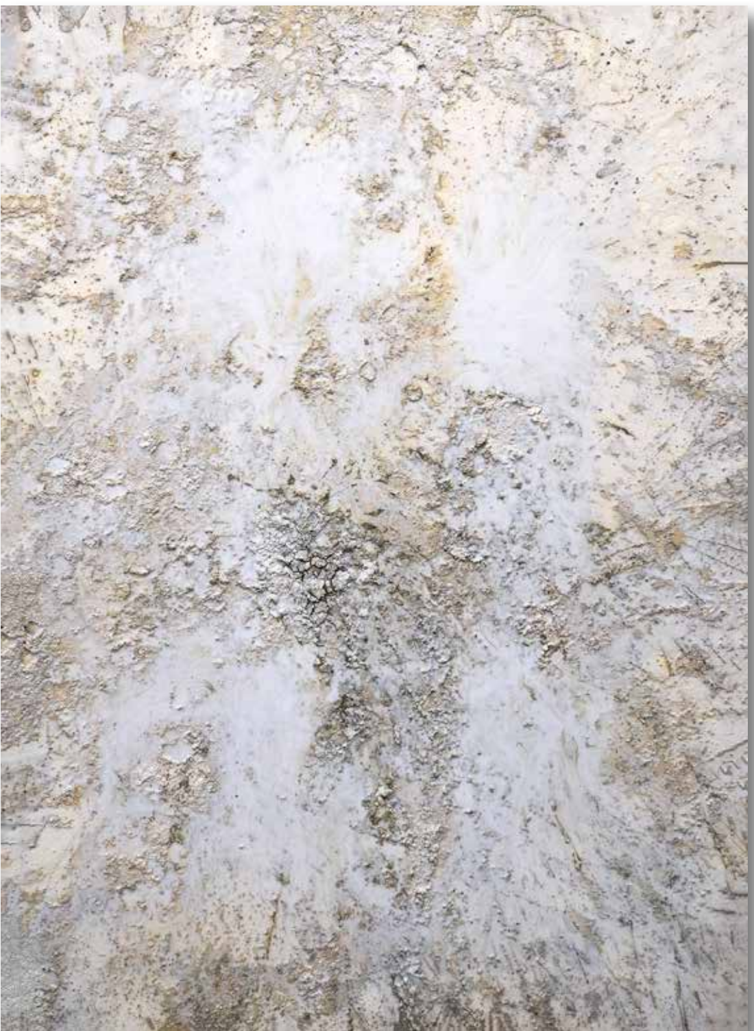
Plato's Light Part II 76x54 in