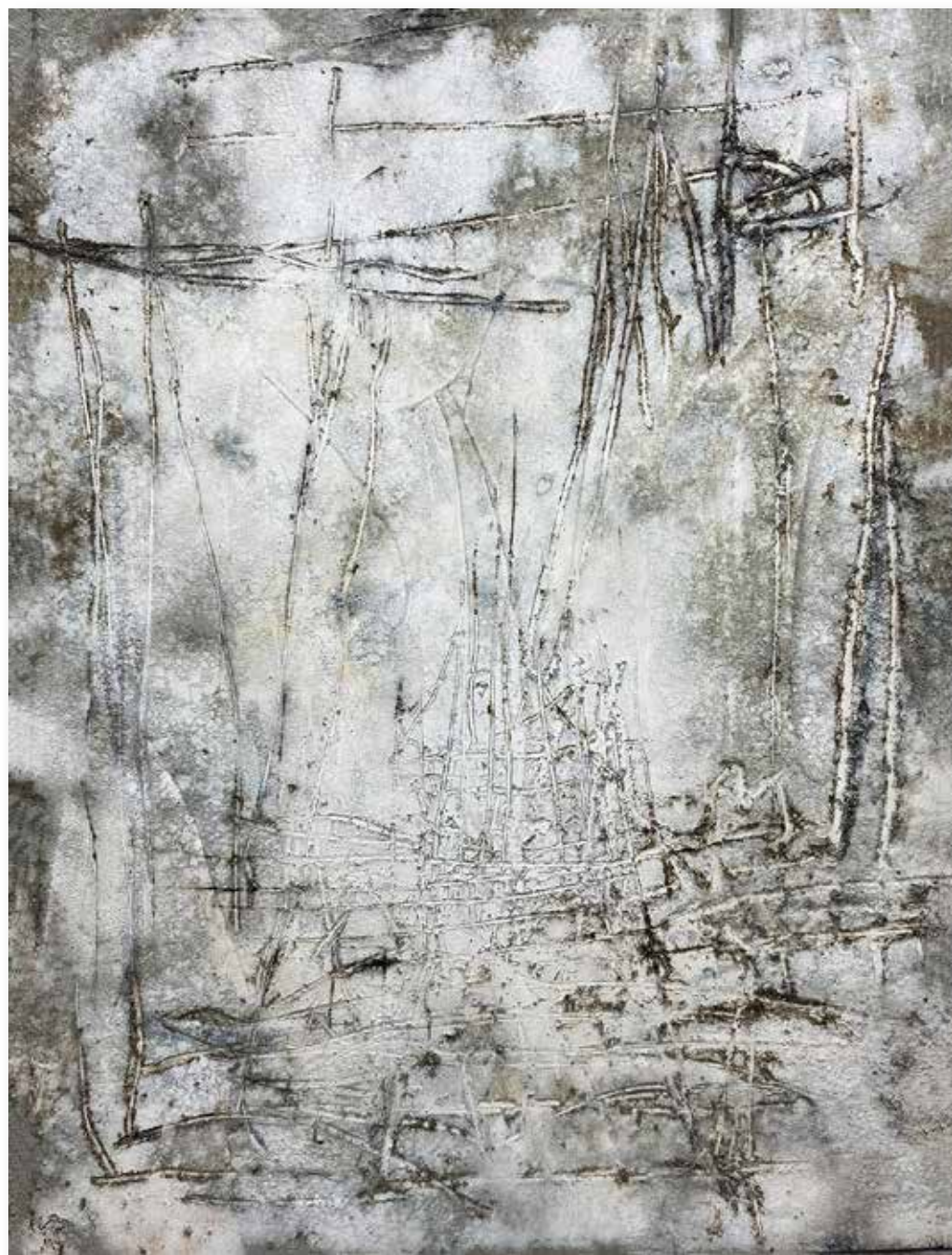
THE RIEMANN HYPOTHESIS 88X66 IN | 223X167 CM