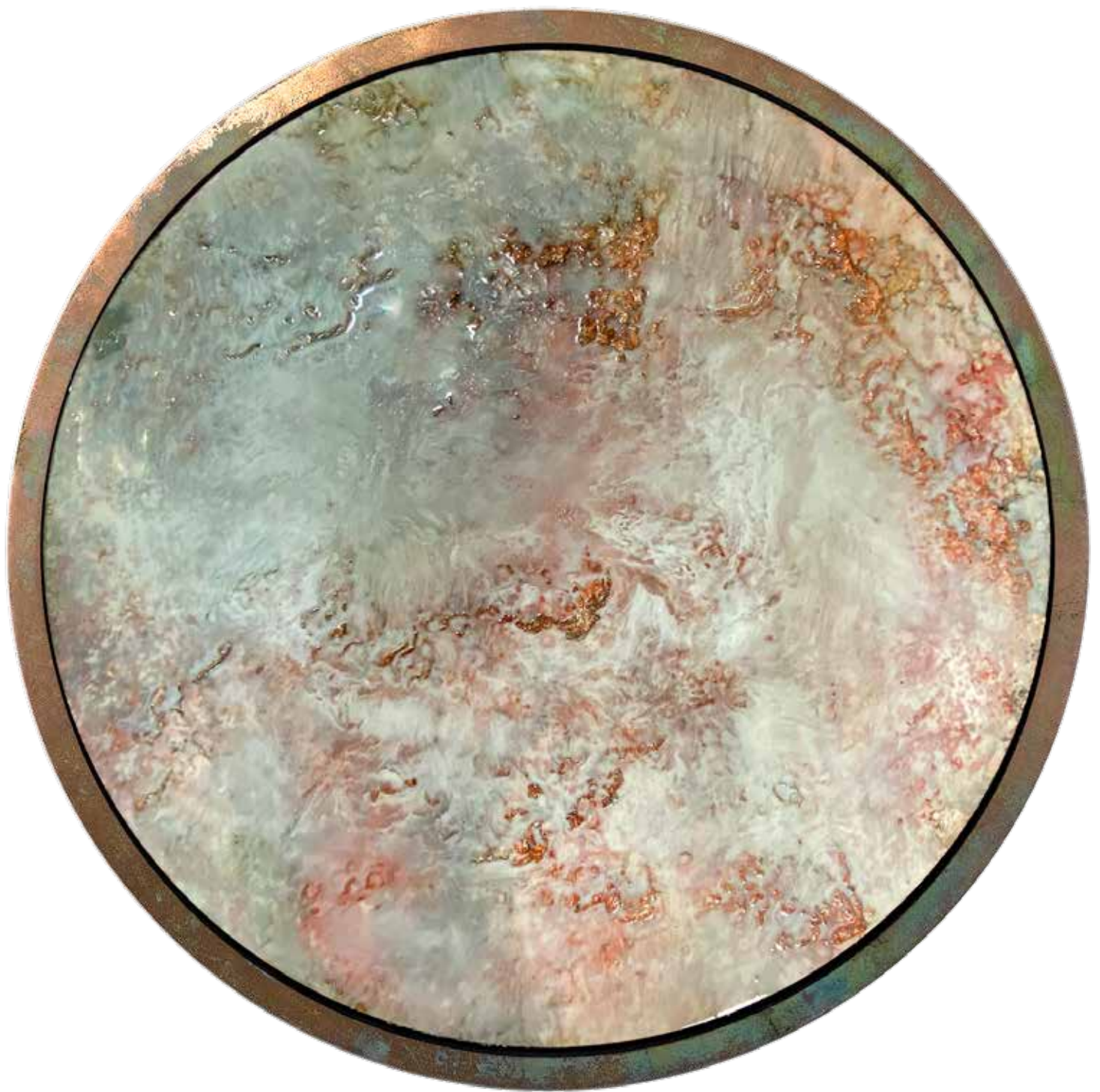
Shugi Tablet 42 in | 106 cm