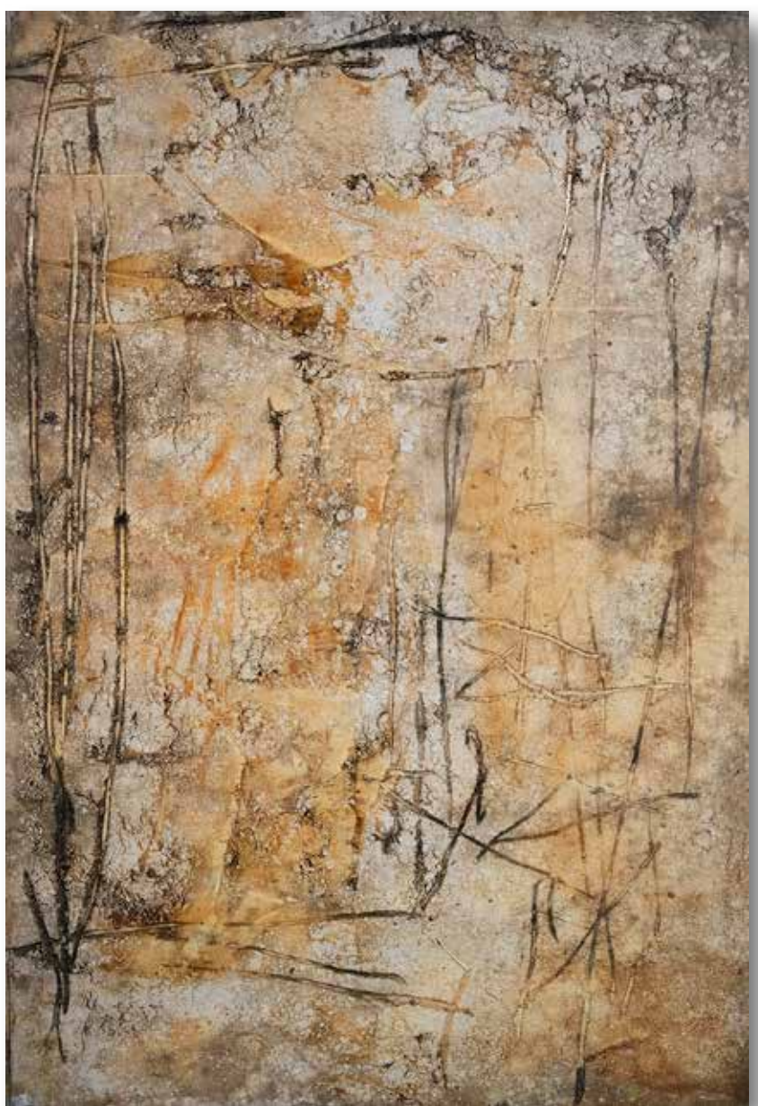
The Golden Arrow 90x60 inches