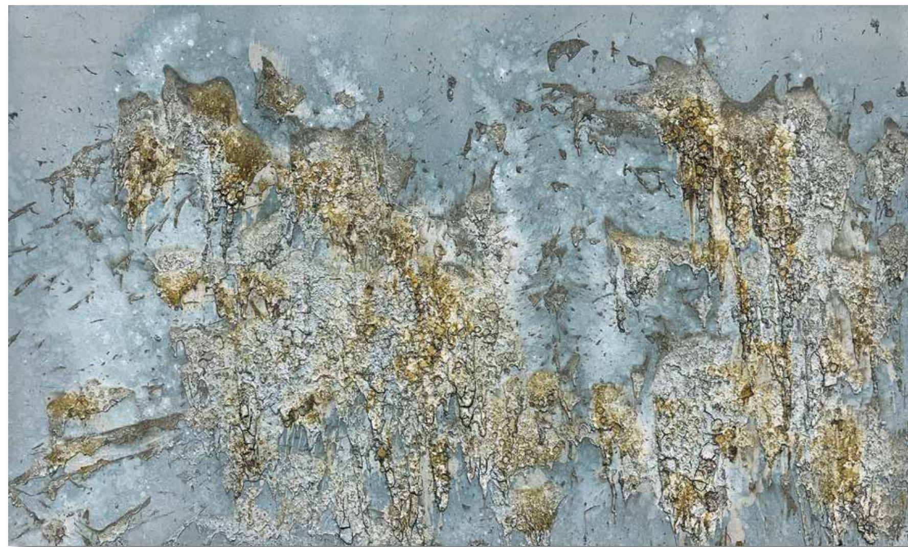
METAMORPHOSES OF OVID 46X76 INCHES