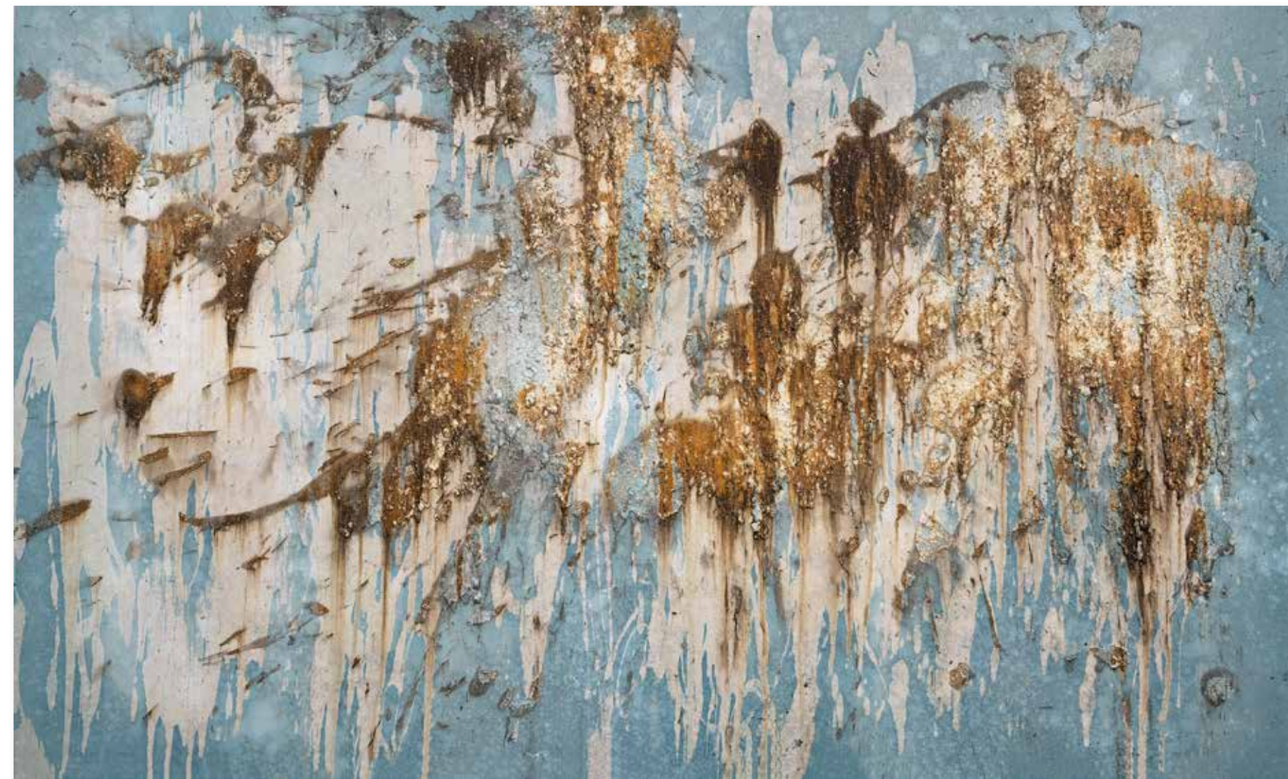
THE THERIACA HEXAMETER 46X76 INCHES