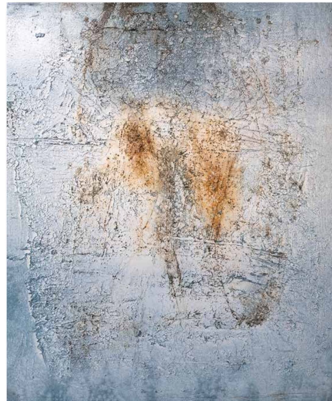
ALADIN 72X60 INCHES