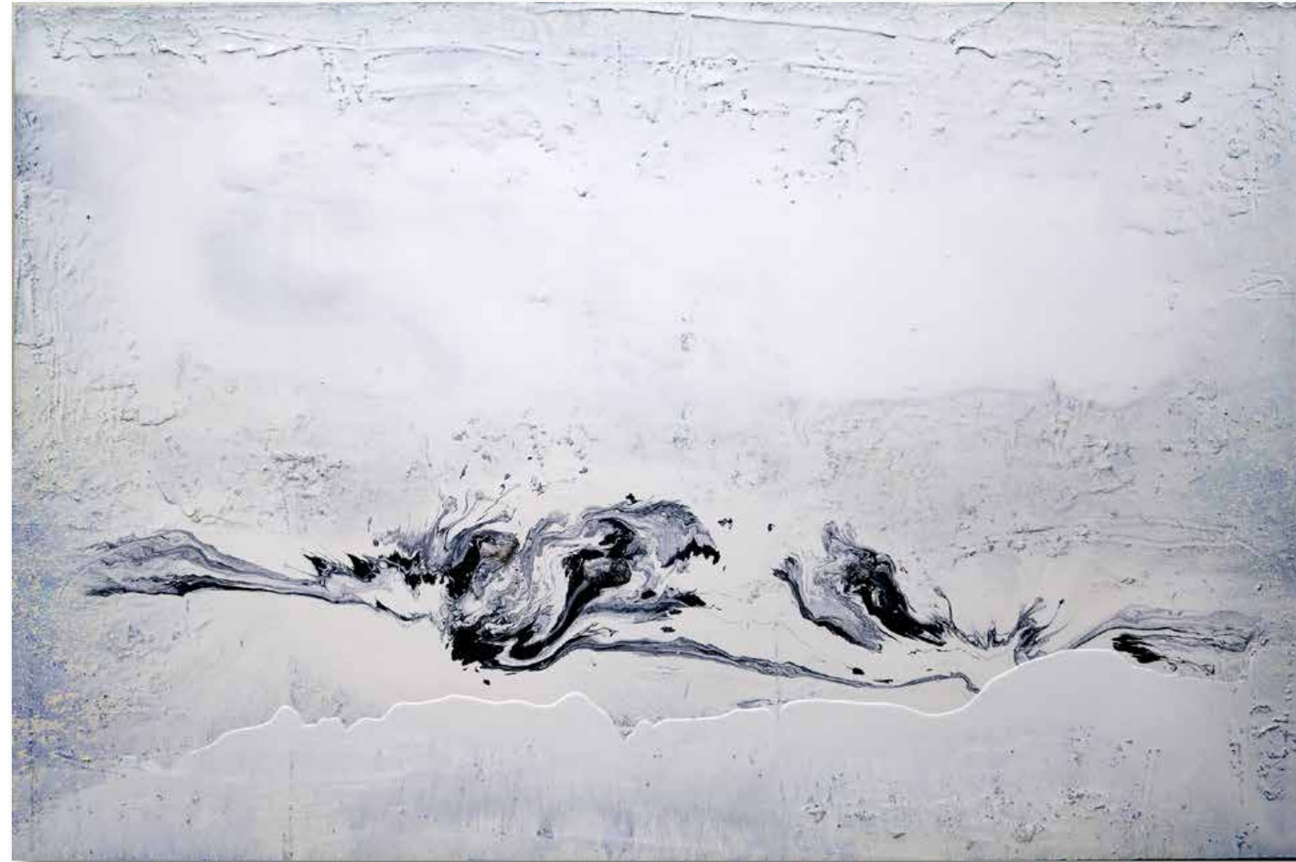
The Notion of an Ideal State 60x90 inches