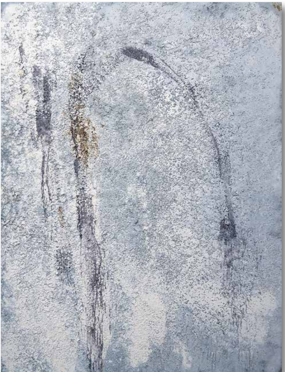
Love Light 88x66 in