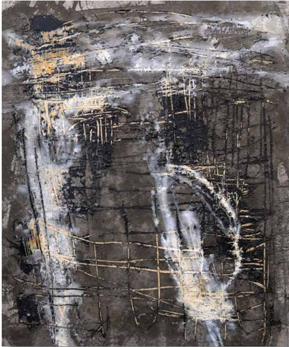
Tirien 66x55 in | 106x90 cm