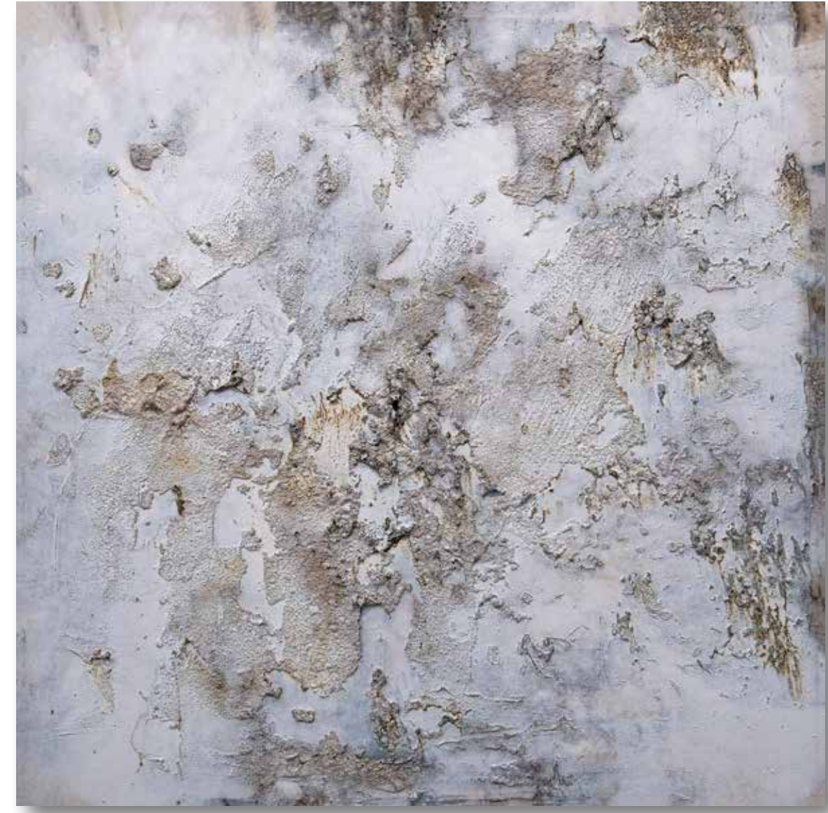
Tbilisi 50x50 in