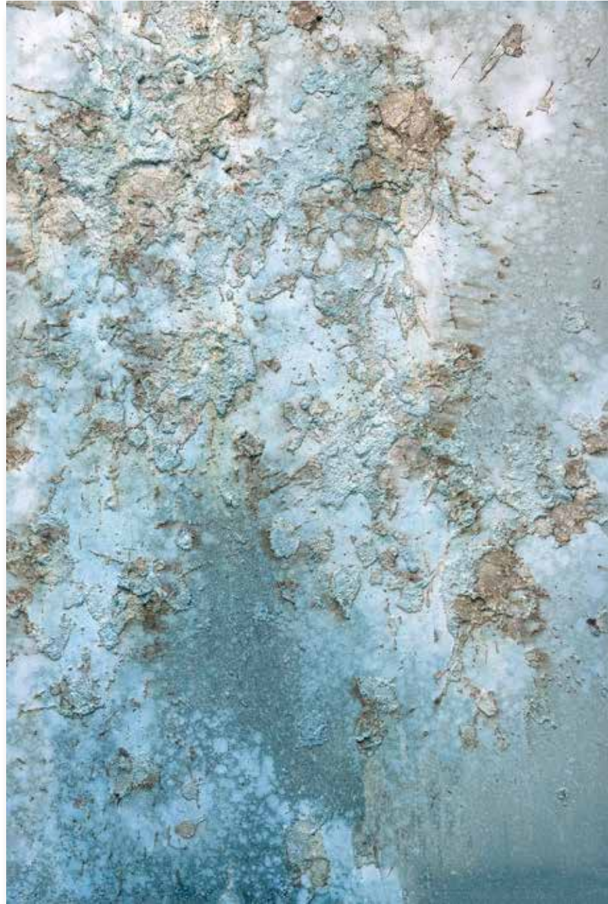
Age Quod Agi 58x38 inches