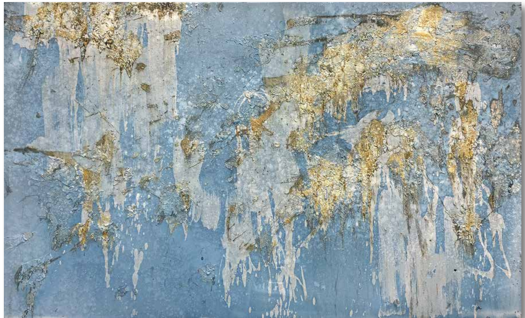
TALES FROM THE SILK ROAD 46X76 IN | 116X193 CM