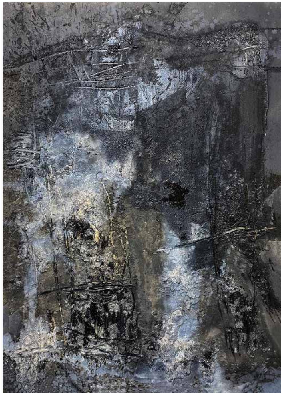
Resilience 76x54 in