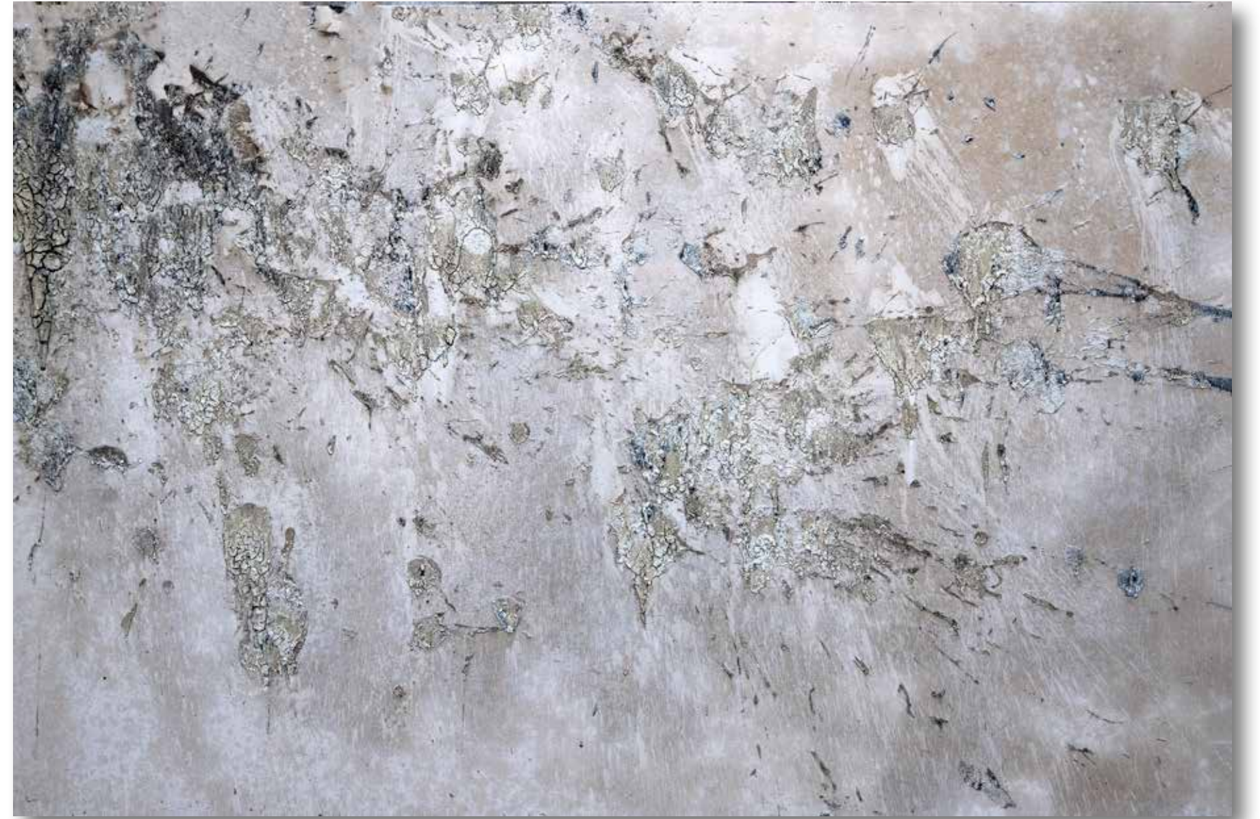
NEWTONS LAW 60X90 IN