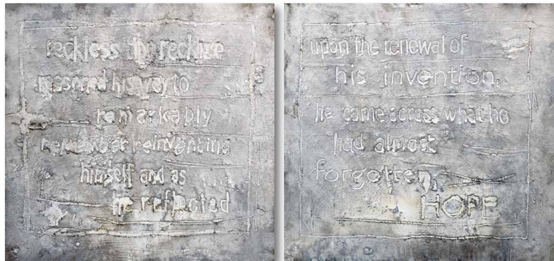
RECKLESS THE RECLUSE 76X72 INCHES EACH