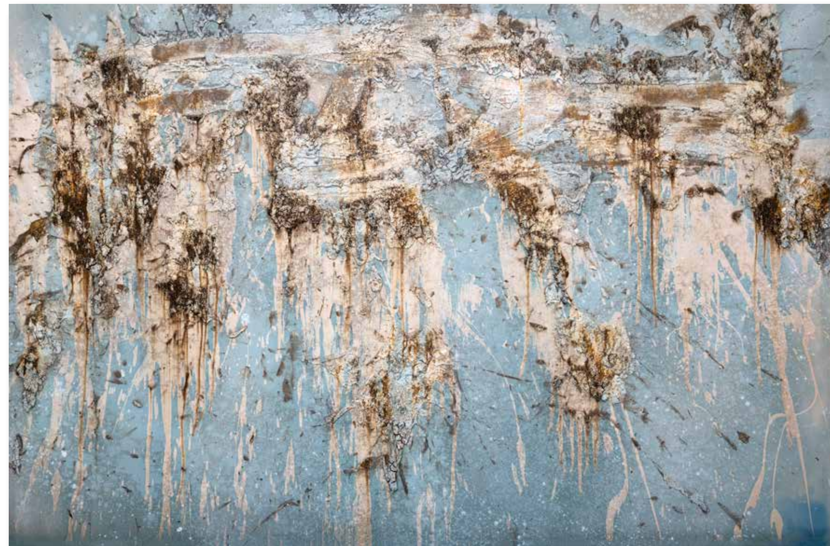
The Renaissance of humanism 60x90 inches