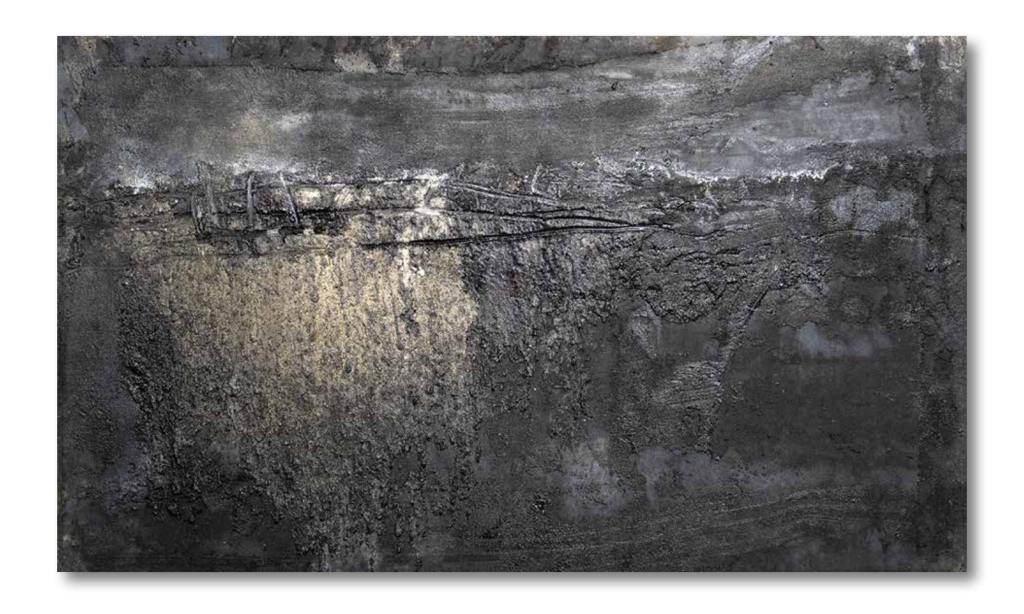
Just Across the River 36x60 in