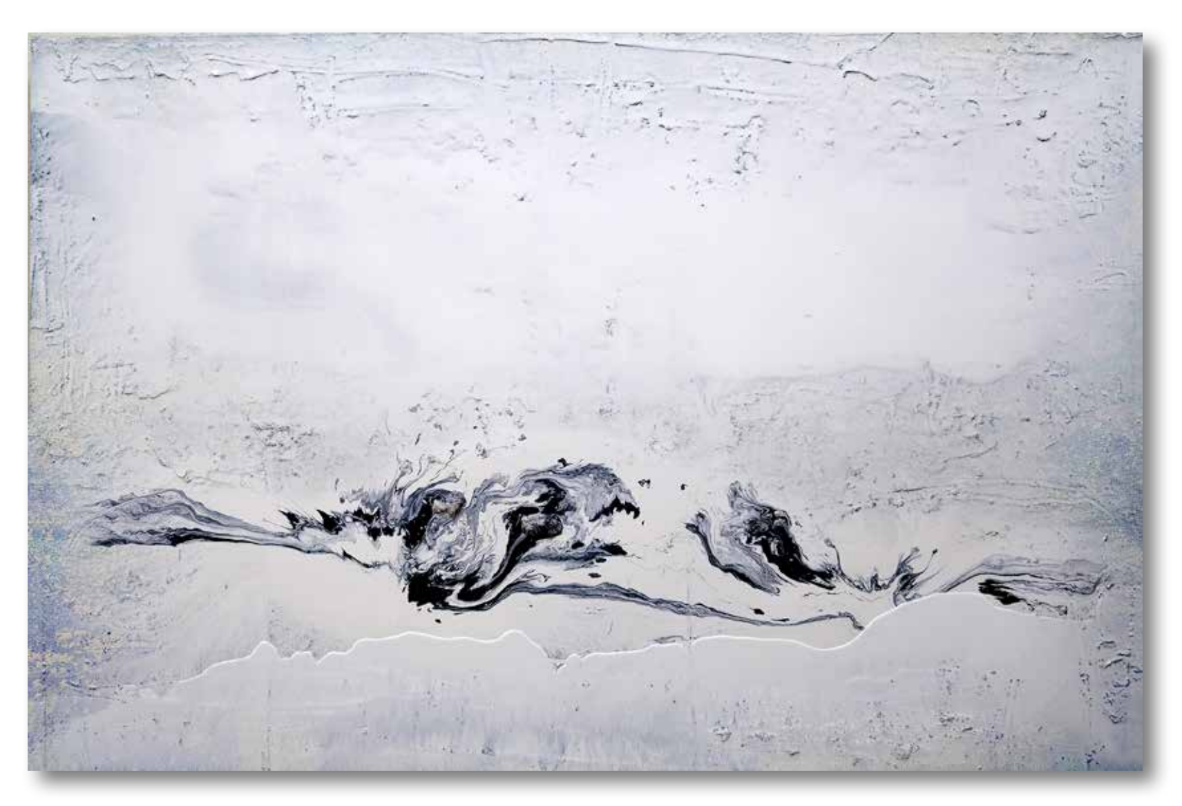
Notion of an Ideal State 60x90 in | 152x228 cm