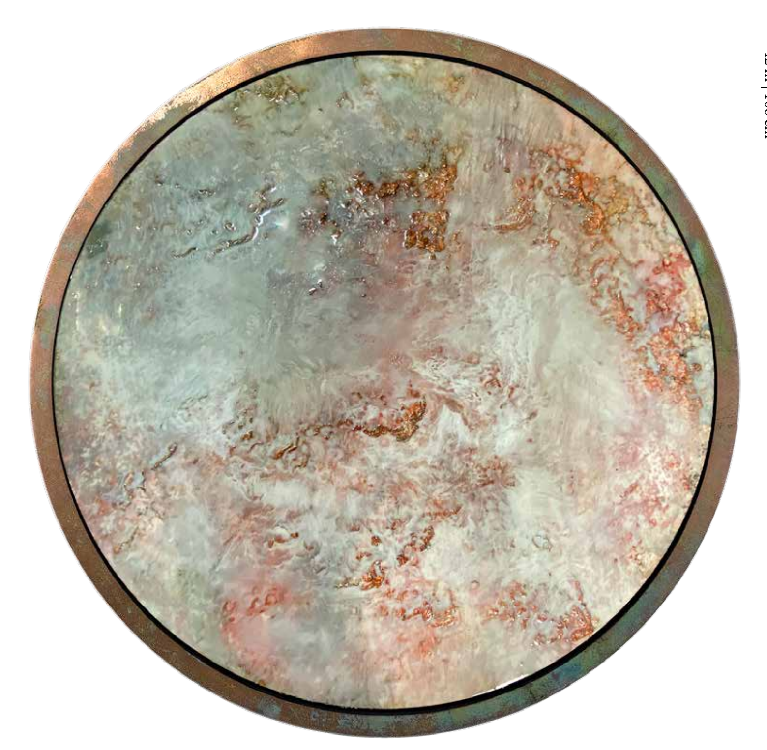
Shugi Tablet 42 in | 106 cm