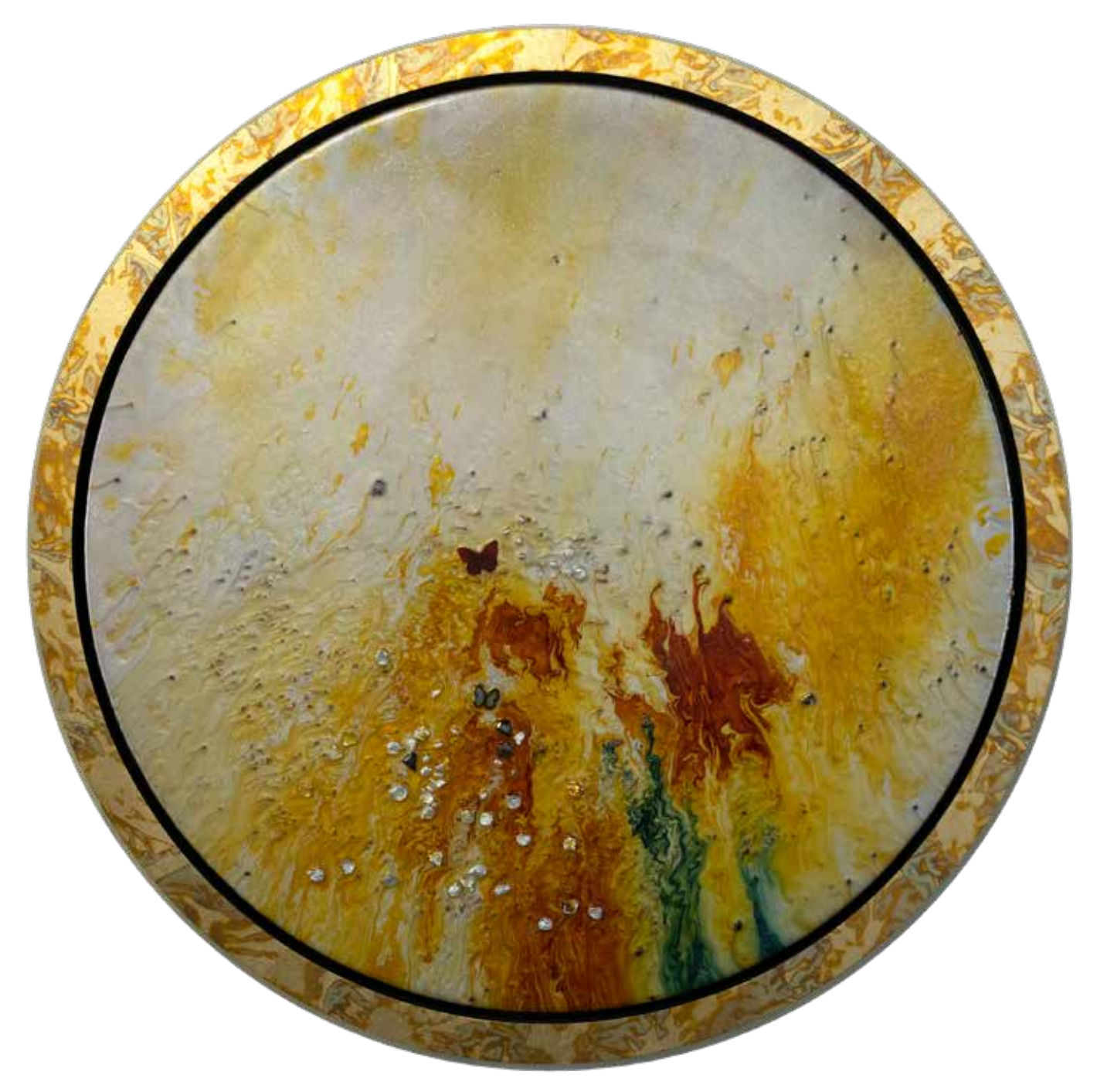
Golden Butterfly 32 in | 81 cm