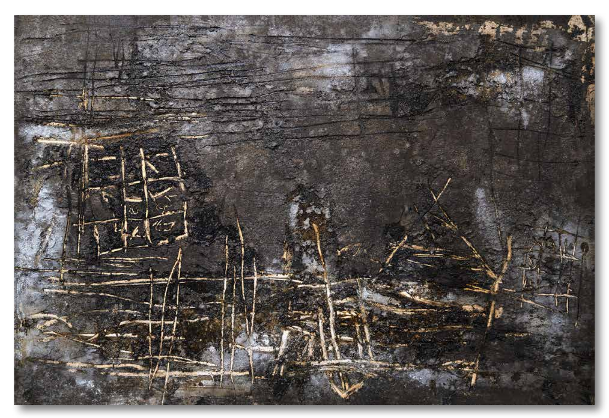
The Fisherman 60x90 in