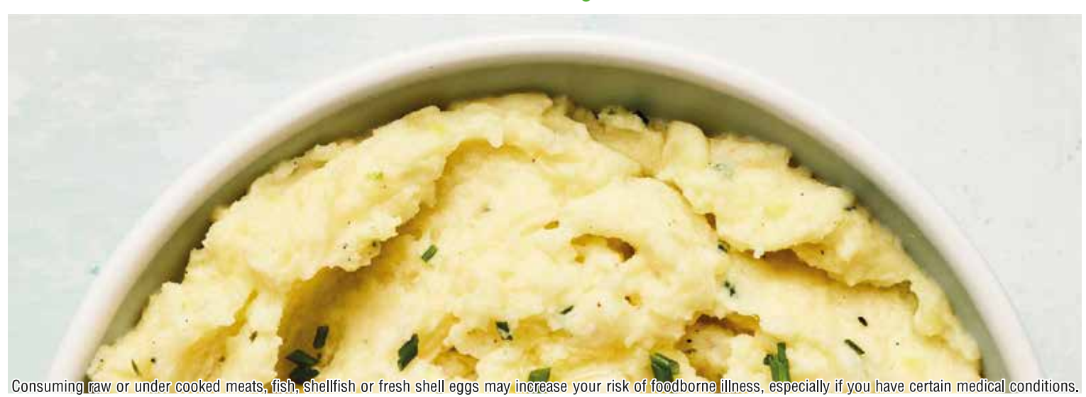
If you have food allergies, please let your server know when ordering.

Spanish Rice Rice Pilaf with Vegetables Oriental Fried Rice Brown Rice Mushroom Pilaf Yellow or White Rice