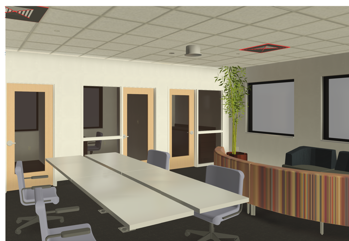
8 Perspective Not to Scale: