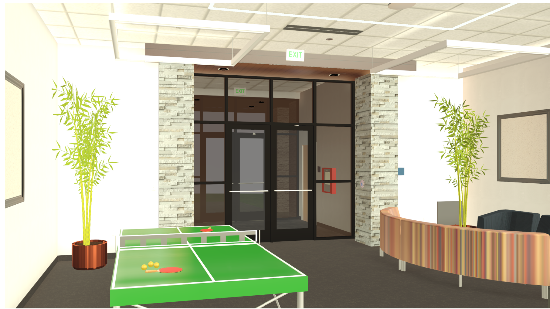
1 Perspective Not to Scale: