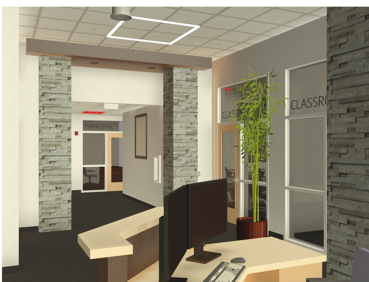
6 Perspective Not to Scale: