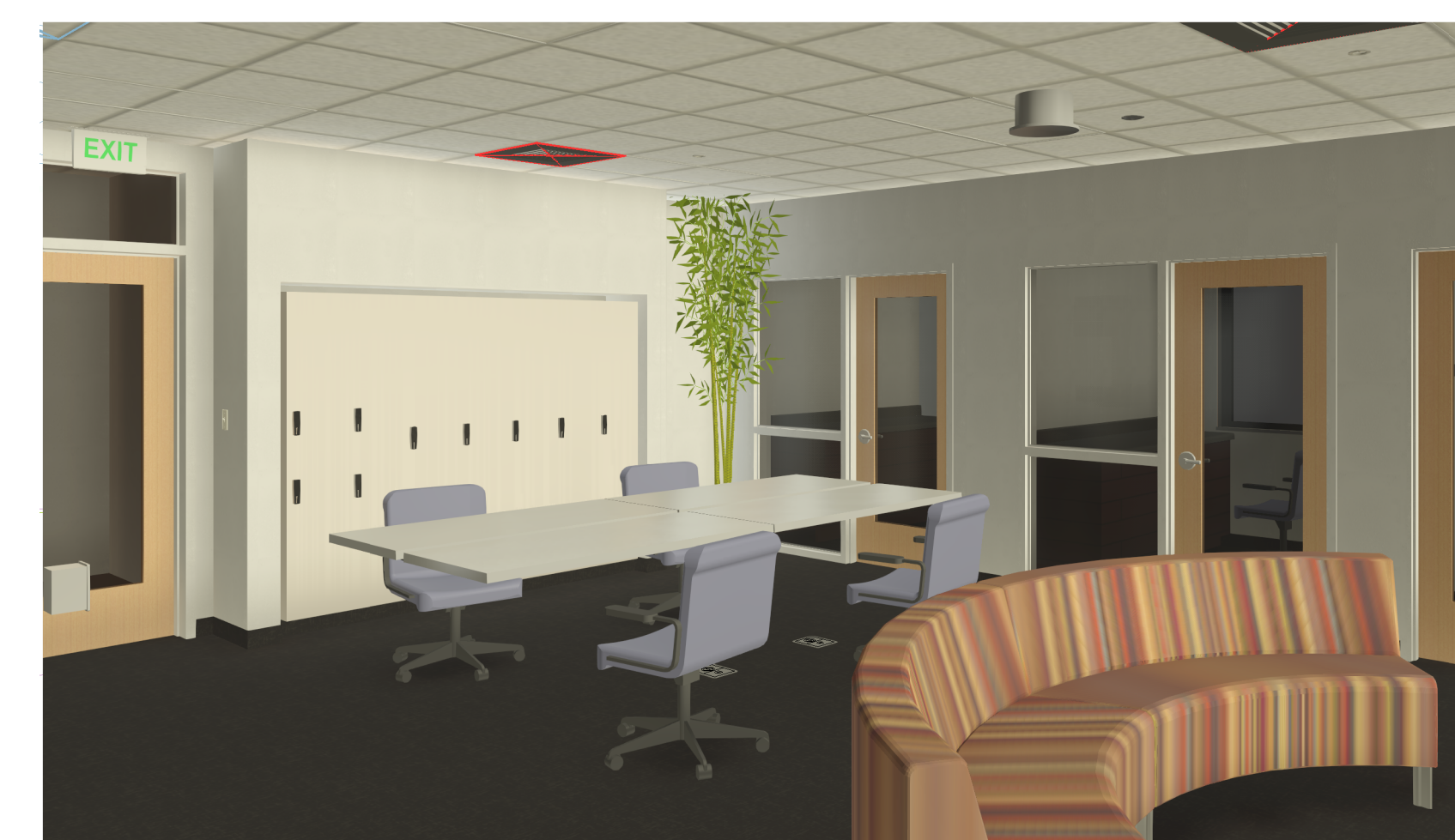
9 Perspective Not to Scale: