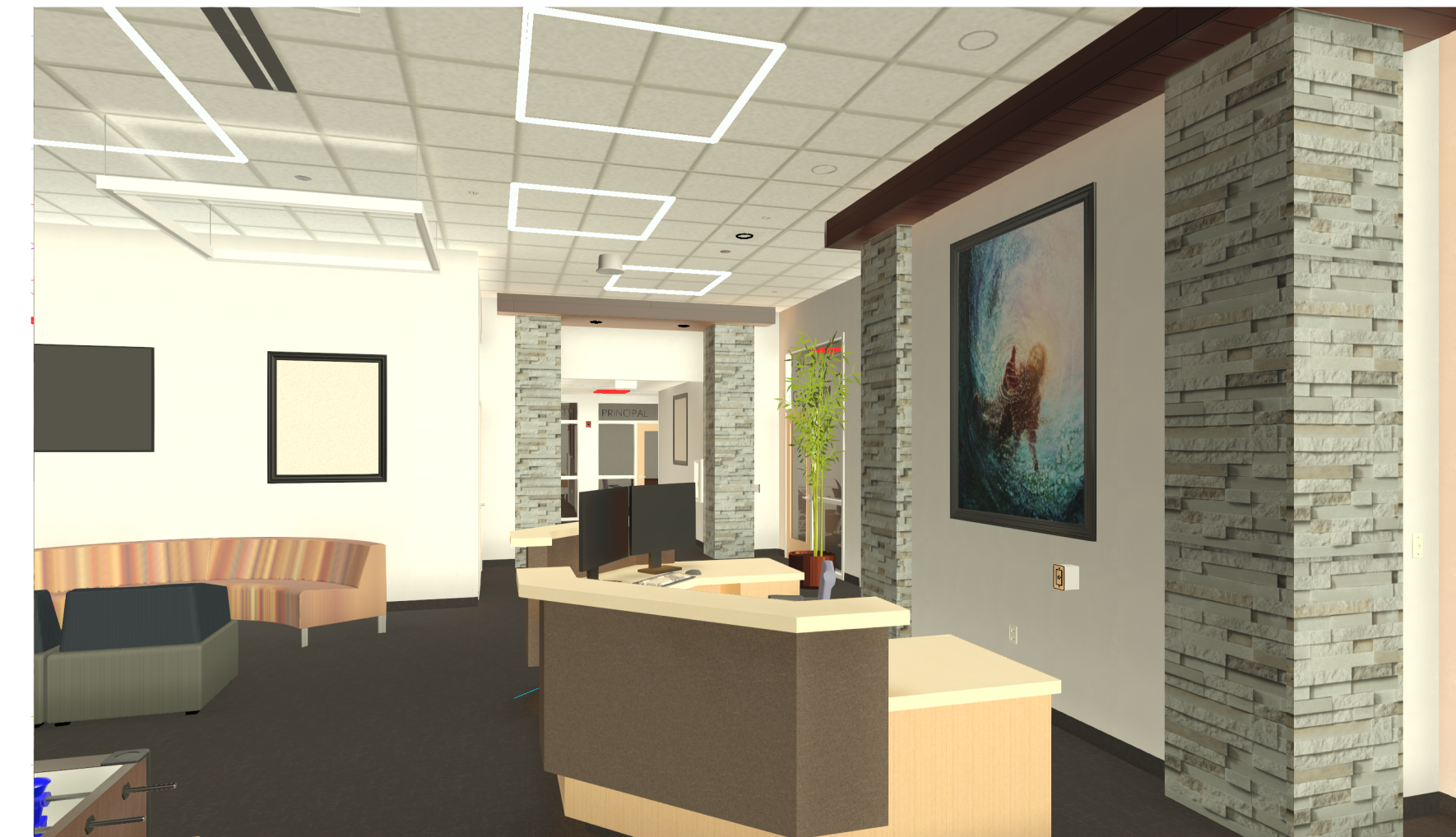
3 Perspective Not to Scale: