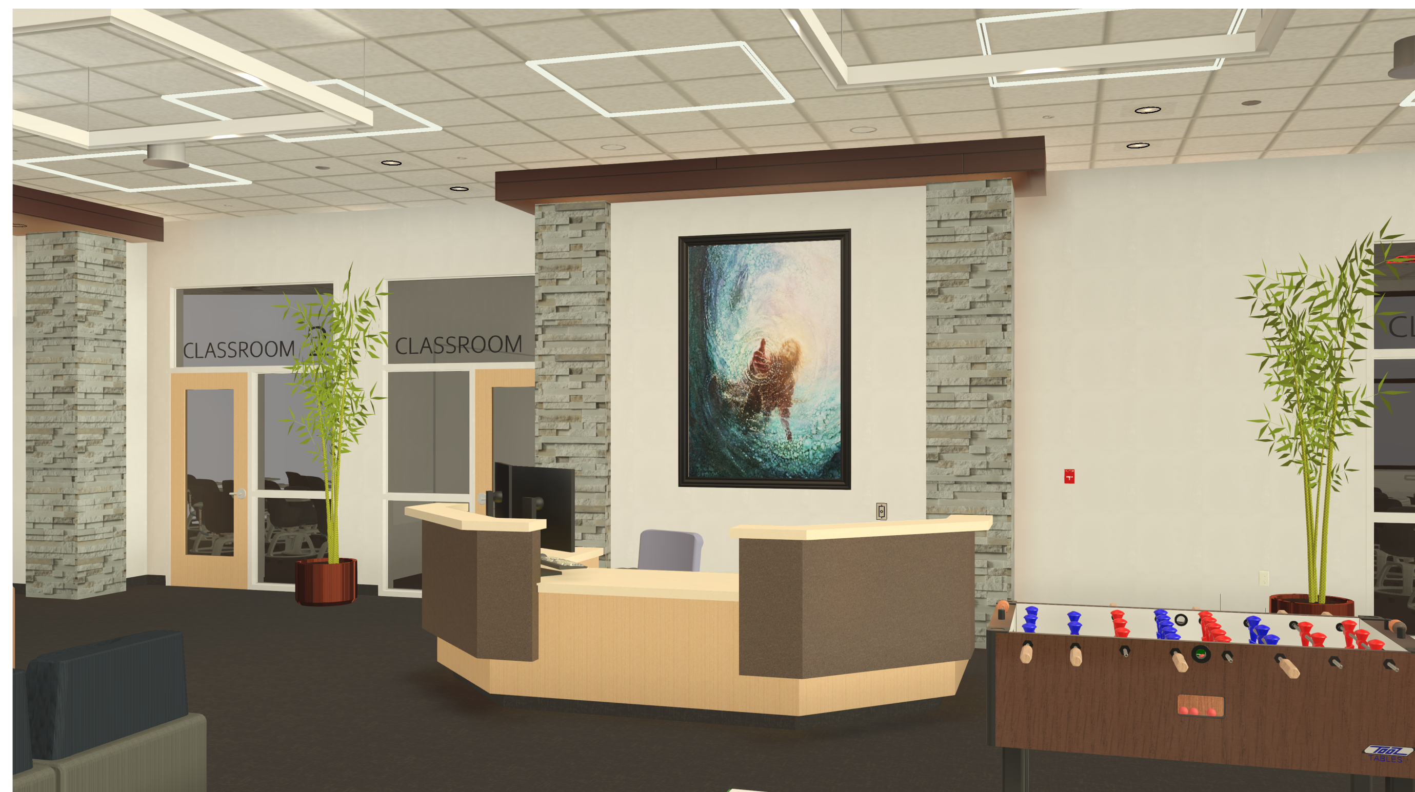
4 Perspective Not to Scale: