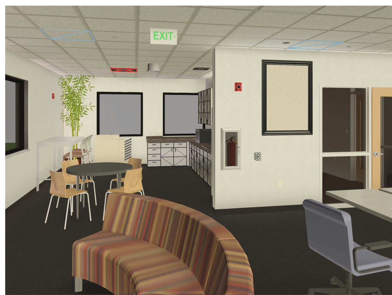
7 Perspective Not to Scale: