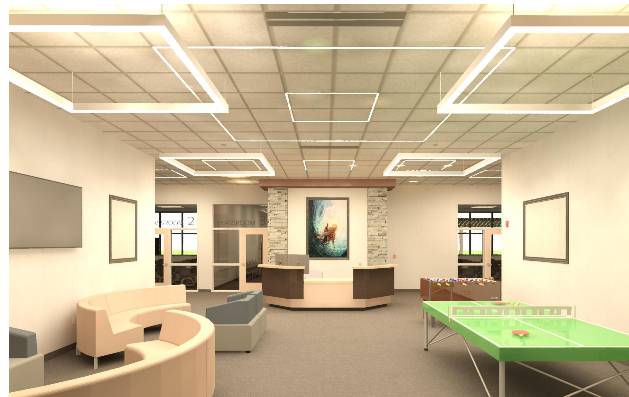
5 Perspective Not to Scale: