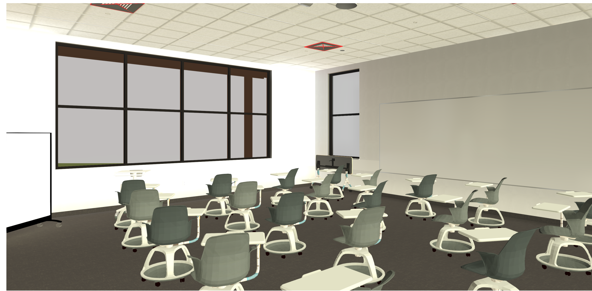
2 Perspective Not to Scale: