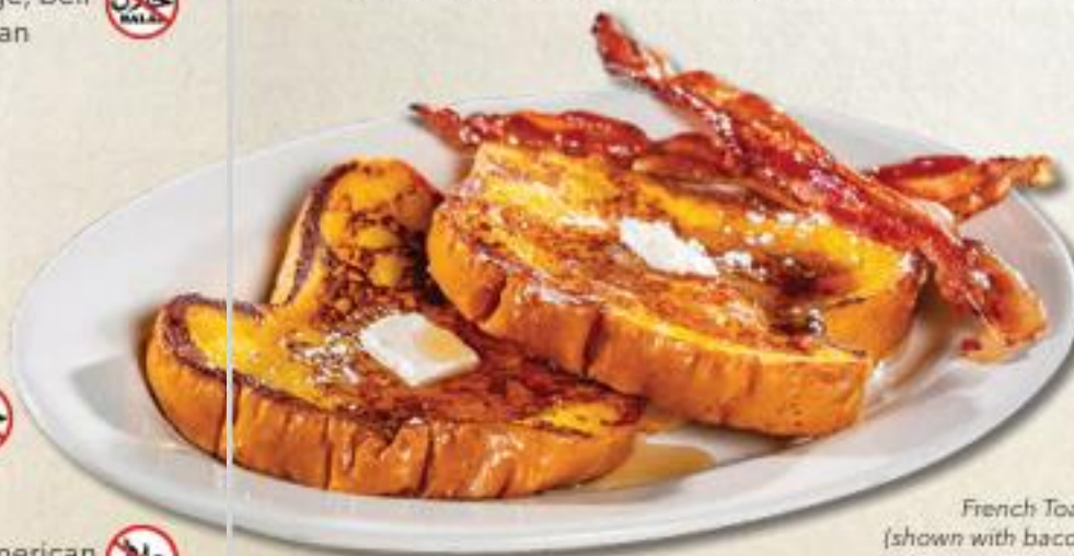
French Toast (shown with bacon)