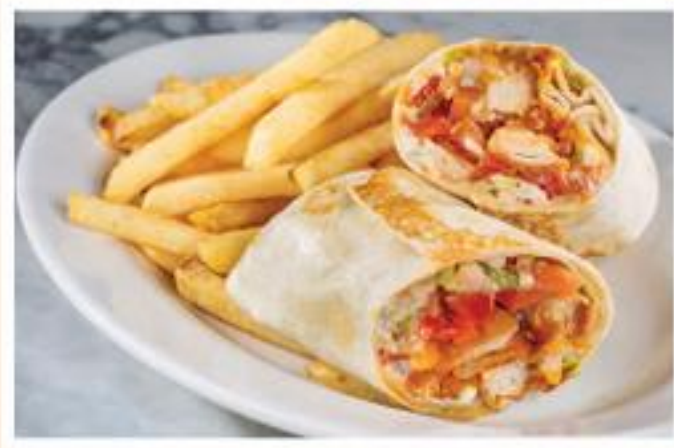
Buffalo Chicken Wrap (Fries not included)

TUNA SALAD WRAP House made tuna salad served hot or cold with lettuce, tomato and American cheese rolled up in a warm tortilla. 9.49