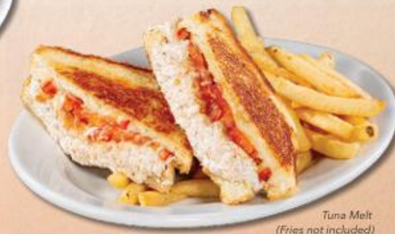
Tuna Melt (Fries not included)

Hot corn beef with sauerkraut, Thousand Island dressing and melted Swiss on grilled Rye. 9.49