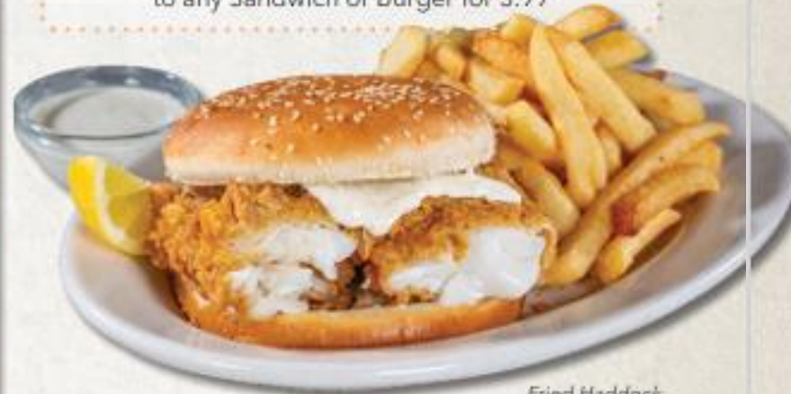
Fried Haddock (Fries not included)