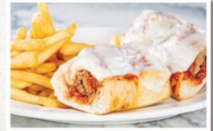
Meatball Sub (Fries not included)

CHICKEN PARMESAN SUB Hand-breaded chicken breast topped with marinara and melted provolone on a toasted French roll. 9.49