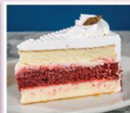
Red Velvet Cheesecake