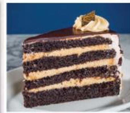
Chocolate Peanut Butter Cake