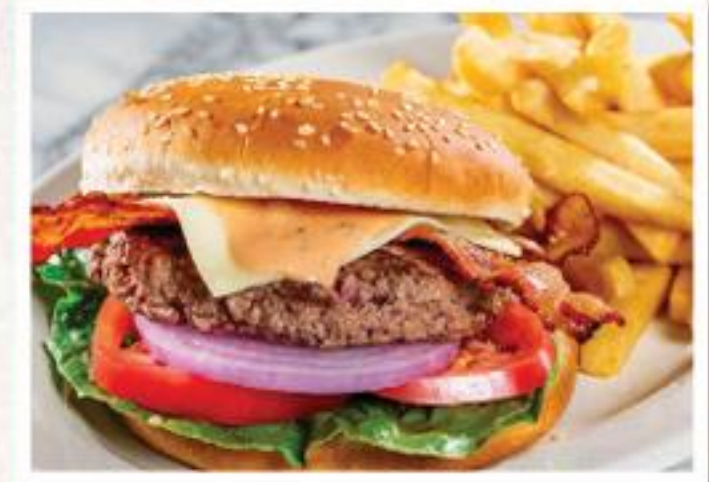
83 Burger (Fries not included)