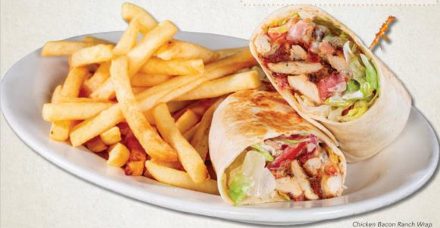
Chicken Bacon Ranch Wrap (Fries not included)

— Add — Fries or Onion Rings to any Wrap for 3.99