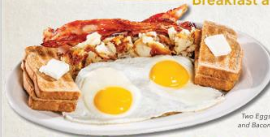
Two Eggs and Bacon