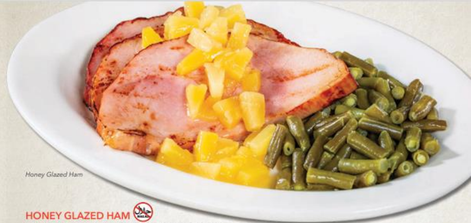
Honey Glazed Ham