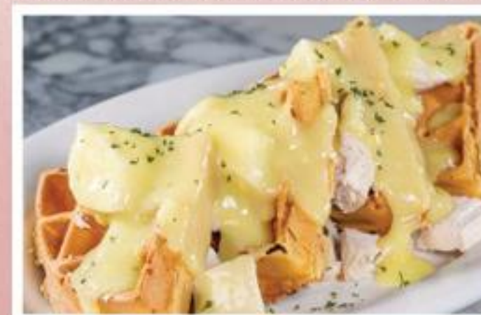
Chicken & Waffle

Charbroiled chicken breast glazed with house made BBQ sauce and topped with fried onion straws. Served with your choice of two sides. 15.99