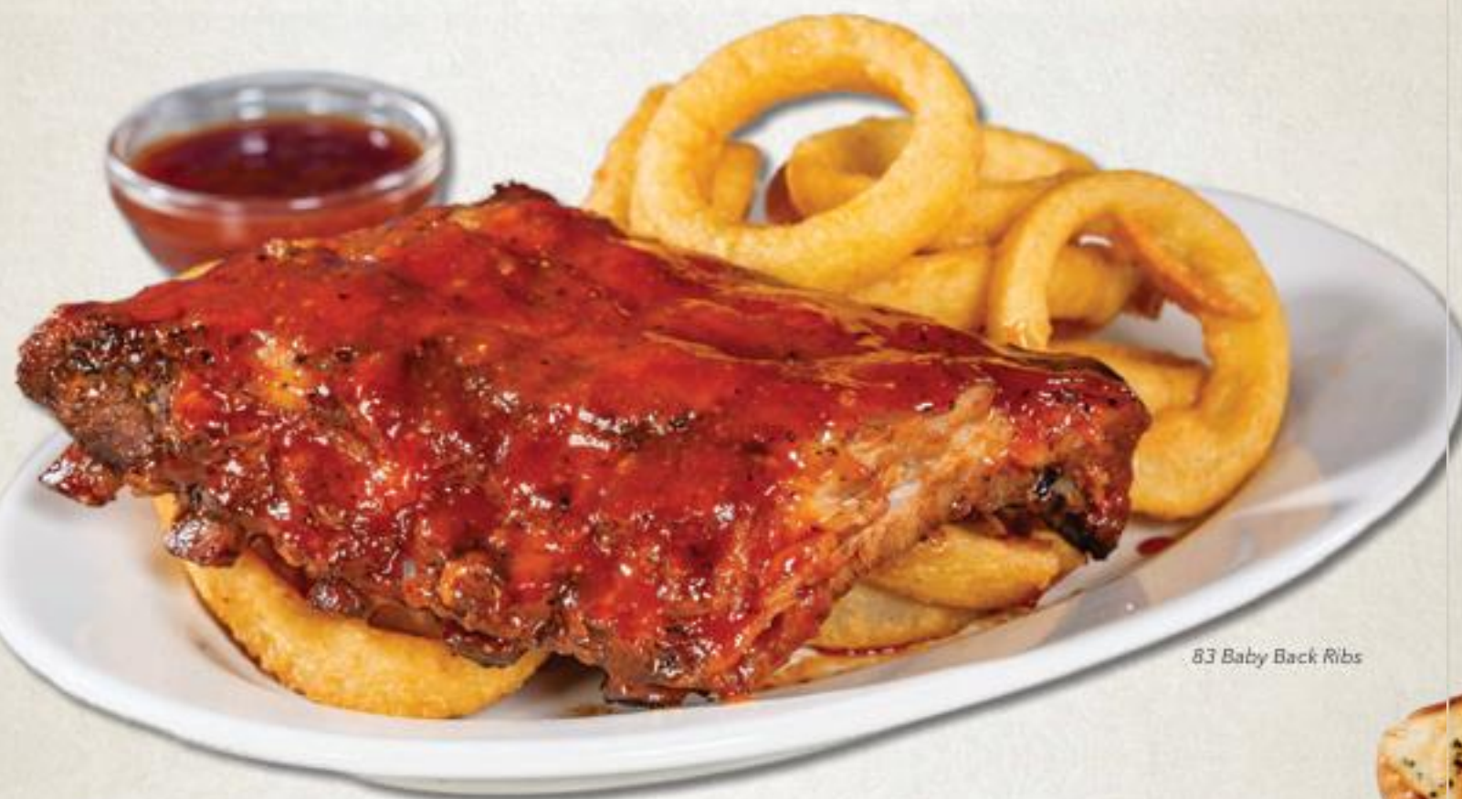
83 Baby Back Ribs