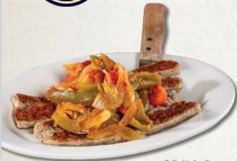
Grilled Italian Sausage