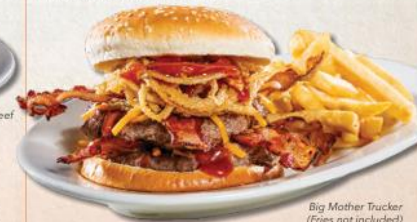
Big Mother Trucker (Fries not included)

Juicy burger with lettuce, tomato, mayonnaise and melted American cheese. 8.99