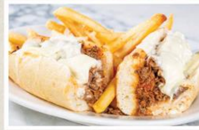
Philly Cheese Steak (Fries not included)

— Add — Fries or Onion Rings to any Sub for 3.99