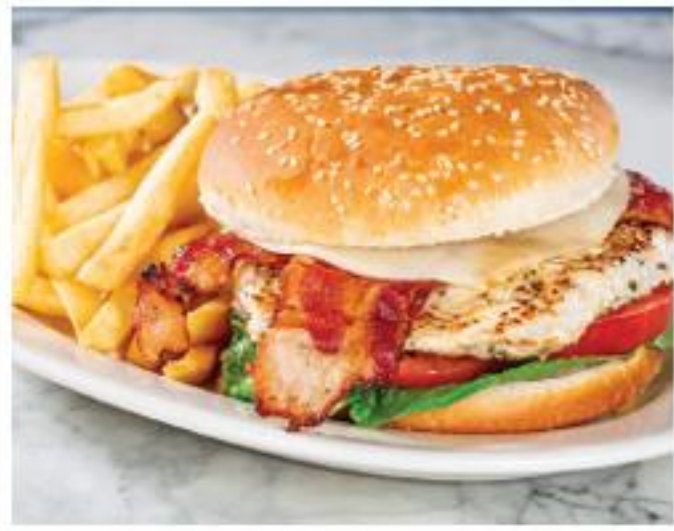
Chicken Bacon Provolone (Fries not included)

CHICKEN BACON PROVOLONE Grilled chicken breast topped with lettuce, tomato, mayonnaise, melted provolone and smoked bacon. 8.99