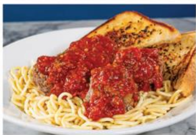
Spaghetti & Meatballs

House made meatballs tossed in our house made marinara sauce over spaghetti pasta. Served with garlic bread and a side salad. 13.99