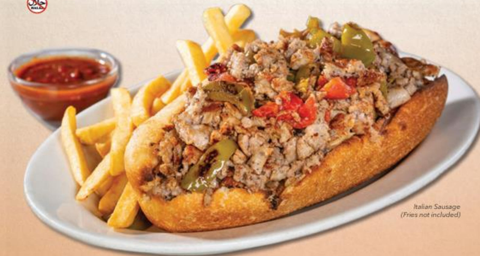
Italian Sausage (Fries not included)

Consuming raw or undercooked meats, poultry, seafood, shellfish, or eggs may increase your risk of food-borne illness.