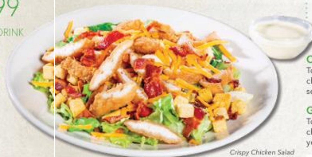
Crispy Chicken Salad