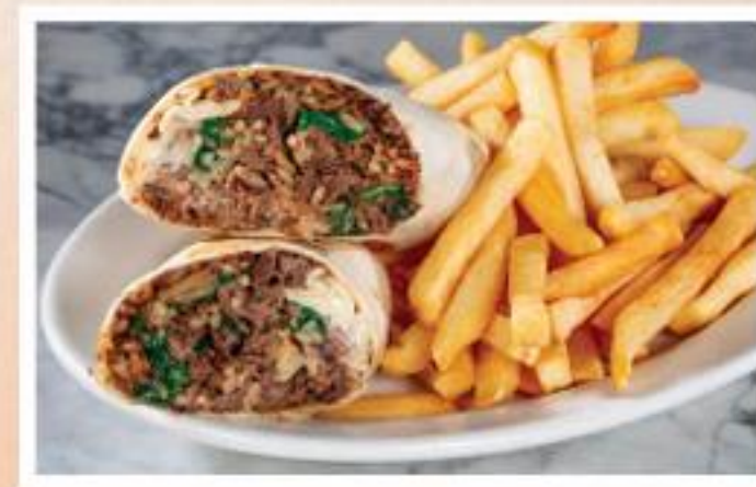
Steak Wrap (Fries not included)

CHEESEBURGER WRAP Grilled patty with melted American cheese, mayonnaise, lettuce, tomato, pickle and onion rolled up in a warm tortilla. 9.49