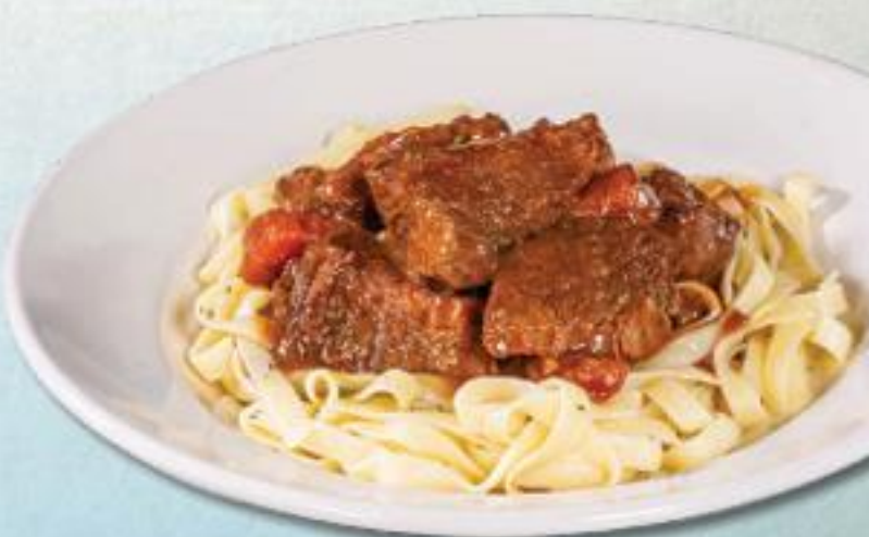
Braised Beef Tips

Slow roasted beef tips over fettuccini pasta served with a side salad. 17.99