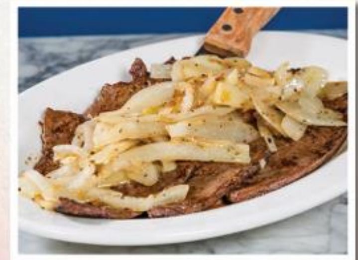
Liver & Onions

Grilled beef liver topped with sautéed onions served with your choice of two sides. 12.99