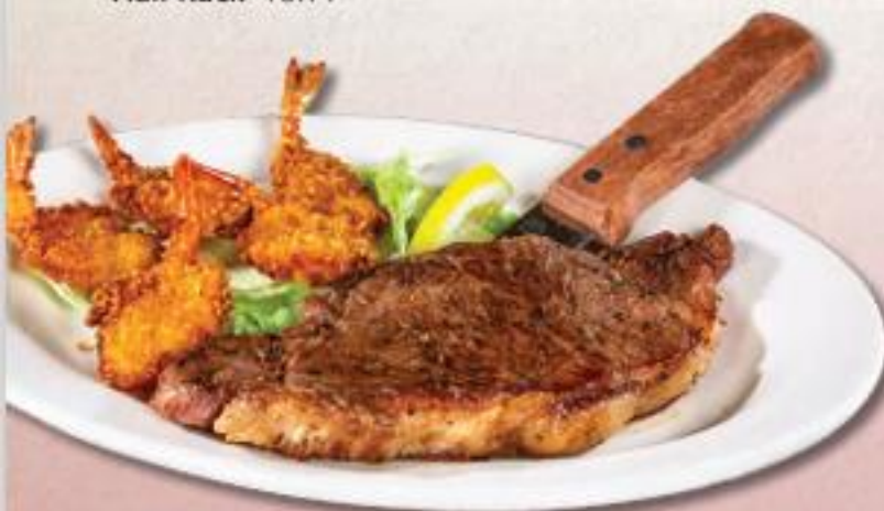
Steak and Shrimp