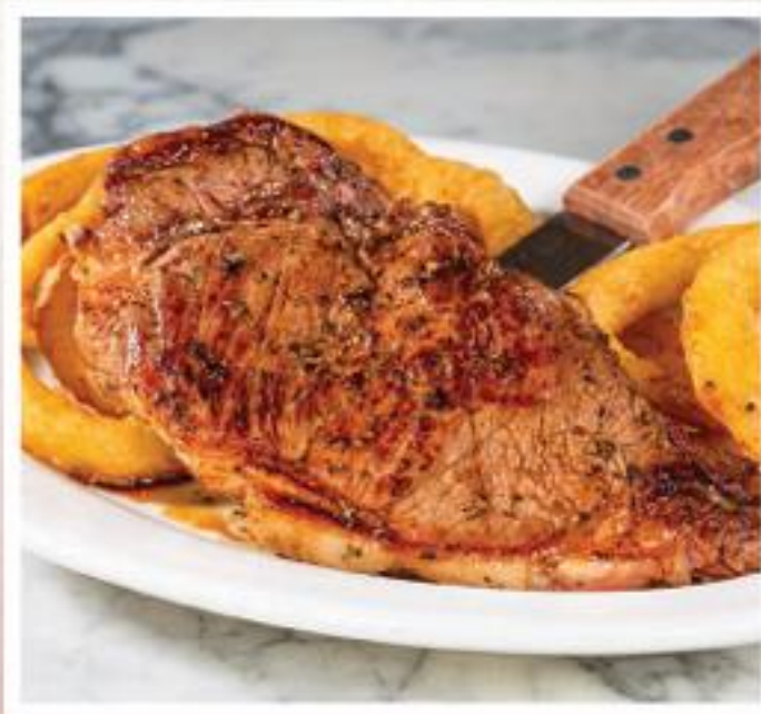
New York Strip