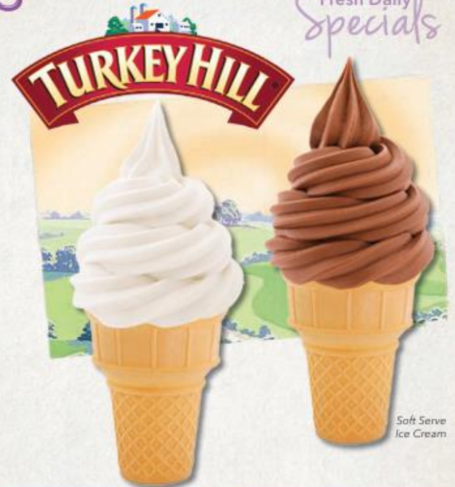
Soft Serve Ice Cream