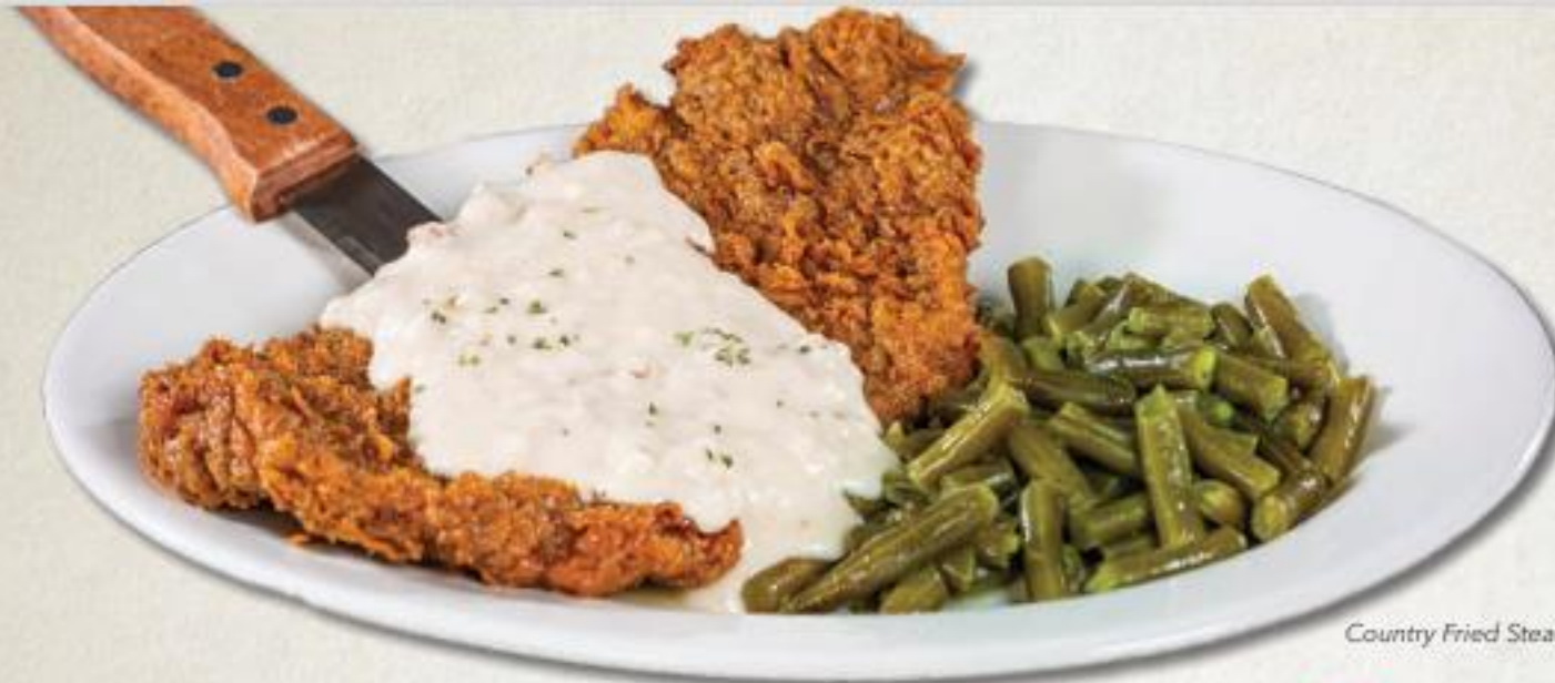
Country Fried Steak

Sautéed Onions 2.50 | Sautéed Mushrooms 3.00 Crabcake (5 oz.) 10.50 | Five Fried Shrimp 7.00