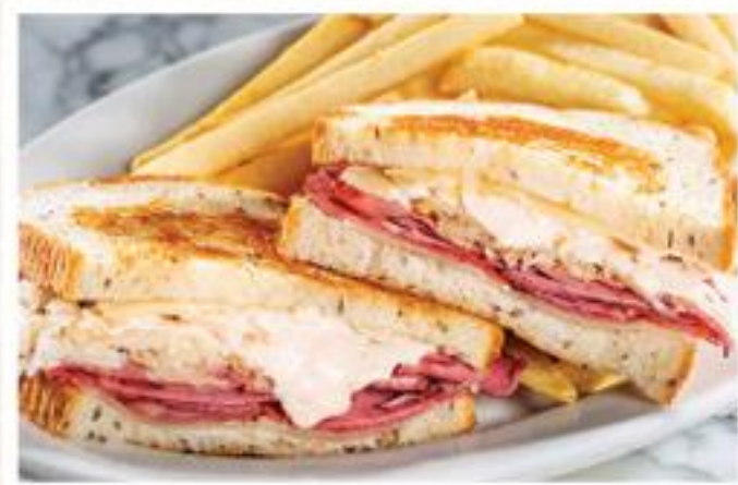
Reuben (Fries not included)

Our signature hand-breaded haddock filet served with tartar sauce. 11.99