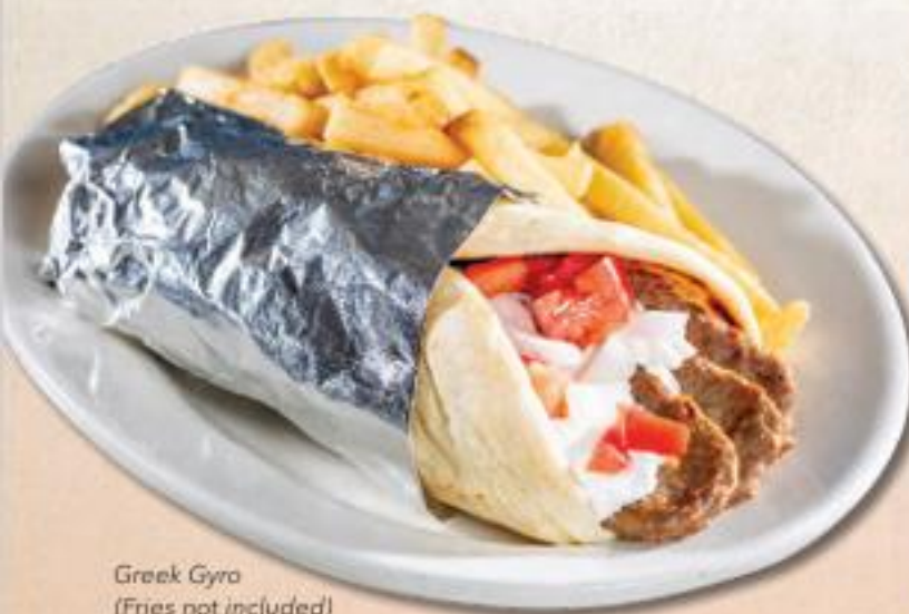
Greek Gyro (Fries not included)

CHICKEN EL PASO Grilled chicken breast with bacon, BBQ sauce, fried onion straws and melted cheddar cheese. 9.49