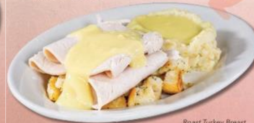
Roast Turkey Breast

Your choice of our flavorful roast beef or our freshly baked turkey breast over house made stuffing topped with gravy and served with your choice of two sides. 15.49