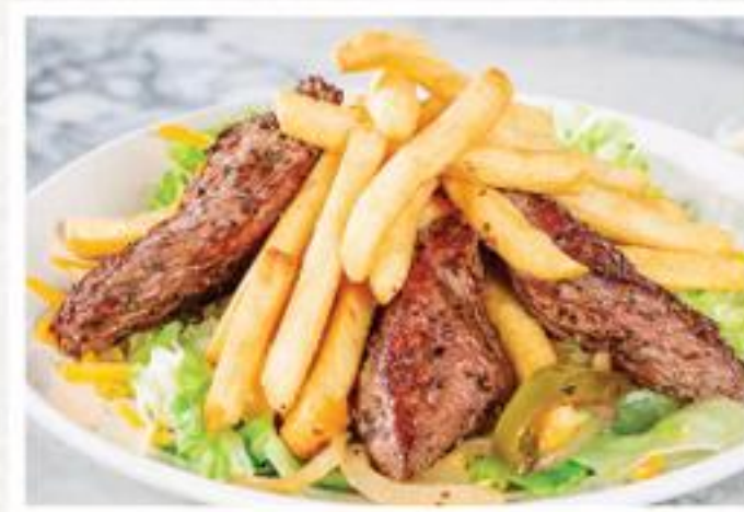
Pittsburgh Steak Salad