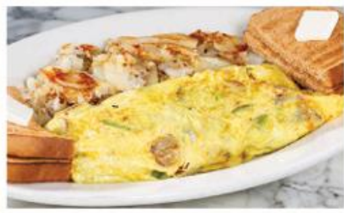
Sausage Jalapeño & Cheddar Omelet

Three egg omelet with melted American cheese. 8.49