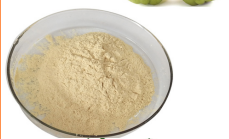
Aloe Liquid Extract