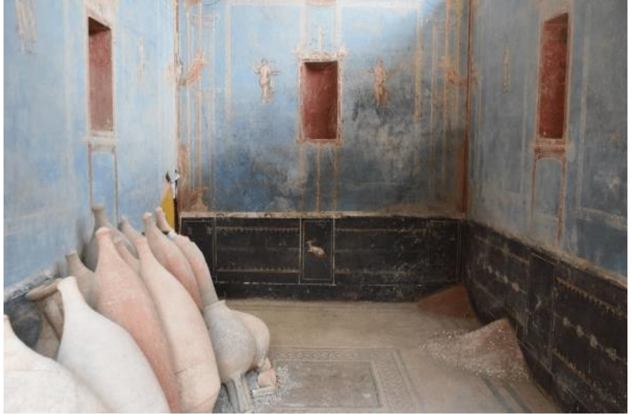
The 'blue room' at Pompeii.