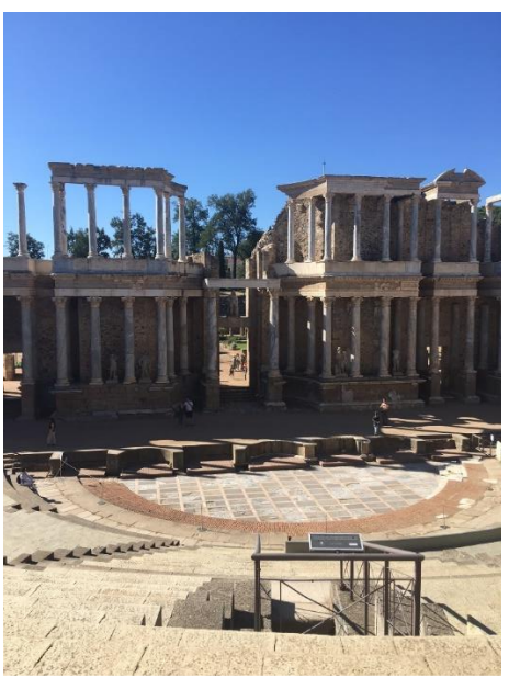
Coming soon to CTT: Merida Spain, Teatro Romano.