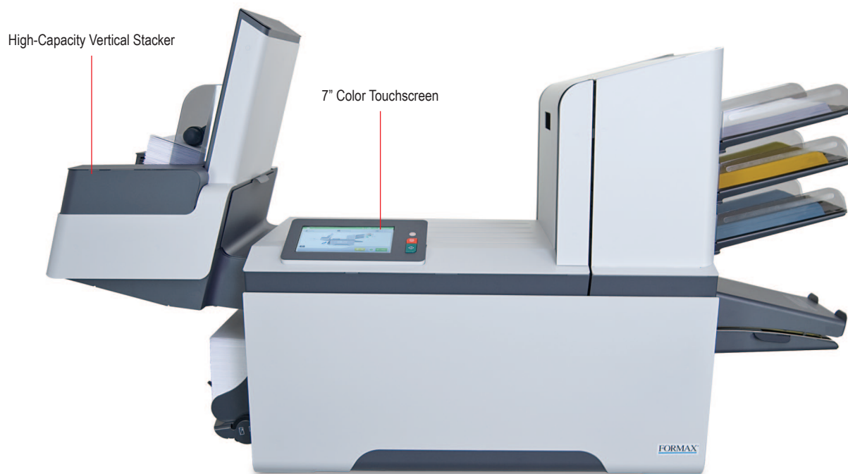
FD 6306-Standard 3 with High-Capacity Vertical Output Stacker