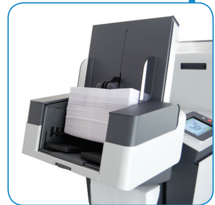
High-Capacity Vertical Stacker holds up to 500 filled envelopes