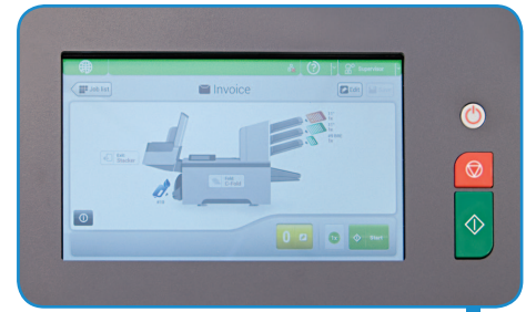
Full-color 7" touchscreen control panel with graphical interface and paper /envelope presence sensors

* Paper & envelope specifications may vary. All media must be tested.