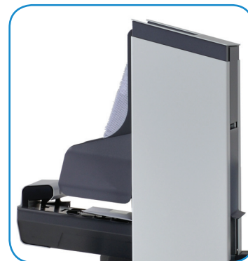
High-Capacity Vertical Output Stacker

** Bottom-address documents can be processed only in Half and Z-fold modes, up to 5 sheets.