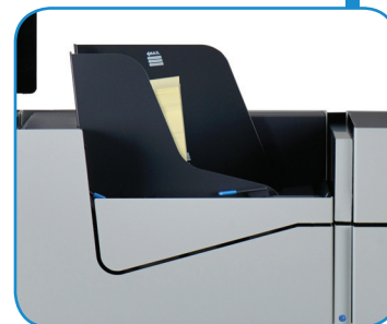
Thin Booklet Feeder