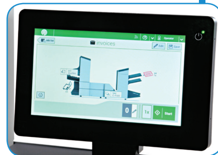
Color Touchscreen Control with Paper Presence Sensors & Graphical On-Screen Display