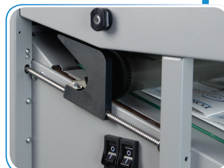
Automatic outfeed rollers