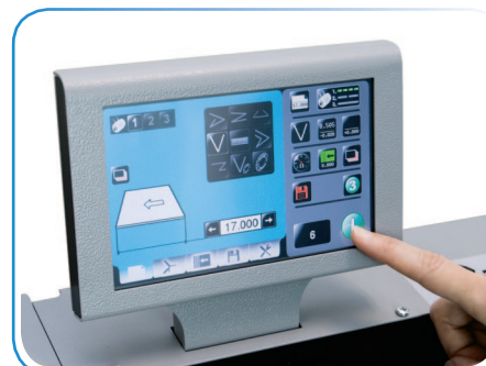
Color touchscreen control panel