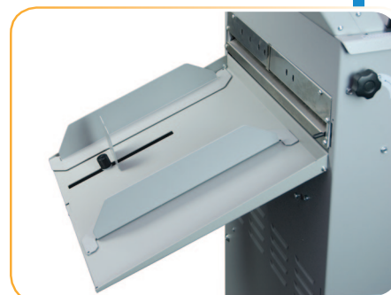
Perforation / score attachment, included

Formax – New Hampshire, USA www.formax.com