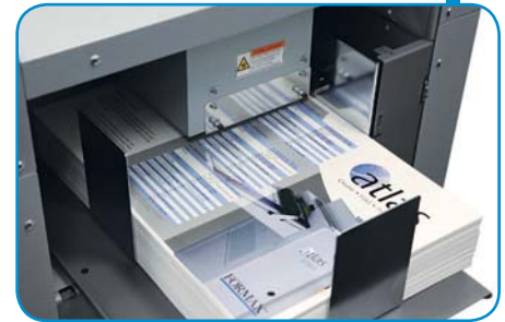
Upper-belt tri-suction feed system for accurate feeding of large & heavy stocks