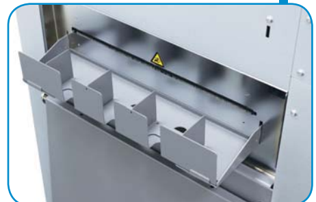
Business card catch tray