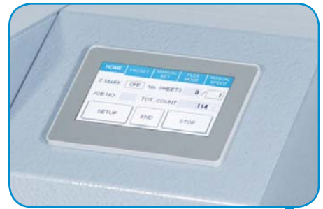
Color touchscreen control panel

* Speed varies depending on paper weight