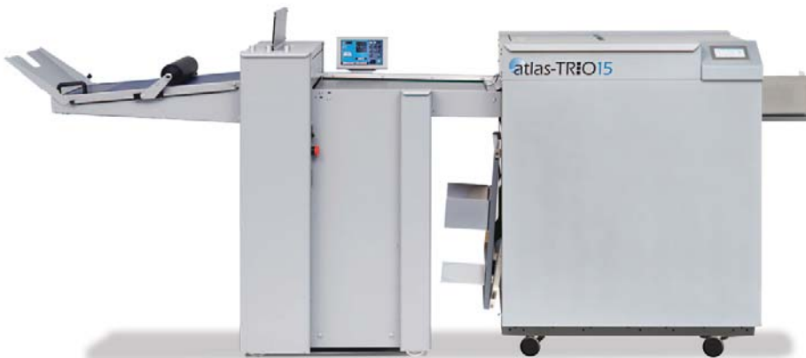
Pair the Atlas-TRIO15 with the optional AC-10 Folding Unit to slit, cut, crease and fold in one streamlined pass

11" x 17" Sheet: 4-up postcard, single crease ledger