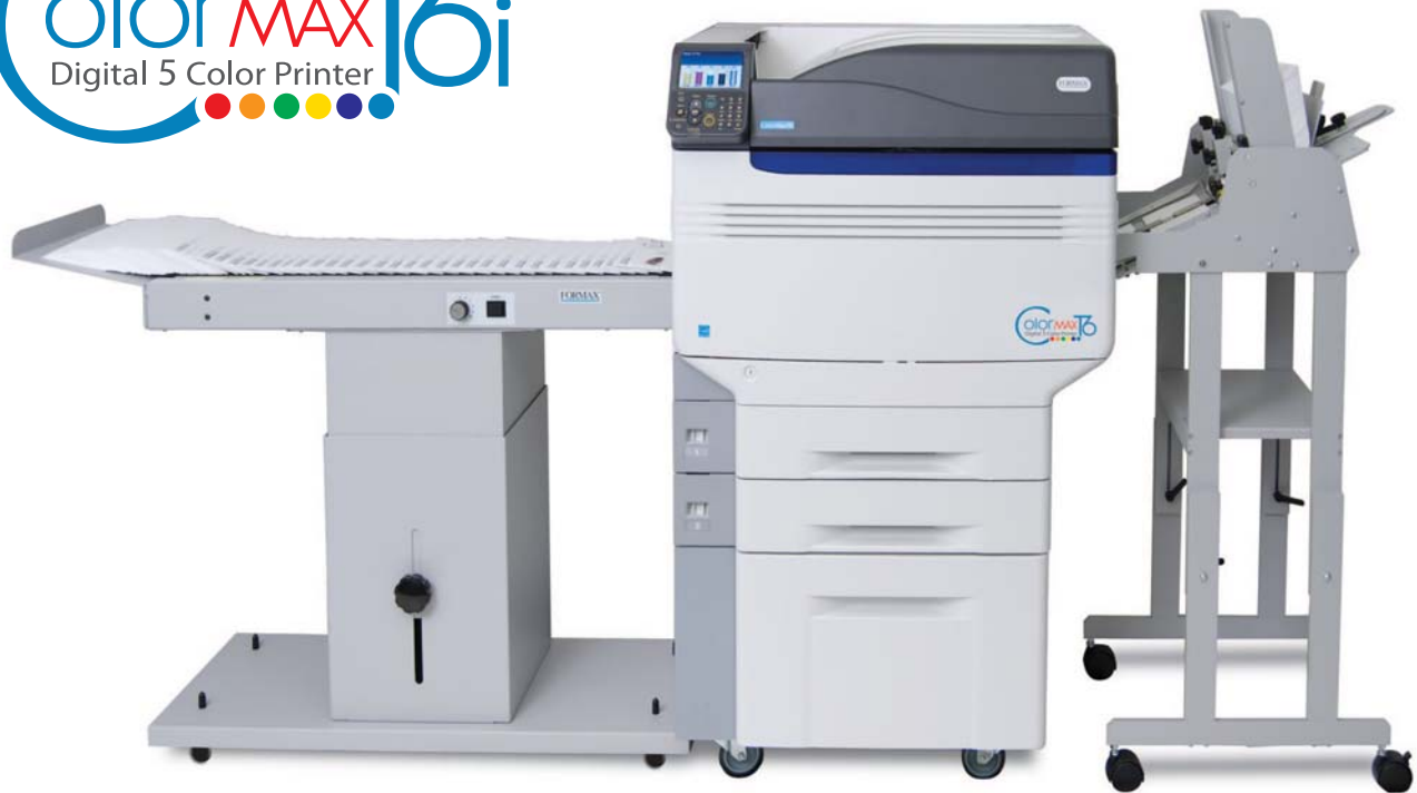
ColorMaxT6 System: Digital 5+ Color Printer, Output Conveyor and Envelope Feeder