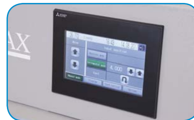
Touchscreen control panel allows for programming up to 100 jobs