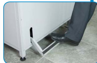
Foot pedal pre-clamp holds paper to check alignment prior to cutting