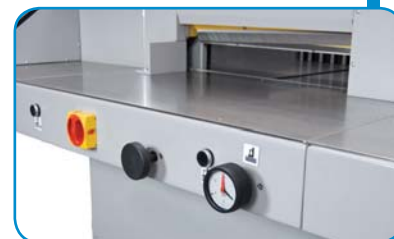
Two-button operation, fine-tune knob, adjustable hydraulic pressure gauge