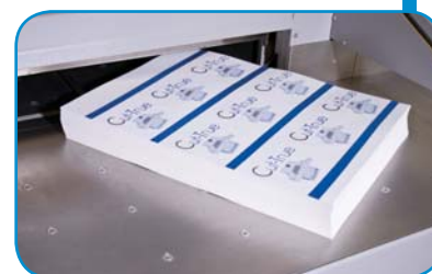
Air-assist ball deck helps operators process large and/or heavy paper stacks with ease