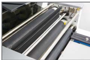
Knife Fold Chassis