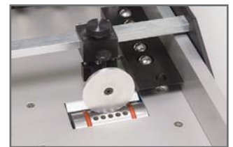
Bottom Vacuum Feed with Register Guide

The COUNT™ KF-250 is ideal for anyone with an existing creasing machine or a multi-directional slitter/cutter/creaser. This machine is ideal for use in applications with heavier stock where standard buckle folders cannot get the job done. The KF-250 provides a clean fold without cracking or bending stocks up to 350 gsm.