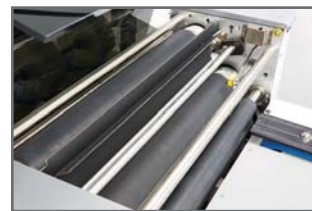
Knife Fold Chassis