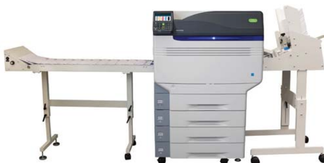
HD-CX1700 shown with optional 3-in-1 paper tray and high capacity envelope feeder and auto shingling conveyor system for maximum productivity.

The high-capacity toner cartridges also make this one of the most affordable toner-based envelope printing systems available.