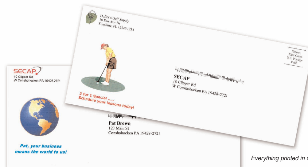
Everything printed in one pass.

Personalizing and using color on your outgoing mail just got faster and easier. With the SA3150, you can do both, making a good thing even better. Print in brilliant full color for eye-catching appeal that gets attention and makes your piece stand out in a heap of mail! Use color in your logo and graphics. Personalize using your customer's name for greater impact and effectiveness. Best of all, do all this in one pass for maximum productivity!