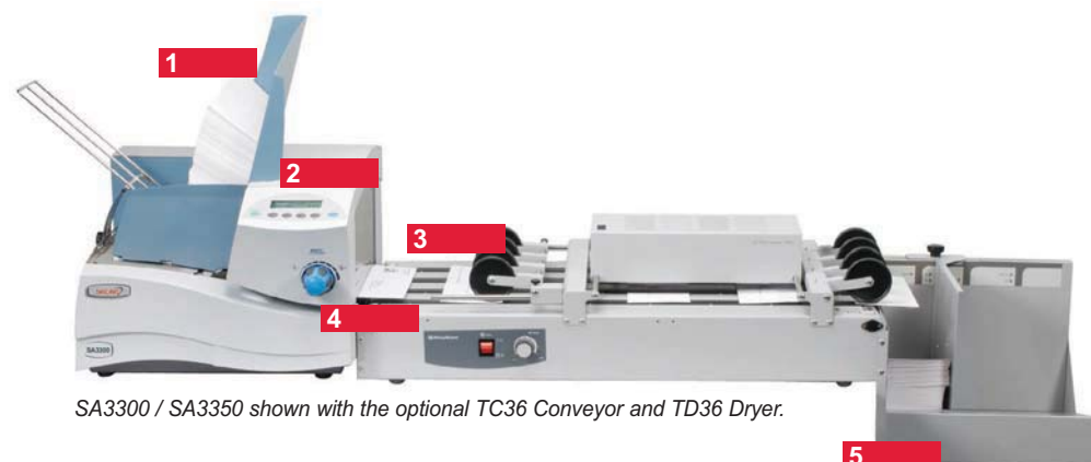
SA3300 / SA3350 shown with the optional TC36 Conveyor and TD36 Dryer.

The TC36 Conveyor and TD36 Dryer with drop stacker are available as options for the SA3300 / SA3350. They provide improved drying and convenient stacking of materials for high volume runs.