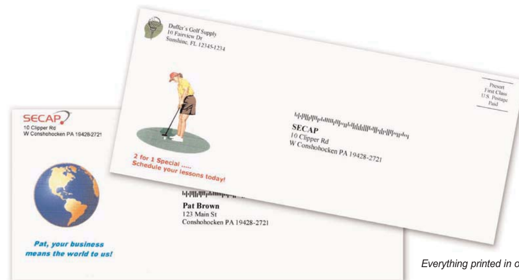
Everything printed in one pass.

Personalizing and using color on your outgoing mail just got faster and easier. With the SA3350, you can do both, making a good thing even better. Print in brilliant full color for eye-catching appeal that gets attention and makes your piece stand out in a heap of mail! Use color in your logo and graphics. Personalize using your customer's name for greater impact and effectiveness. Best of all, do all this in one pass for maximum productivity!