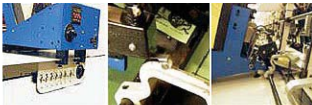
Easy front table mounting