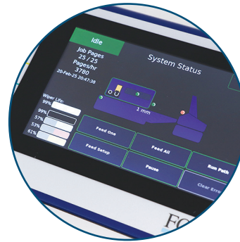
Touchscreen Control Panel For centralized operation and easy adjustments