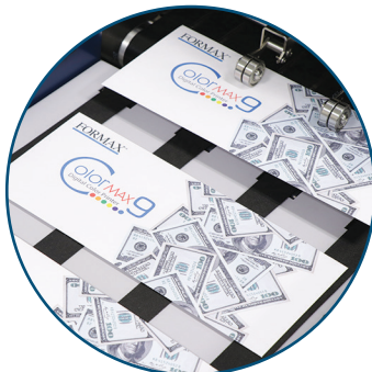
Processes up to 10,000 #10 envelopes per hour: Production speeds in a robust tabletop printer