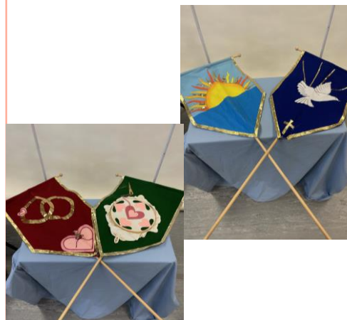
Banners: Marriage, Work