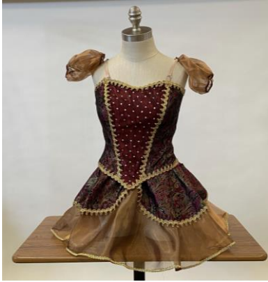
Mazurka (F) Lead 1