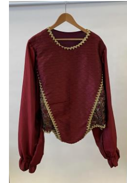
Mazurka (M) Lead 2