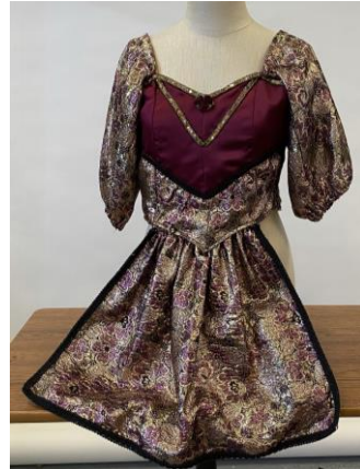
Mazurka (F) Lead 2