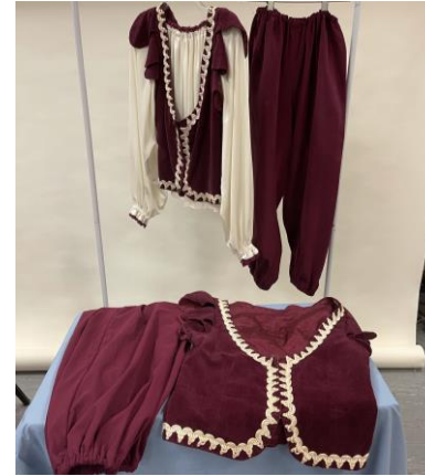
Mazurka (M) Lead 1