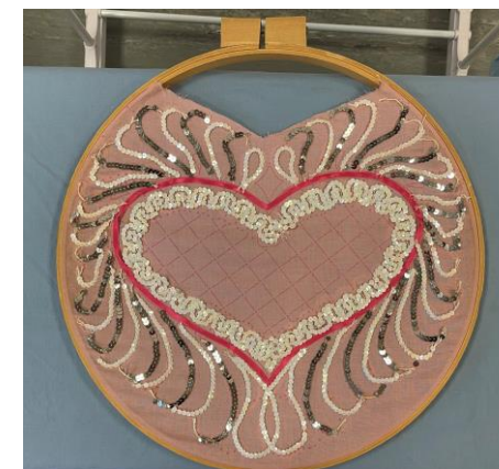
Work: Embroidery Hoops