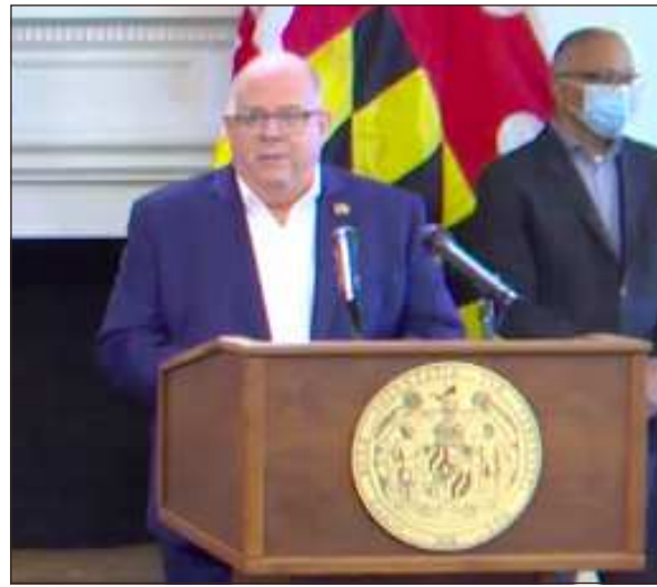
Maryland Gov. Larry Hogan announced Wednesday, June 10, further developments in the state's Roadmap to Recovery plan.