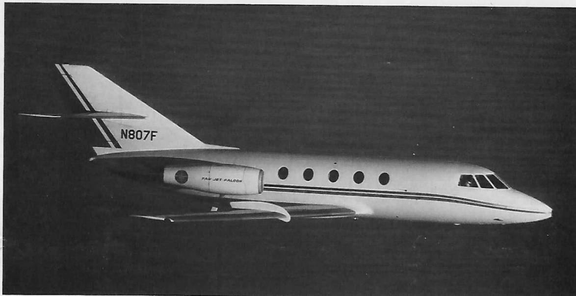
Dassault Falcon 20 features improved control response with Sperry autopilot