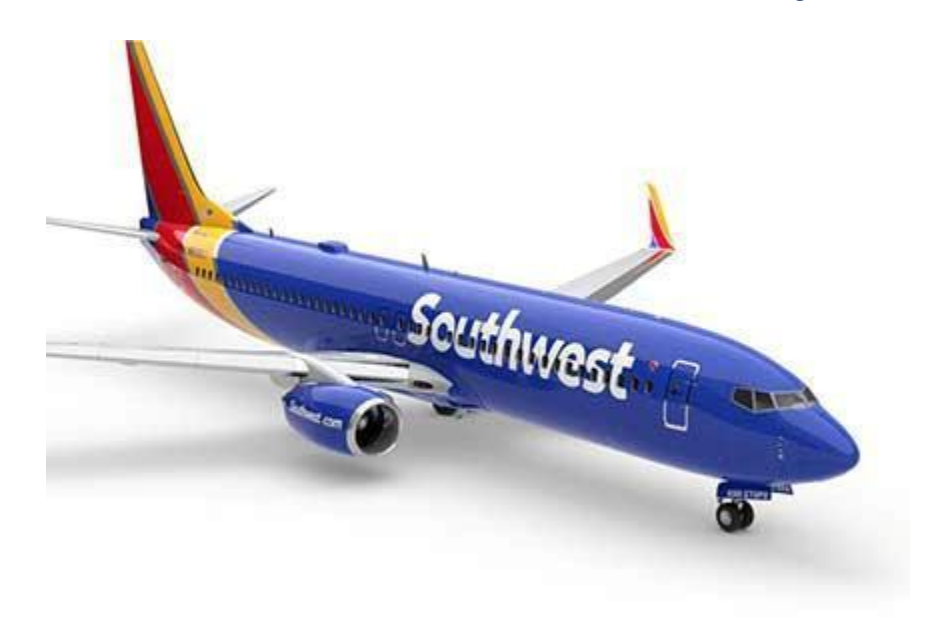
Wednesday February 6, 2019

This is a unique opportunity to tour Southwest Airlines Maintenance Facility.