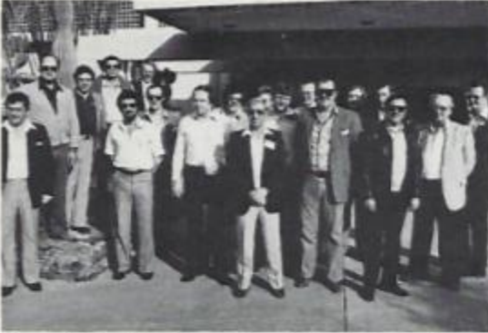
We couldn't get the Vienna Boys Choir to sing for the sales meeting, so the tour group volunteered. Members in sunglasses preferred to remain anonymous.